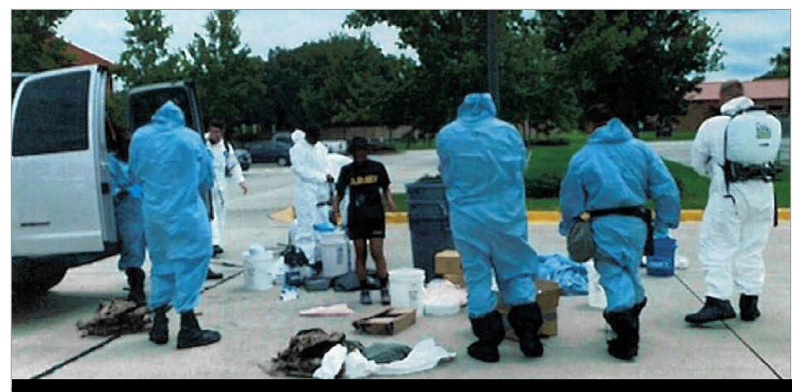
Figure 1. Hunter Army Airfield Personnel Wearing PPE While Disinfecting Affected Areas

DoD and DoD contractor personnel at the DoD installations we reviewed reported that their staff used PPE, in accordance with CDC guidance, when disinfecting affected areas. For example, after Hunter Army Airfield personnel reported that after they learned an infected individual had occupied a residential building on the installation, Hunter Army Airfield personnel wore PPE, such as chemical protective masks, gowns, face masks, gloves, and boots, as they disinfected the affected areas inside the building. Figure 1 shows examples of PPE that Hunter Army Airfield personnel wore during the disinfection of affected areas.