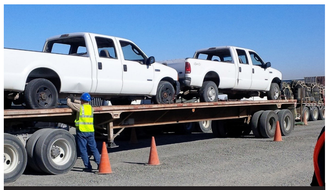
Figure 2. DLA Disposition Services Personnel Receive Trucks at the DLA Disposition Services Site in Kuwait

DLA Disposition Services officials properly processed and disposed of equipment in Kuwait. Officials received, demilitarized, and scrapped equipment in accordance with DoD guidance. For example, DoD Manual 4160.21 requires DLA Disposition Services sites to inspect and obtain physical receipt of equipment and verify identity and quantities.<sup>11</sup> During our site visit, we observed DLA Disposition Services Kuwait officials complete this requirement. For example, the officials received and inspected multiple trucks, verified that the customer properly completed and provided all turn-in documents, then signed the turn-in documents, provided a copy to the customer, and entered the information in the accountability system of record. In addition, we reviewed documentation provided from FY 2017 and equipment on-site in Kuwait. We determined that turn-in documentation was adequately completed and processed in the system of accountable record. Figure 2 shows DLA Disposition Services personnel receiving trucks for disposal at the DLA Disposition Services Kuwait site.