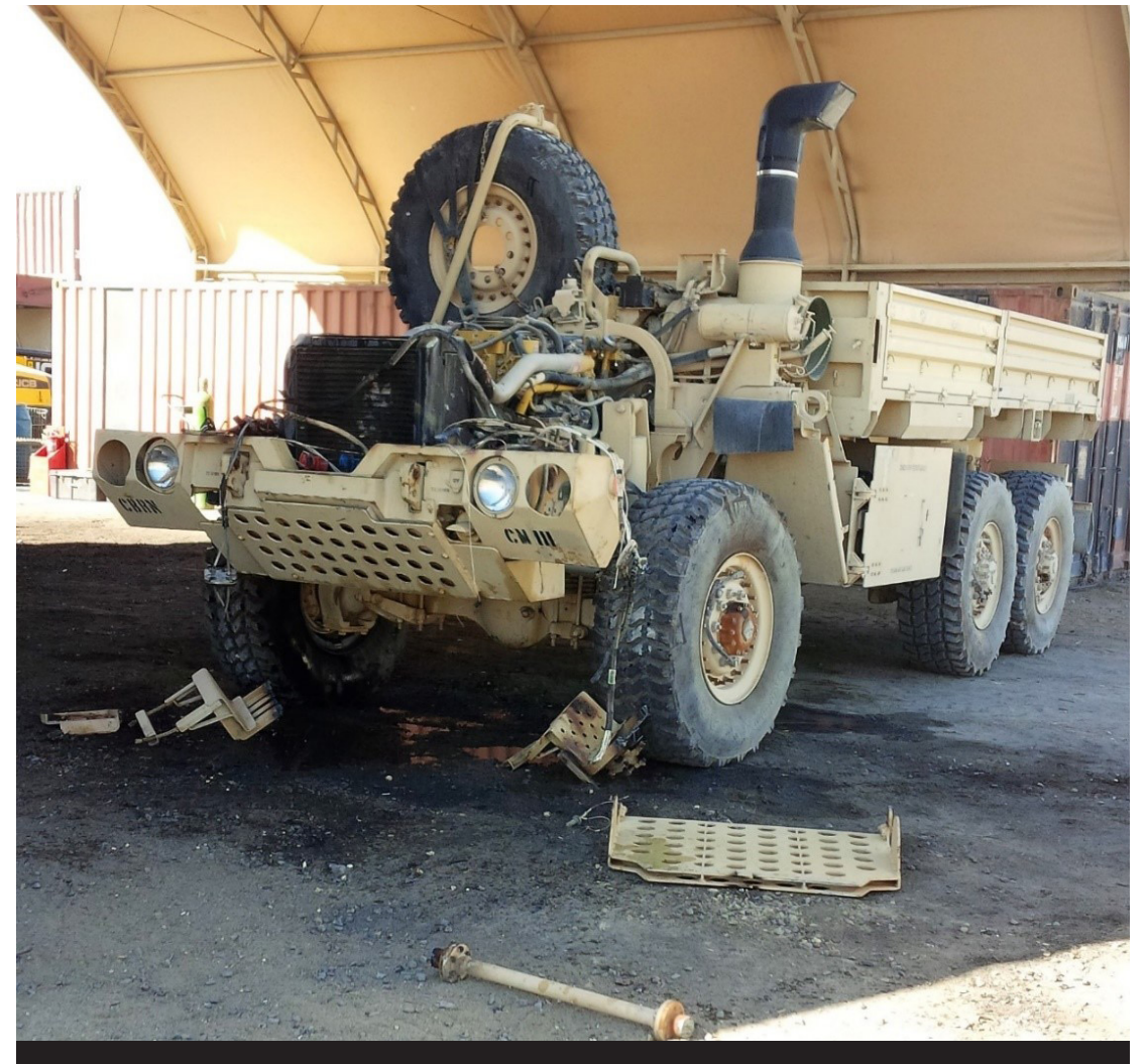
Figure 3. Vehicle Demilitarized at the DLA Disposition Services Kuwait Site

DoD Manual 4160.28 also requires DLA Disposition Services officials to demilitarize equipment to eliminate its functional capabilities and inherent military design features. 12 We observed that personnel consistently demilitarized equipment in accordance with the DoD Manual. For example, we observed and verified that vehicles were demilitarized to eliminate their functional capabilities. In addition, we reviewed and verified demilitarization reports identified authorized officials conducted adequate oversight of demilitarization operations. Figure 3 shows a vehicle being demilitarized at the DLA Disposition Services Kuwait site.