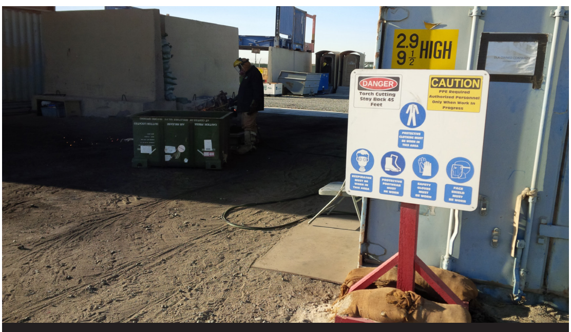
Figure 4. Sign Showing PPE Required for Torching Area at DLA Disposition Services Kuwait

DLA Disposition Services Kuwait officials did not ensure that all personnel responsible for disposing of equipment consistently wore the required PPE. According to the Gulf Civilization General Trading contract, contractor personnel must comply with all safety and health requirements set forth in applicable DoD, DLA, host nation, and host installation safety policies. However, during our site visit, we observed contractor personnel who did not wear the required PPE while performing hazardous tasks. For example, according to signs around the torch cutting area, all personnel within 45 feet of ongoing operations are required to wear a face shield, respiratory mask, gloves, and other protective items. However, we observed a contractor wearing only a hardhat in the torching area while equipment was being demilitarized. Specifically, the contractor approached a piece of equipment as torching was occurring, exposing himself to hazards, such as flammable liquids and gases. Figure 4 shows a safety sign that displays the required PPE for the torching area at DLA Disposition Services Kuwait.