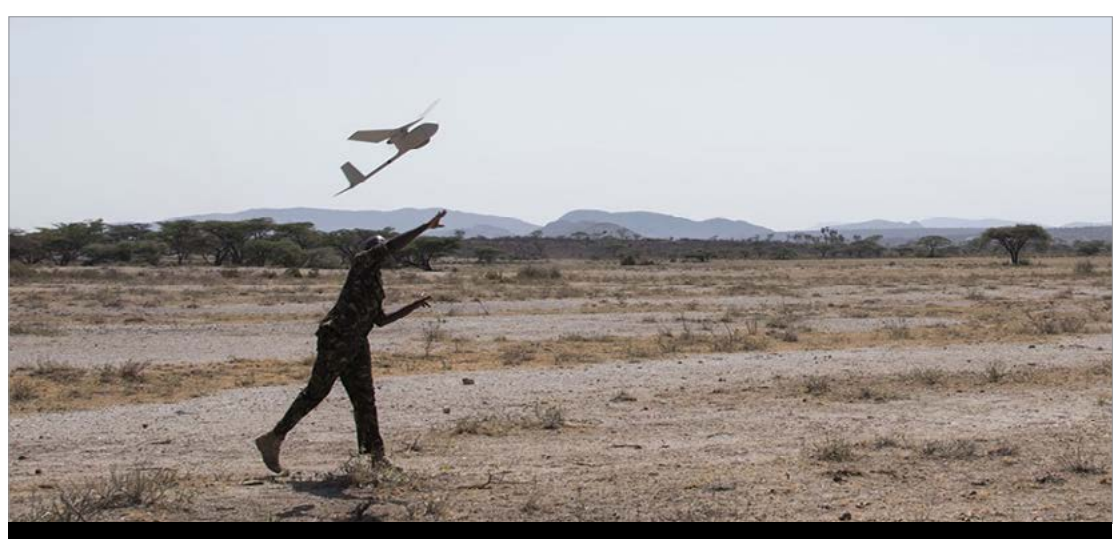
Figure 5. Kenyan Defense Forces Soldier Launches Raven Unmanned Aerial Vehicle (UAV)

Section 1206 project proposals lacked detailed plans for sustaining the proposed equipment over time. Project proposals did not usually include enough objective data to determine whether sustainment costs were affordable. For example, in Kenya, the provided Raven Unmanned Aerial Vehicles (UAVs) exceeded their estimated annual flight hours in the first quarter of operations, indicating that the original flight usage estimate was incorrect. This also resulted in SCOs or partner-nation officials needing to try to source these unplanned, longer-term sustainment costs.