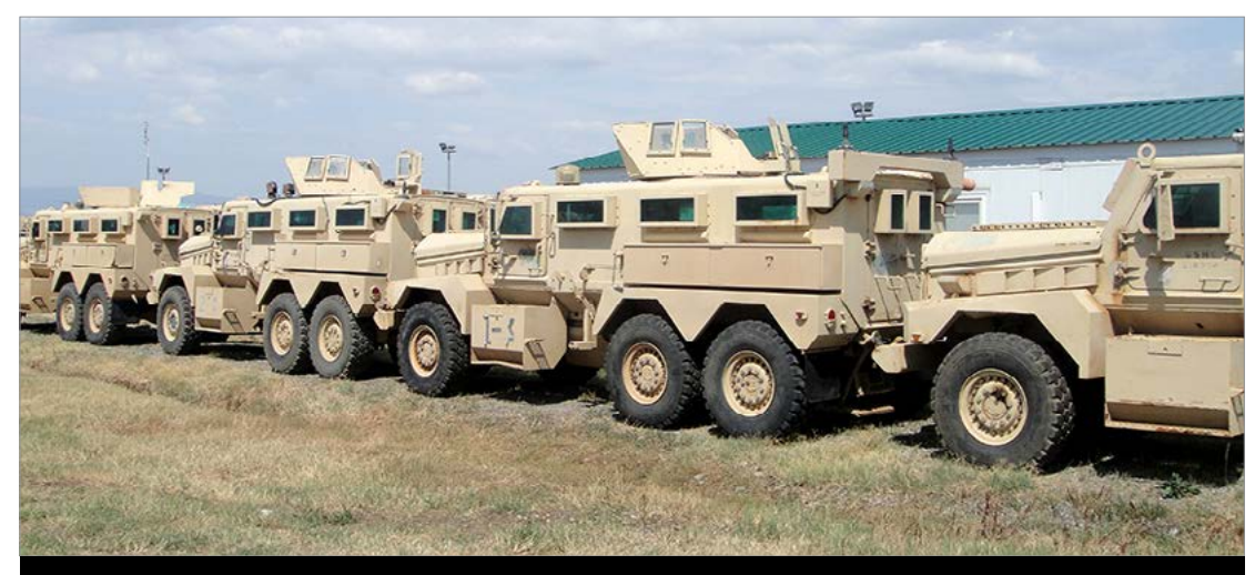
Figure 3. Section 1206 Provided Mine Resistant Ambush Protected (MRAP) Vehicles to Support a Georgian Infantry Battalion's Stability Operations Deployment to Afghanistan