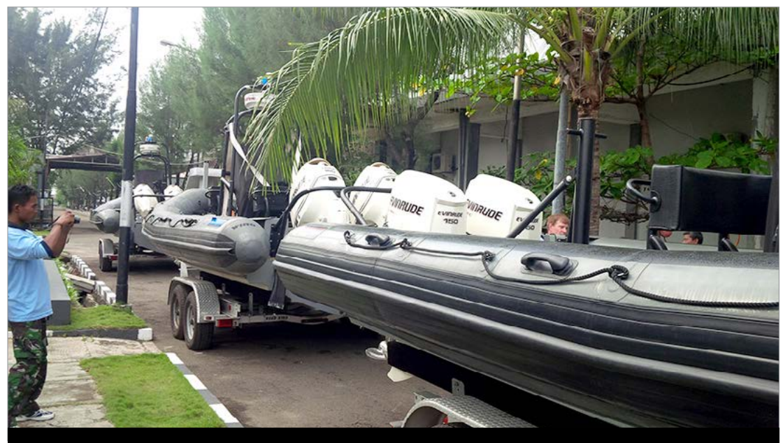
Figure 4. Section 1206 provided equipment, like these Indonesian Rigid-hulled Inflatable Boats (RHIBs), to build partner nation counterterrorism capacity.

Partner-nation forces were less familiar with substituted equipment than they were with the equipment originally requested, thus increasing the training requirement and not achieving the intended capability. The team learned that substituted equipment was also sometimes more difficult and expensive to maintain, a cost for which the partner government had not budgeted or could not afford.