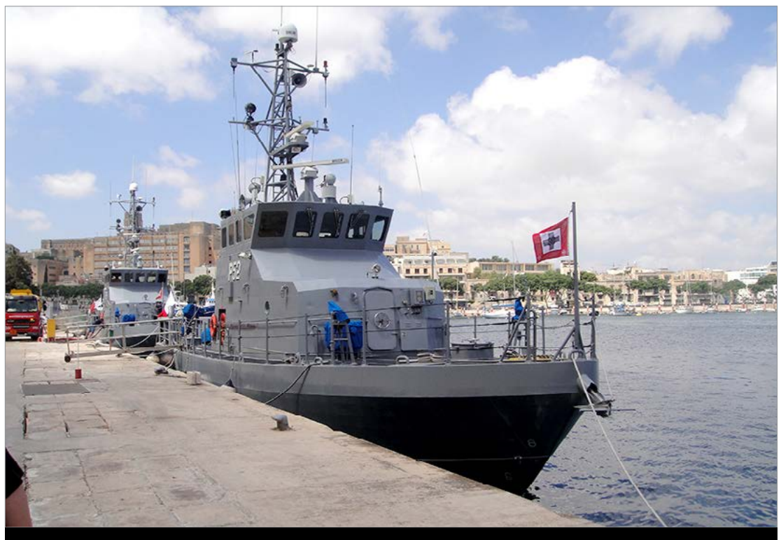
Figure 2. Boats provided under Section 1206 Authority to the Maltese Maritime Squadron to Support Counterterrorism operations in the Mediterranean Sea

According to Deputy Assistant Secretary of Defense for Special Operations and Combating Terrorism (DASD[SOCT]) officials, the decision to provide assistance using the Section 1206 authority involved joint DoD and DOS consideration of a partner nation's ability to absorb, implement, and sustain different types and amounts of equipment and training activity. This counterterrorism and stability operations assistance generally consists of three main categories of security capability projects – those that fortify a partner nation's land, sea, or air capability. It is not uncommon for projects to include also communications, intelligence, surveillance, and reconnaissance equipment.