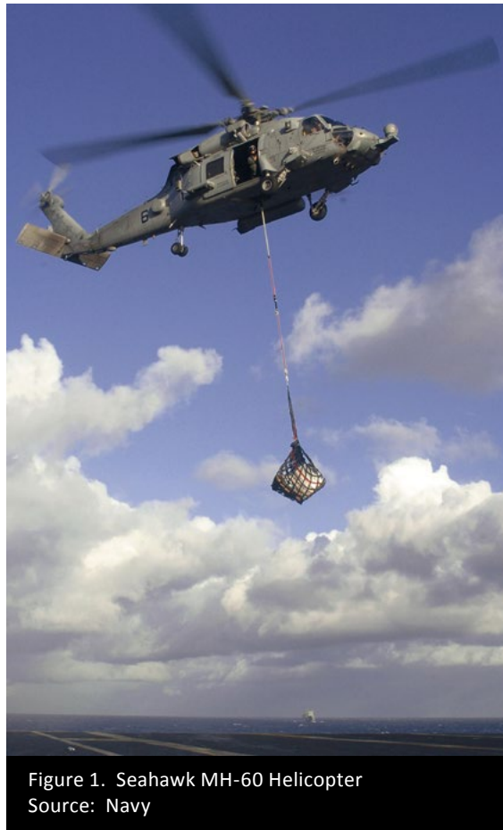
Figure 1. Seahawk MH-60 Helicopter

Naval Supply Systems Command Weapon Systems Support provides the Military Services with program and supply support for weapons systems, such as the H-60, to keep Navy forces mission ready. It awarded one performance-based logistics (PBL) contract 4 to primarily repair MH-60 DLRs and manage the inventory of those spare parts. However, the contractor also could buy DLR parts if replacements were needed. Figure 1 shows a Navy Seahawk MH-60.