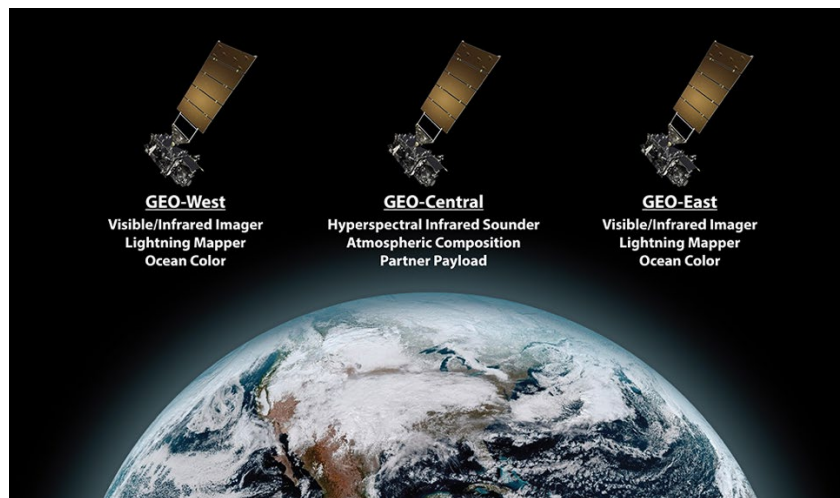
Figure 1. GeoXO System