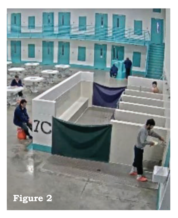
Figures 1 and 2. Detainee Washing His Face (left) and Detainee Filling a Bowl (right) from a Housing Unit Floor Mop Sink