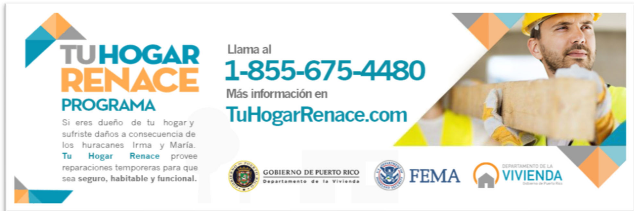
Figure 2. Tu Hogar Renace Flyer