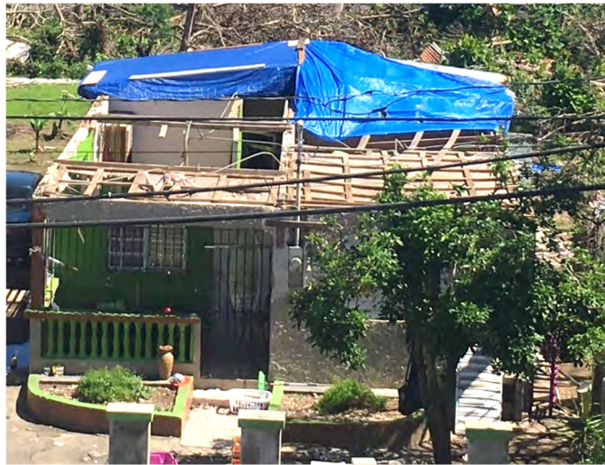
Figure 1. House with major damage to the wood-framed roof

Hurricanes Irma and Maria made landfall in Puerto Rico on September 5 and September 20, 2017, respectively. According to the Federal Emergency Management Agency (FEMA), Hurricane Maria left Puerto Rico's 3.7 million residents without electricity and both hurricanes caused an unprecedented demand for sheltering. Figure 1 shows a house with major damage to the wood-framed roof.