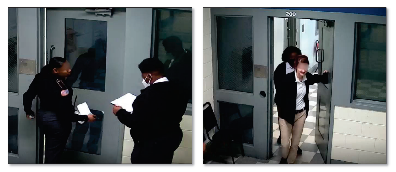
Figures 1 and 2. ICDC staff not wearing masks and not practicing social distancing on February 21, 2021.

Most detainees and staff we interviewed told us the staff wore their masks consistently. Staff also said they were required to wear masks and PPE or would face disciplinary action. Our review found that ICDC did not consistently ensure staff appropriately wore masks. We reviewed surveillance video footage from February 22, 2021, and March 10, 2021, and observed facility staff not wearing masks or practicing social distancing (see Figures 1 and 2).