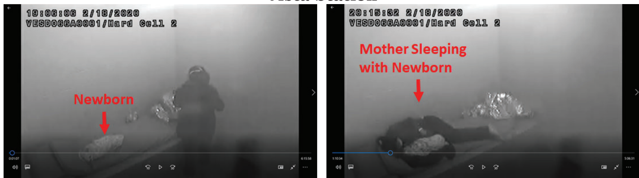
Figure 1. Images of the Mother and Newborn Held Overnight at the Chula Vista Station