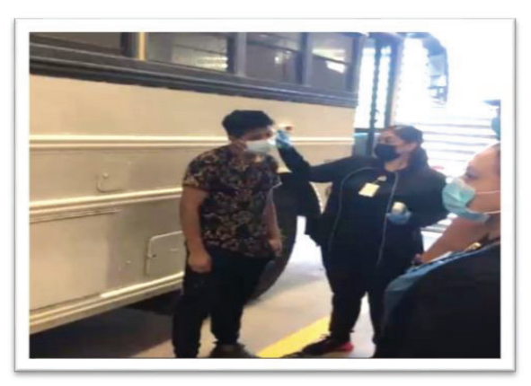
Figure 1. Medical contractor screening an individual in Rio Grande Valley, Texas

According to several different CBP policies,<sup>4</sup> individuals who require medical treatment at any time beyond the capabilities of contracted medical staff or CBP staff, are referred to a local medical treatment facility for further assessment and care. Such medical treatment includes x-rays, medical tests, or medical procedures beyond first aid.