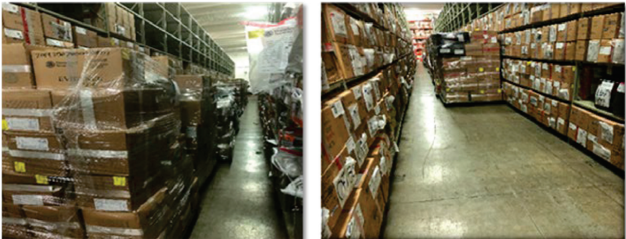
Figure 1. Drugs Stored in CBP Permanent Vault

CBP safeguards the U.S. borders from the illegal entry of people, weapons, contraband, and drugs. Each year, CBP seizes hundreds of thousands of pounds of illegal drugs entering the United States, and stores them in one of its 62 permanent seizure vaults. Figure 1 shows drugs stored in a CBP vault.