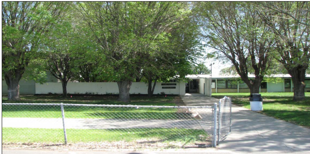
Figure 2. Main entrance onto Yakama Nation Tribal School campus.

When we arrived on campus on April 30, 2014, a facilities worker directed us to the main entrance. School officials conveyed to us, however, that the cafeteria door was frequently left open during the business day to allow for air circulation in the kitchen. We also noticed that the exterior door at the end of the classroom hallway was propped open. In addition, the significant number of trees located in front of the school made it difficult for school officials to notice individuals approaching the front of the school. Further, the fencing surrounding the school was less than 4 feet high, significantly minimizing its safety value.