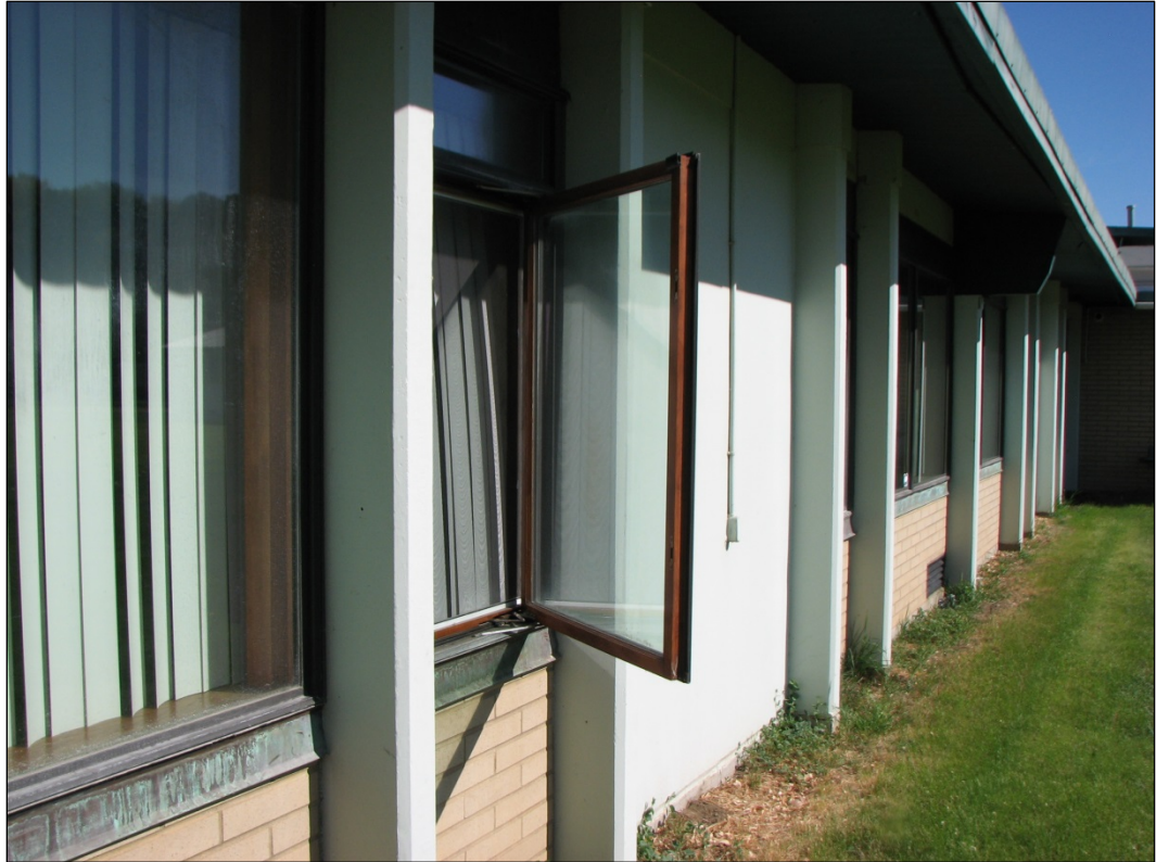
Figure 1. Open classroom window during lock-down drill at Yakama Nation Tribal School.

Drills and exercises, when properly run and evaluated, can help identify gaps and weaknesses in the emergency plan so that they can be corrected before an actual emergency situation arises. There are different levels of emergency plan exercises that entail different amounts of planning, time, and resources to perform, including—