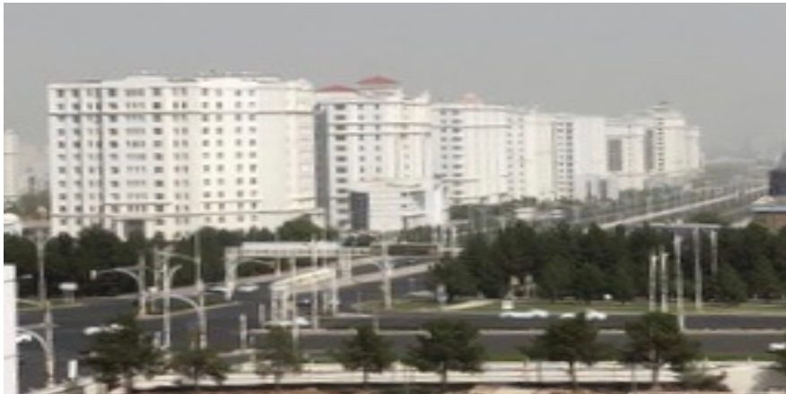
Figure 1: Building cluster in Ashgabat, Turkmenistan. (OIG photo, September 2019)

U.S. Embassy Ashgabat describes Ashgabat as a city of white marble and geometrical architecture style. 4 During fieldwork for this review in Ashgabat, OIG observed clusters of white marble buildings aligned in straight rows (see Figure 1), a pattern the Turkmen Government imposes using a “red line” concept. The concept, which dates to the period when Turkmenistan was part of the Soviet Union, requires buildings to be set back a certain distance from the road to achieve an aesthetic alignment.