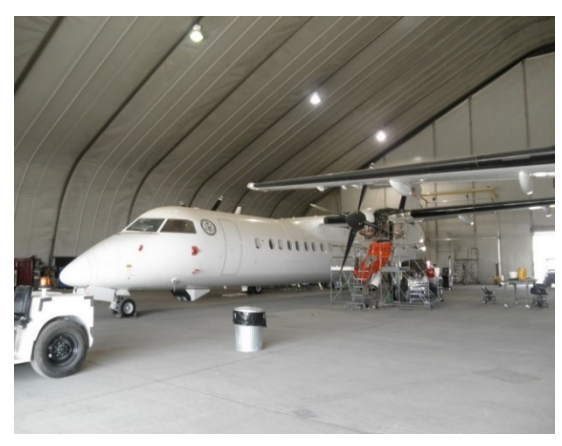
Figure 1 : De Havilland DHC-8 fixed-wing aircraft that is used in both Afghanistan and Iraq.

Embassy Air—which is administered by the Department's Bureau of International Narcotics and Law Enforcement Affairs, Office of Aviation (INL/A)—provides aviation support to Embassies Kabul, Afghanistan, and Baghdad, Iraq. Embassy Air services include scheduled flights to domestic locations within these countries, such as Bagram, Afghanistan, as well as international flights to Amman, Jordan. Embassy Air also supports medical evacuations, search and rescue operations, quick reaction force transportation, route reconnaissance and convoy escorts, and freight transportation. Embassy Air is used by personnel from the Department as well as other Government agencies. As of June 2019, the Embassy Air-Afghanistan fleet consisted of 3 airplanes and 17 helicopters (referred to as fixed-wing and rotary-wing aircraft, respectively, in this report) valued at approximately $60 million and the Embassy Air-Iraq fleet consisted of 4 fixed and 8 rotary-wing aircraft valued at approximately $58 million.