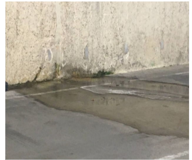
Figure 2 : Ground water seeping into the lower level parking garage of NEC London.