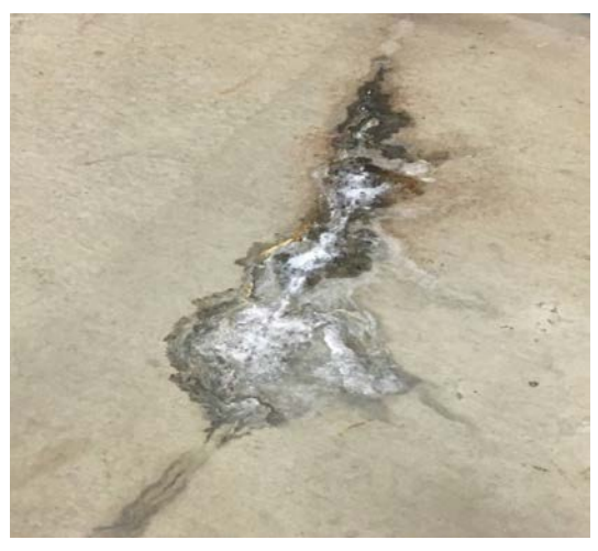
Figure 3: Ground water seeping through the lower level floor of NEC London.