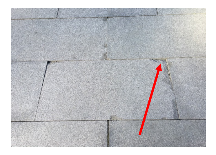
Figure 10: Damaged edges of exterior stone pavers on embassy driveway.

Recommendation 5: OIG recommends that the Bureau of Overseas Buildings Operations, in coordination with Embassy London and prior to issuing the Certificate of Final Acceptance, verify that the stone pavers and tiles that were installed at Embassy London were the grade and quality of materials approved and that they were installed correctly. If the grade and quality of materials is not consistent with contract requirements, in coordination with the Bureau of Administration and the Office of the Legal Advisor, OBO should determine the extent to which the construction contractor, B.L. Harbert International, LLC, (under contract # SAQMMA-12-C-0111) is responsible and recover any associated costs.