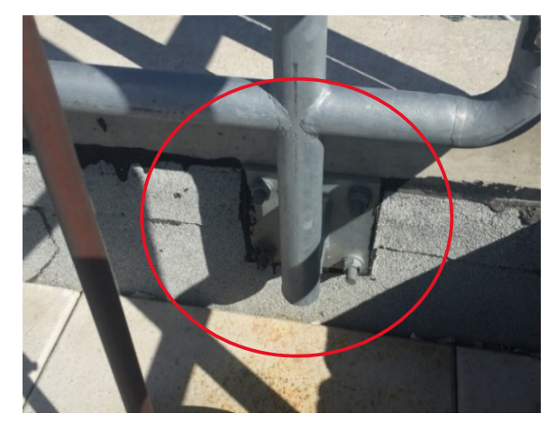
Figure 6: Improper installation of roofing on sidewall.