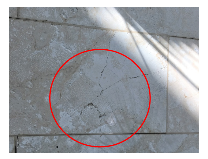
Figure 9: Damaged (cracked) interior stone tiles.