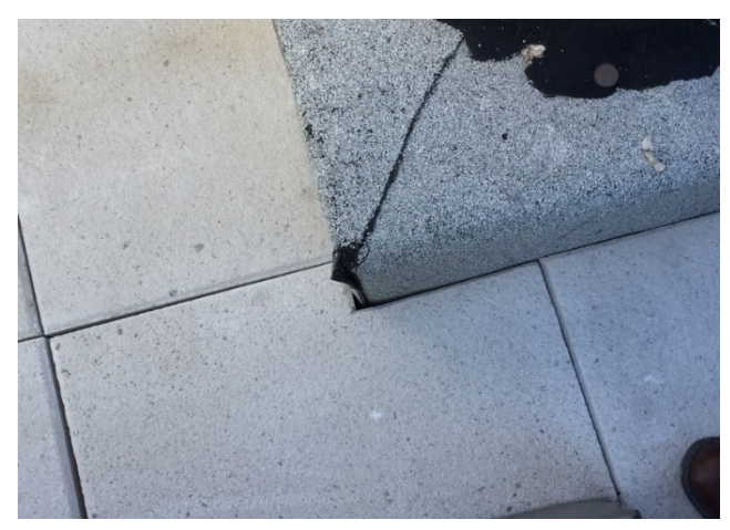
Figure 5: Improper installation of roofing over equipment pad.

contractor's design and from OBO's standard roof design. OIG found that the finished roof was completed improperly and identified defects with the equipment pads. Because OIG does not know the basis by which OBO chose to alter the design of the roof after accepting the design of the roof from the A&E contractor, OIG is not offering a recommendation to address this condition. Figures 5 and 6 show the results of improper installation of roofing over equipment pads.