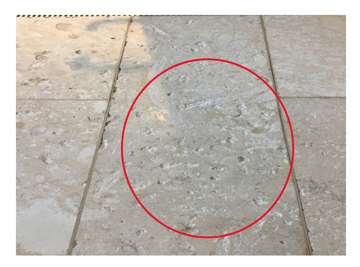
Figure 8: Damaged interior stone tiles on sixth floor showing spalling and delamination.

Because OIG could not determine the specific cause for the defects, OIG is recommending that OBO verify that the stone pavers and tiles installed were the grade and quality of materials approved and that they were installed correctly. If the grade and quality of materials was not consistent with contract requirements, then OBO, in coordination with the Bureau of Administration and the Office of the Legal Advisor, should determine the extent to which BLHI is responsible and recover any associated costs.