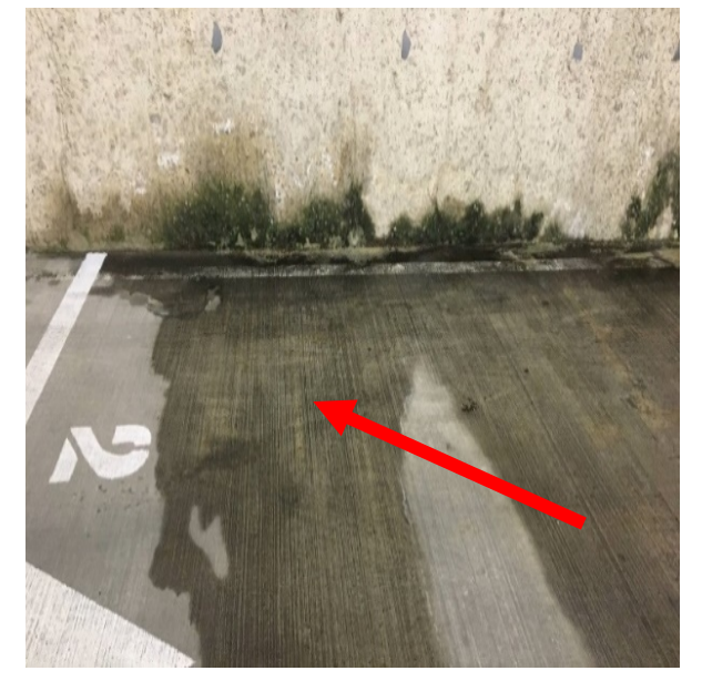
Figure 4 : Mold forming on the wall in the lower level parking garage of NEC London.