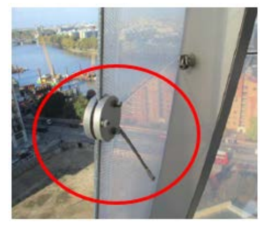
Figure 7: Wind Cable detached from building.

In addition, the contractor inspecting the tensioned sails listed in its inspection report 30 types of construction phase defects and hundreds of individual deficiencies, including wrinkles, splits, and tears in the sails and several loose wind cables. Additionally, the inspectors found missing, improperly installed, or incorrectly sized nuts, bolts, and clamps used to secure the sail panels, which caused broken or missing fittings. The audit team observed detached brackets and other defects during the team's visit, but for security reasons could not take photographs.