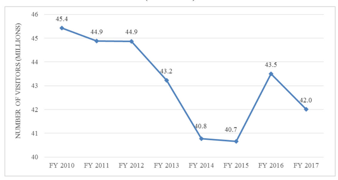
Figure 2: Total Field Office Visitors (In Millions)

Each year, SSA serves more than 40 million customers, as shown in Figure 2. During FYs 2010 through 2015, the total number of visitors to all SSA field offices steadily decreased, but the number increased in FY 2016 and then decreased again in FY 2017.