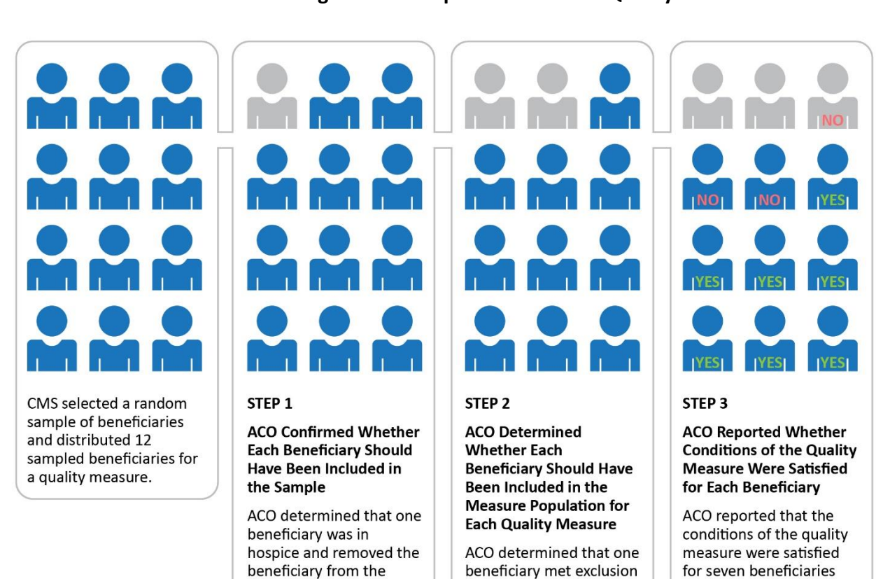
Figure 2: Steps Followed and Examples of Possible Outcomes When an Accountable Care Organization Reported Data on a Quality Measure

See Appendix D for details on these steps, which uses as an example the depression-screening quality measure for PY 2016. Figure 2 illustrates the steps that an ACO followed and examples of possible outcomes when reporting data on a quality measure. (The number of beneficiaries shown in Figure 2 is for illustrative purposes only.)