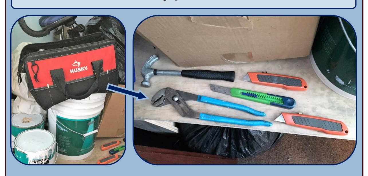
Photographs 18 and 19