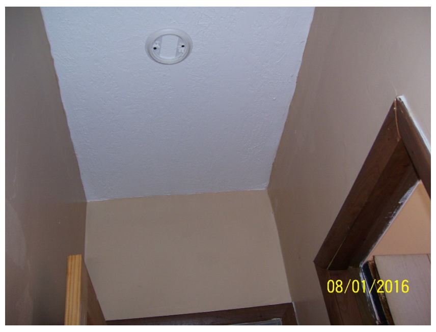
Photograph 12: A smoke detector was missing.