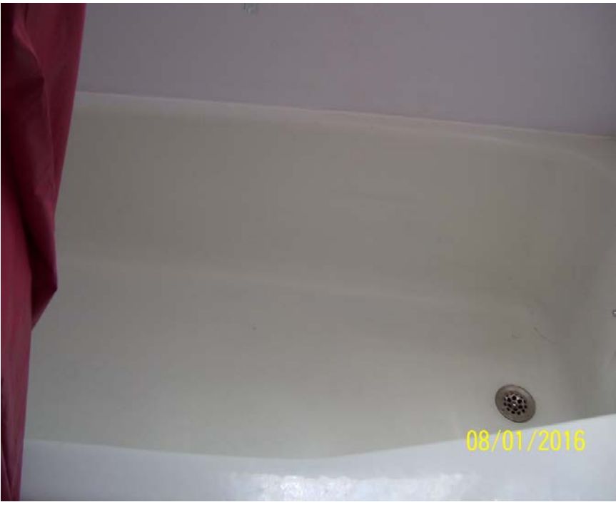
Photograph 11: This bathtub did not have a nonskid surface.