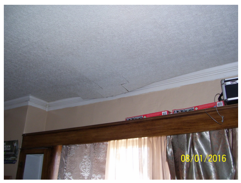
Photograph 3: A dining room ceiling was buckled and sagging.