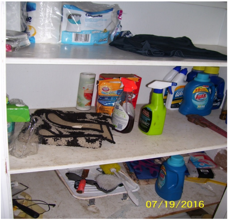
Photograph 9: Hazardous materials stored in an unlocked cabinet.