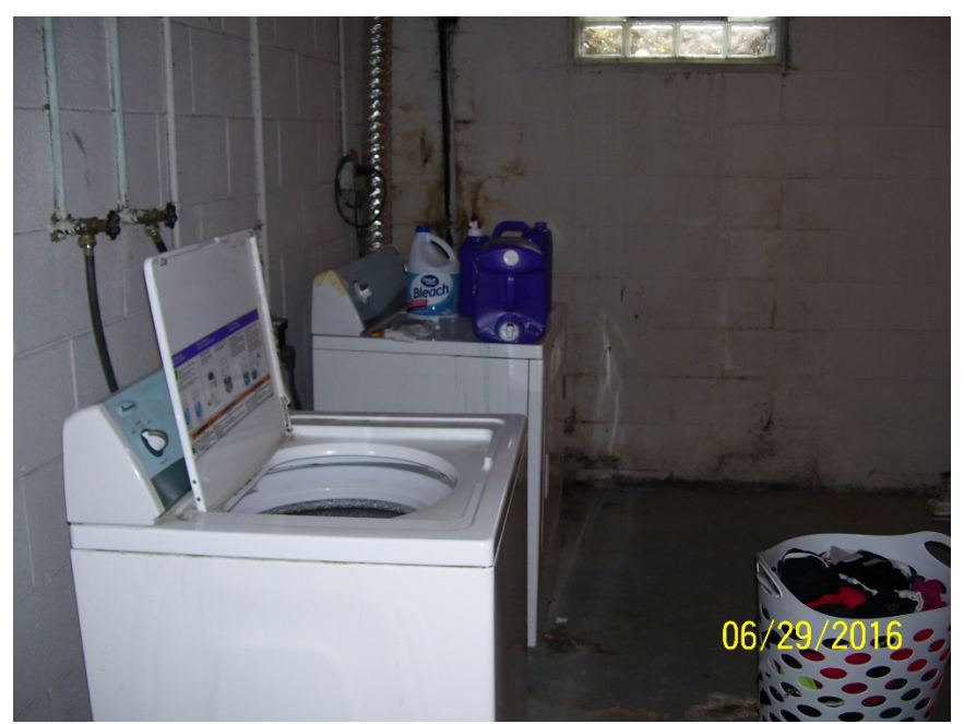
Photograph 10: Bleach stored in an unlocked laundry area.