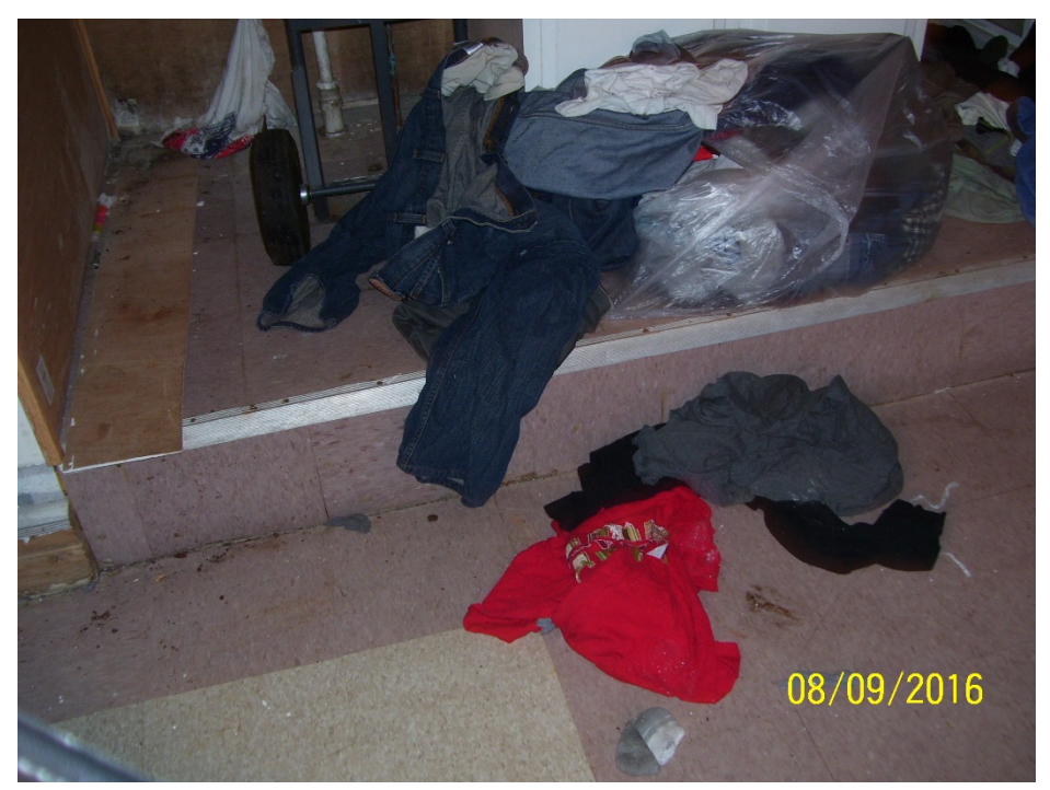
Photograph 2: A laundry area was not kept clean, and dirty clothes surrounded the washer and dryer.