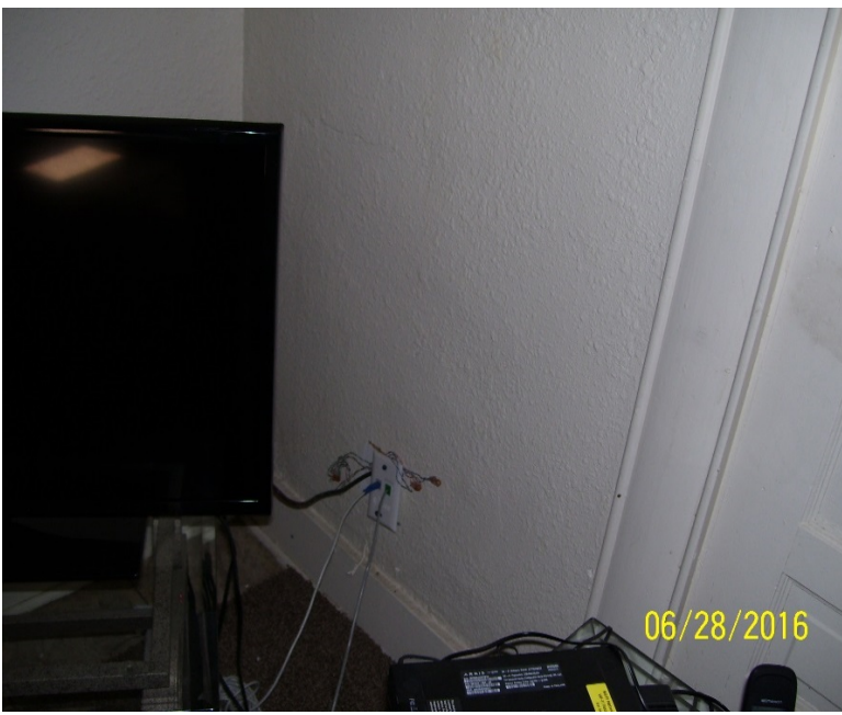
Photograph 1: Exposed electrical wires coming out of a wall in the living room.