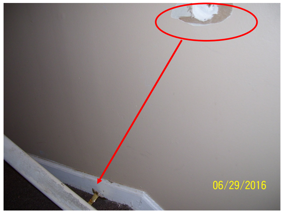
Photograph 7: A broken railing in the stairway.