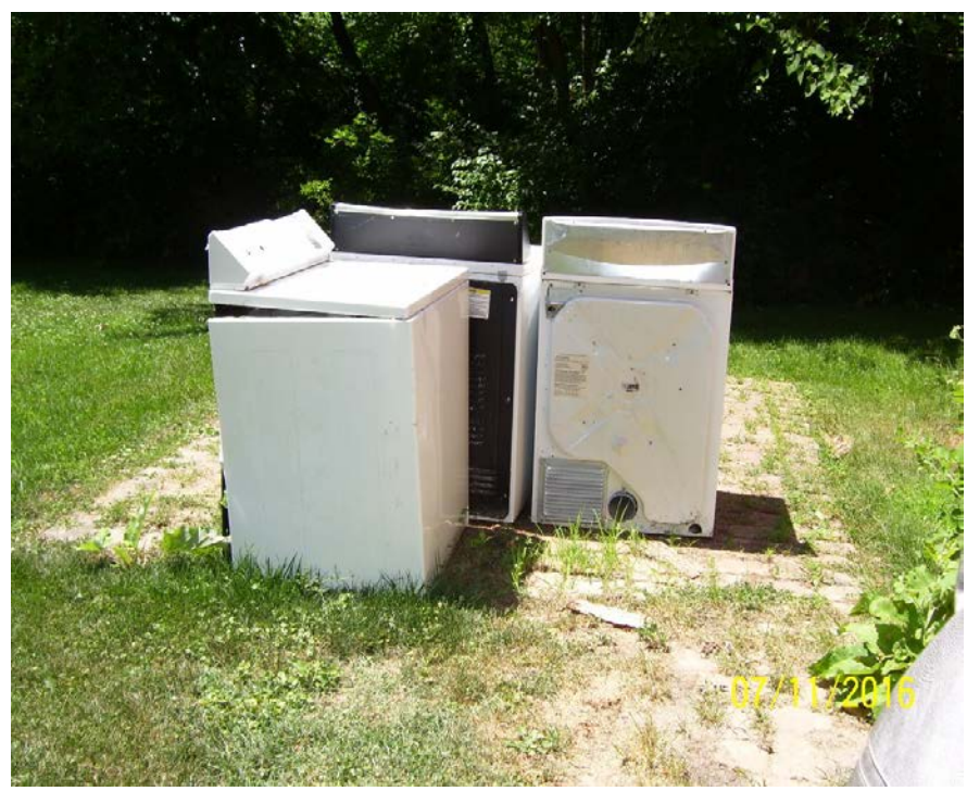
Photograph 5: Old washers and dryers in a backyard.