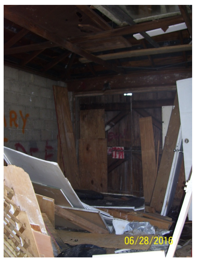
Photograph 8: An exterior building not locked and kept in hazardous condition.