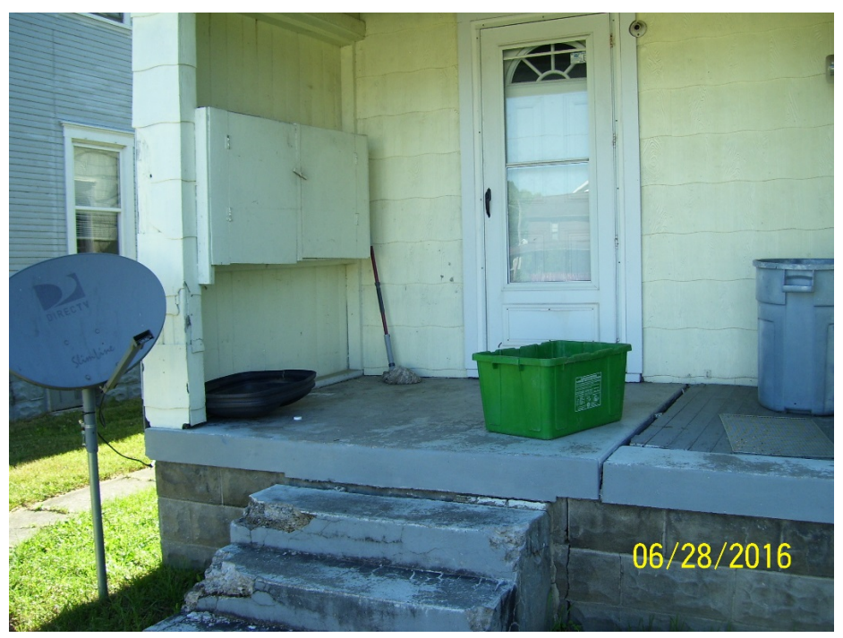
Photograph 6: An exterior entrance with inoperable lighting.