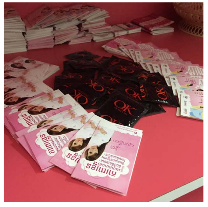
These brochures and condoms are examples of communication and social marketing materials developed through a Flagship innovation targeting entertainment workers. Photo: OIG (May 2016)

• Branded communications and outreach. KHANA and its partners created or expanded brands to promote behavior changes for three targeted high-risk groups—SMARTgirl for entertainment workers, MStyle for men who have sex with men, and Srey Sros for transgender people. Through a variety of branded materials, such as flyers (some shown in the following photo), posters, websites, and games, the project promoted targeted messages to an estimated 30,000 members of high-risk groups and online.