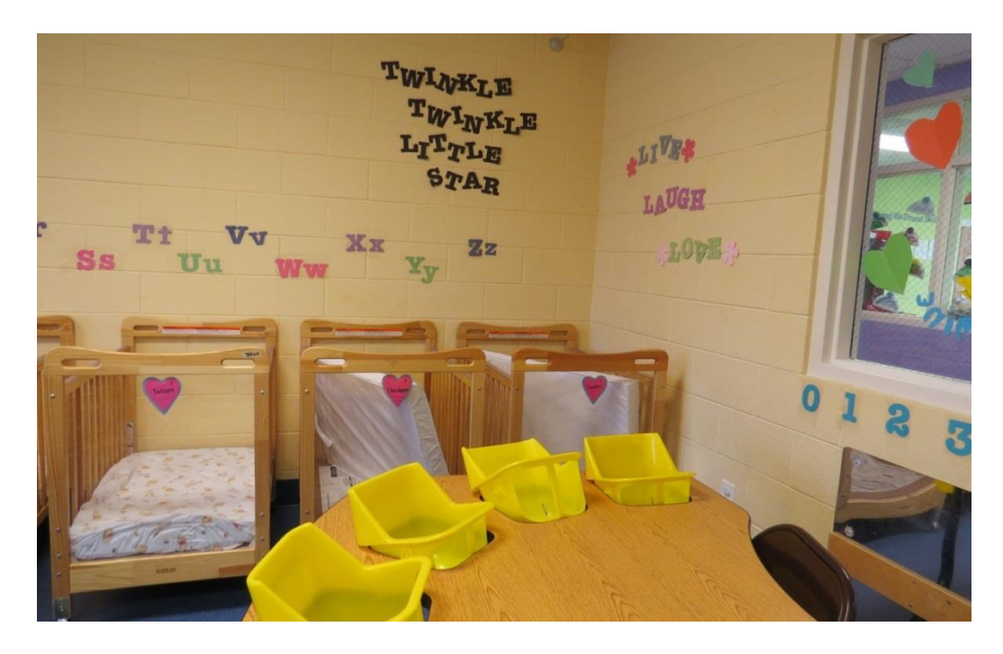
Photograph 2: There were no safety straps on the feeding chairs, and the cribs were not 3 feet apart.