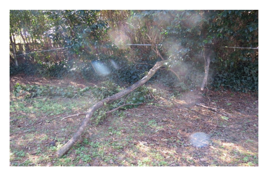
Photograph 3: A tree had fallen over the fence and become a hazard.