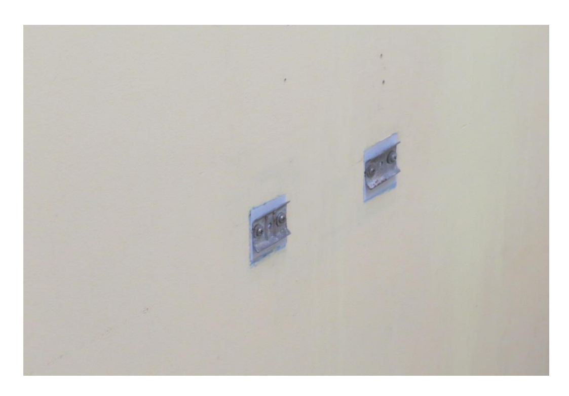
Photograph 6: Metal brackets in the children's bathroom exposed children to injury.