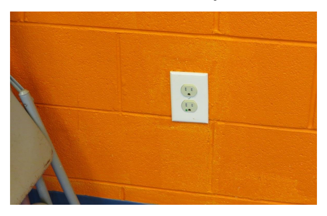
Photograph 1: An electrical outlet was not covered and was accessible to children.