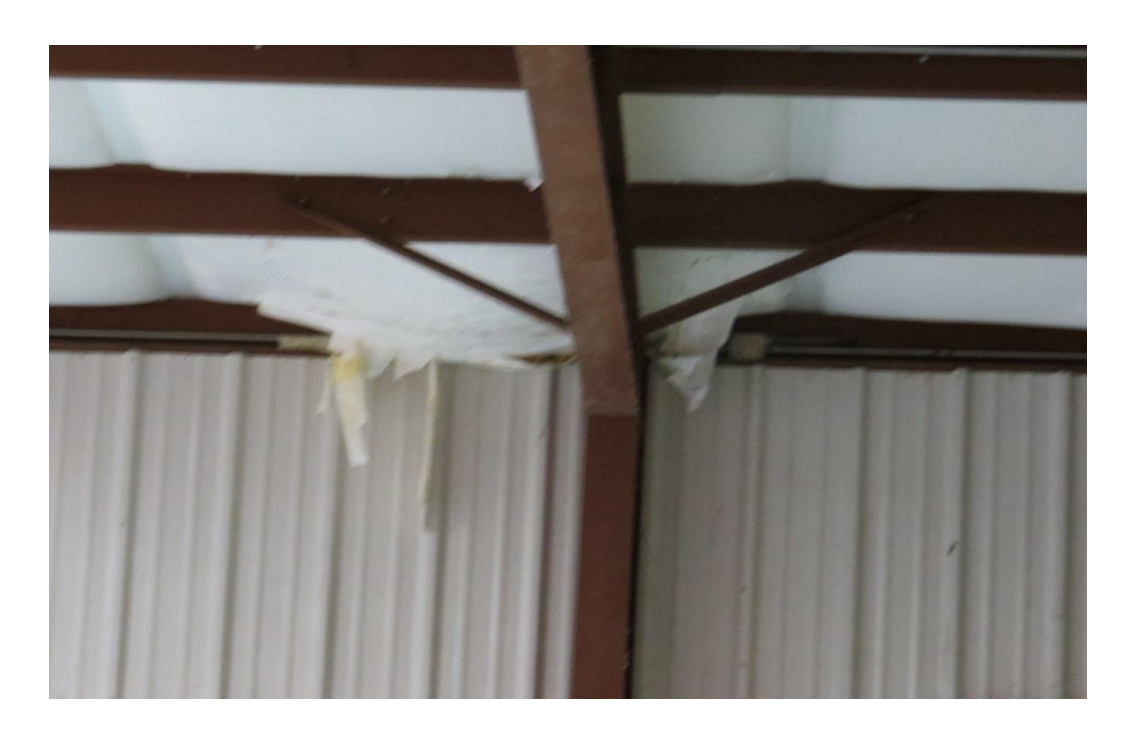
Photograph 5: A gym ceiling liner was damaged.