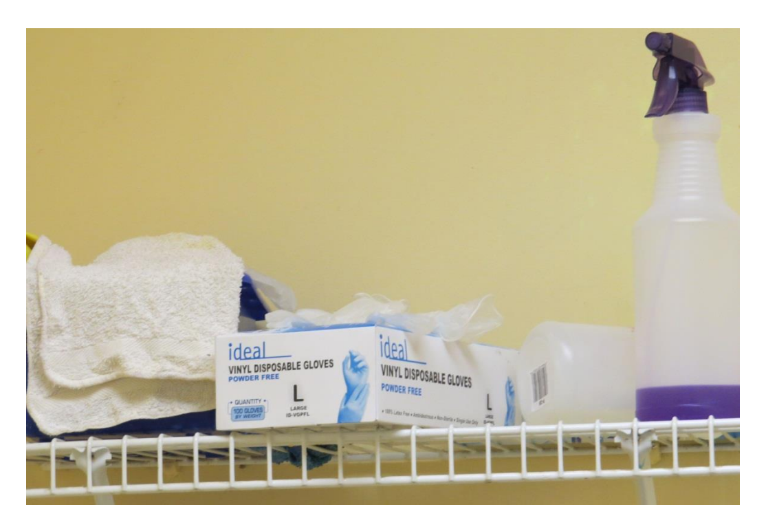
Photograph 7: A bottle of cleaning fluid was unmarked and unlabeled.