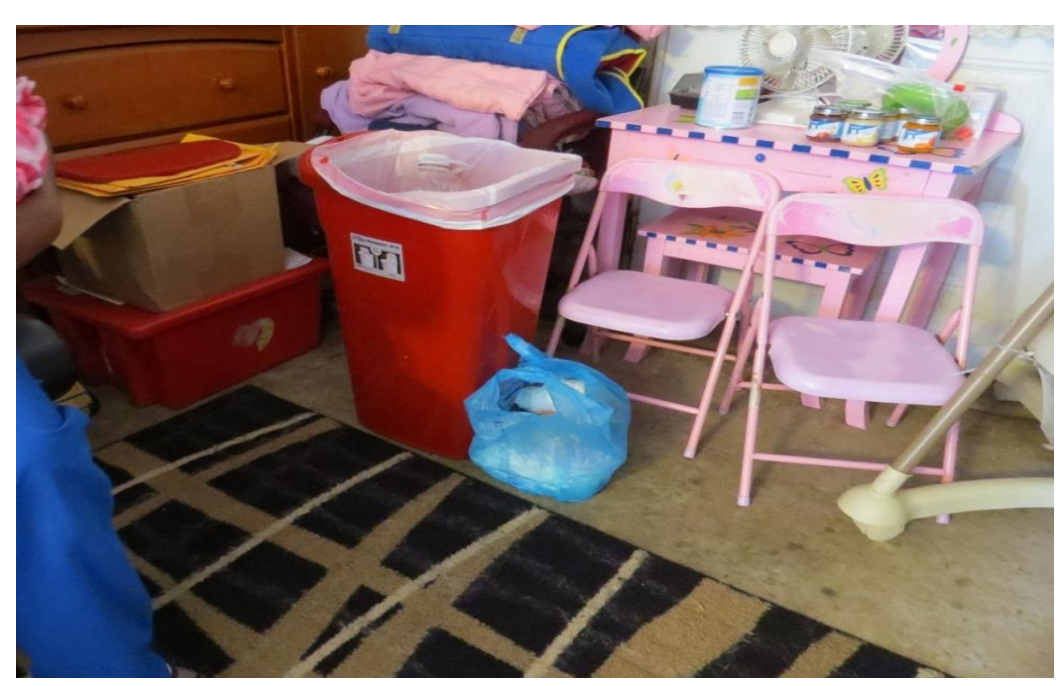
Photograph 10: Soiled diapers were stored on the floor near children's food, which could lead to contamination.