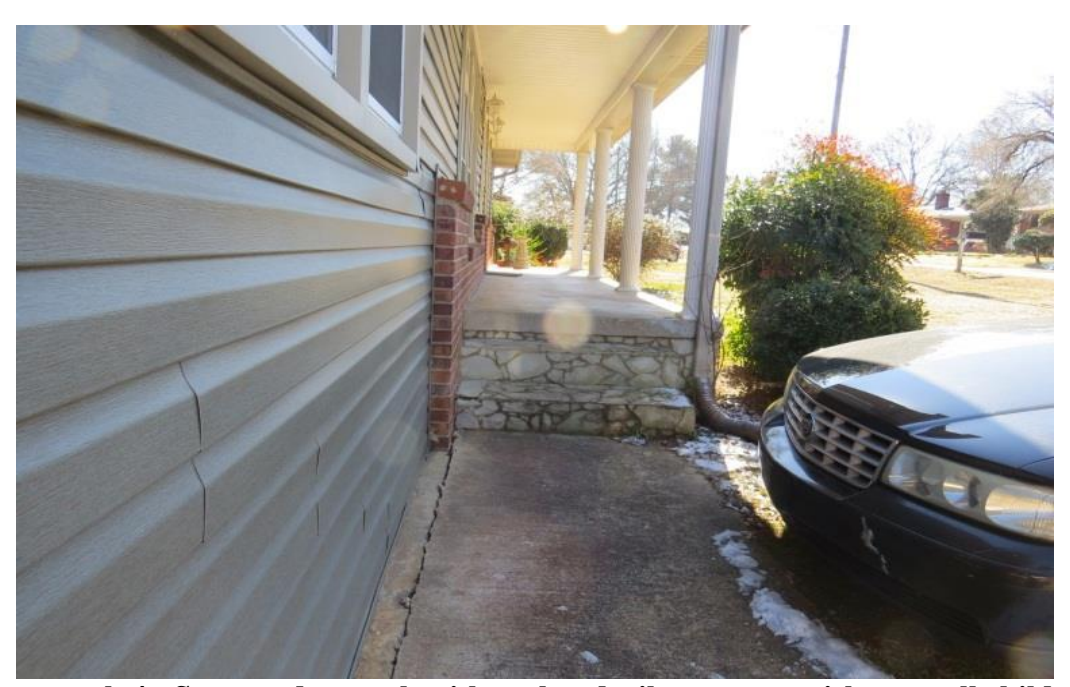
Photograph 4: Steps and a porch without handrails present a risk to small children.