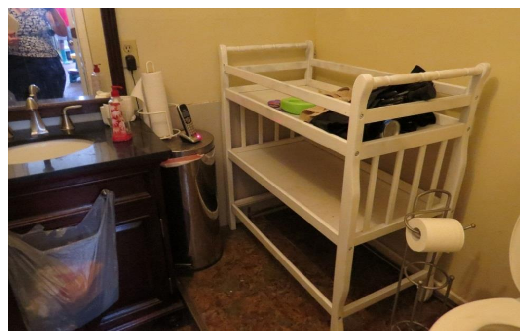
Photograph 11: Garbage was not stored away from the reach of children.