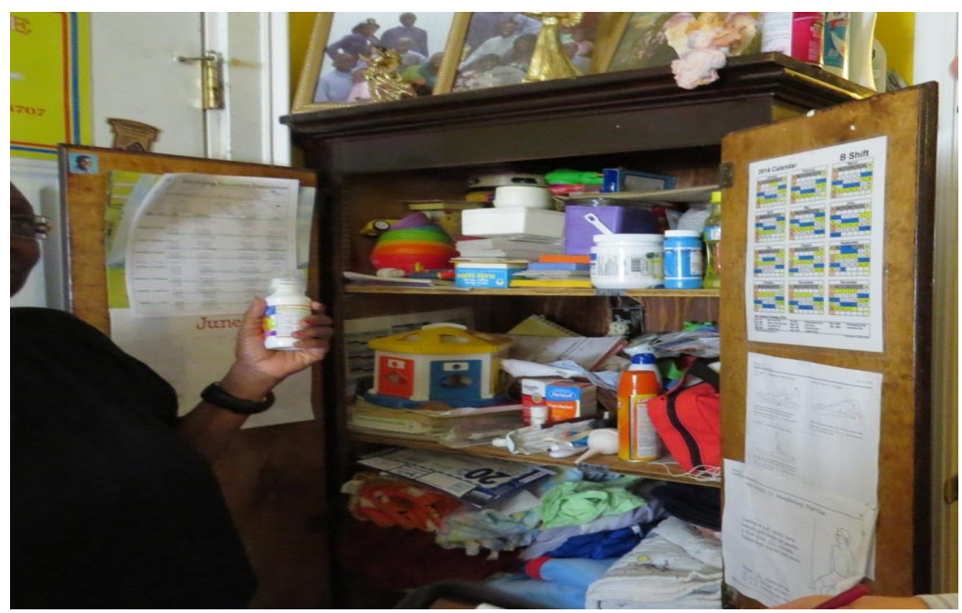
Photograph 2: A first aid kit and medication in an unlocked cabinet were accessible to children.