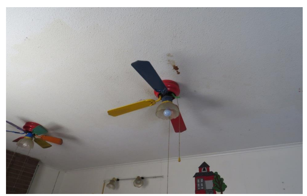
Photograph 8: One home had a broken ceiling fan and stained ceiling.