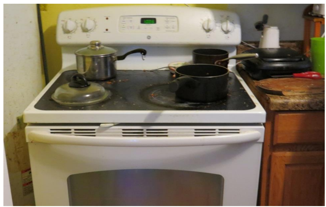
Photograph 14: Kitchenware and food-contact surfaces were not cleaned to sight and touch.