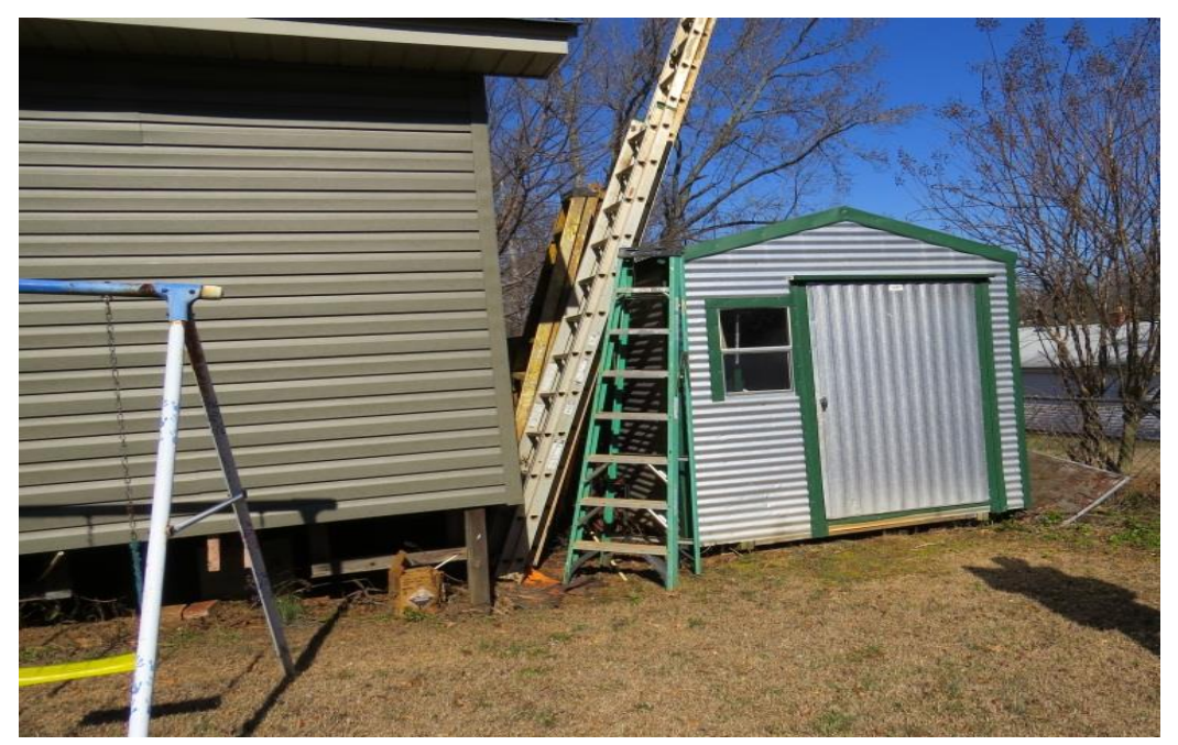
Photograph 7: Outdoor hazards included ladders and unsecured storage areas.