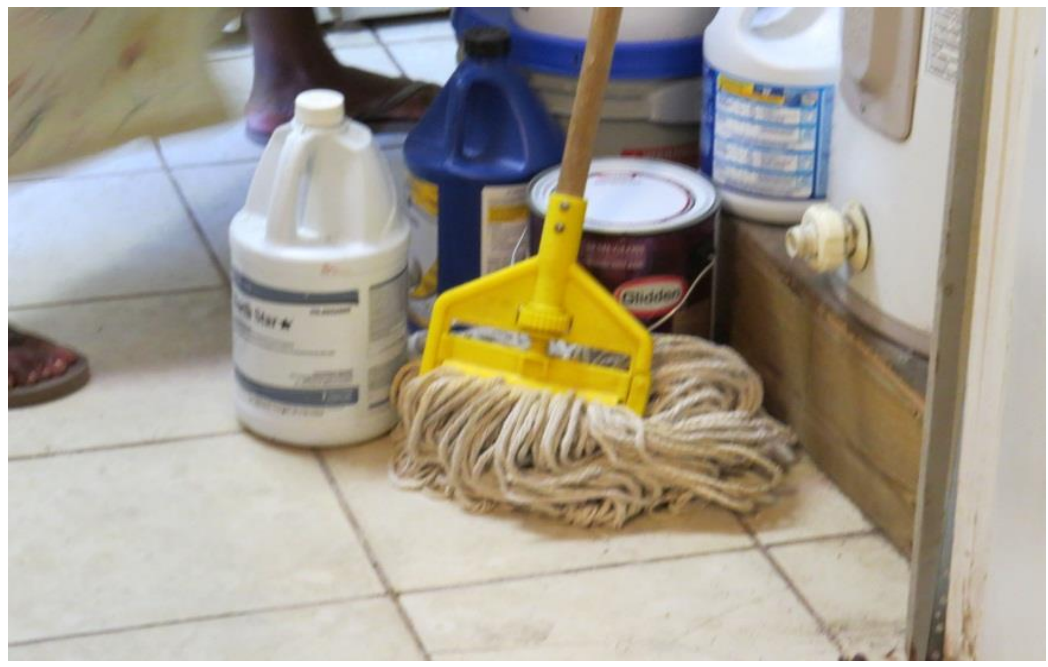
Photograph 3: Mop, paints, and chemicals all within reach of children pose a poisoning hazard.