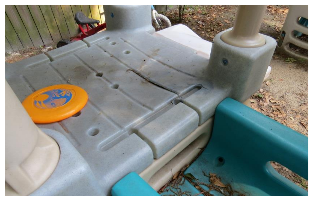
Photograph 5: Toys were broken and dirty.