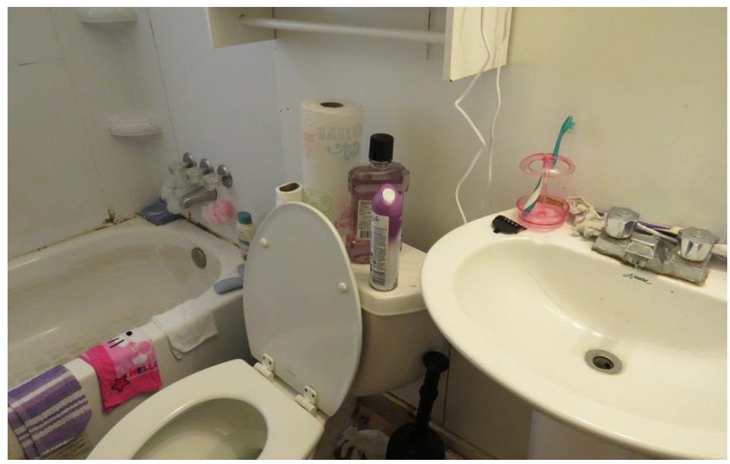
Photograph 1: Washcloths and other toilet articles were not plainly marked.