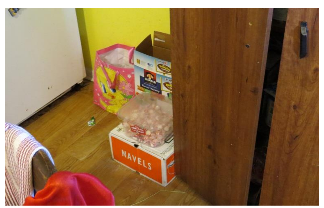
Photograph 12: Food was stored on the floor.