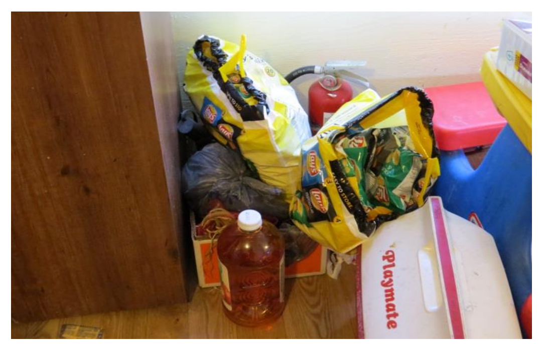
Photograph 13: Food was stored on the floor.