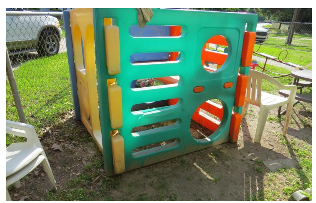
Photograph 6: Toys were broken and dirty.