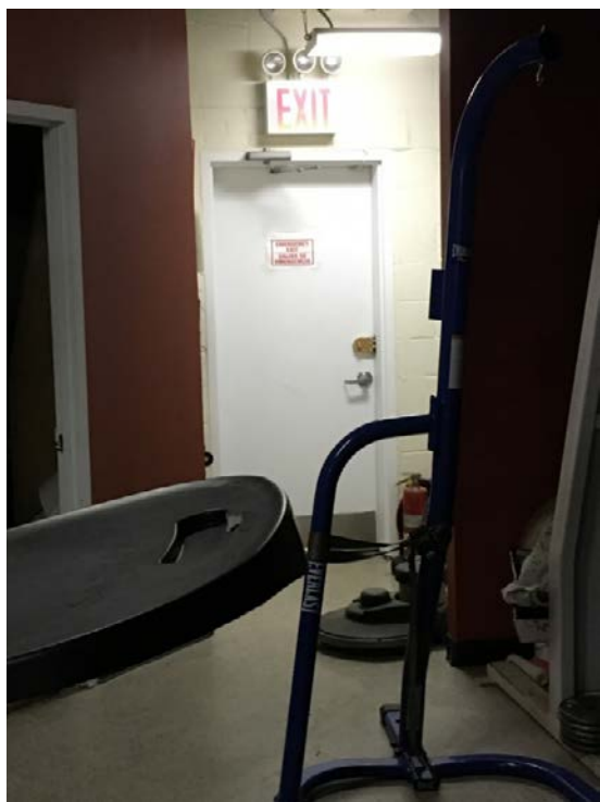
Photograph 1: Emergency exit door deadbolted shut and blocked by heavy exercise equipment.

Of the 20 adult day care services providers we visited, 13 had 1 or more deficiencies related to physical environment and safety requirements. In total, we found 51 instances of noncompliance. Specifically, we found 48 instances of participant health and safety hazards (e.g., a locked emergency exit door, tripping hazards, slip and fall hazards, black mold, and evidence of vermin), 2 instances in which providers had not documented that they notified the local fire jurisdiction of their presence and hours of operation, and 1 instance in which a facility's maximum occupancy was exceeded by 21 persons. 13 The following photographs depict some of the conditions we identified during our site visits.