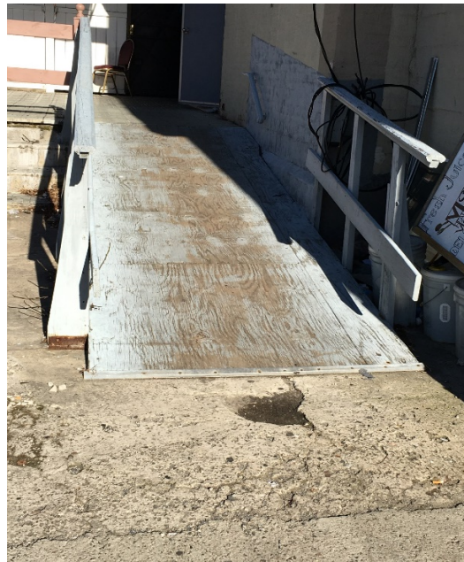
Photograph 6: Damaged concrete at end of emergency exit ramp poses tripping risk.