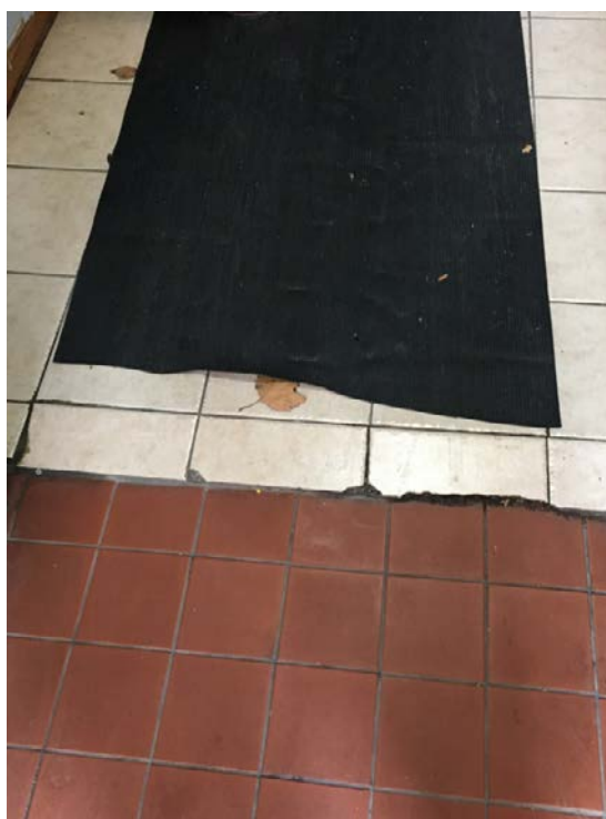
Photograph 2: Floor mat in facility's main entrance not properly secured to floor.