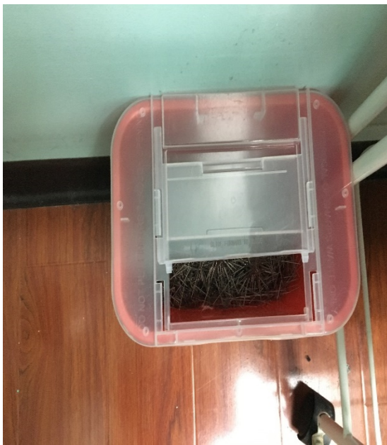
Photograph 5: Open sharps disposal container of used acupuncture needles found in unsupervised room occupied by participants.