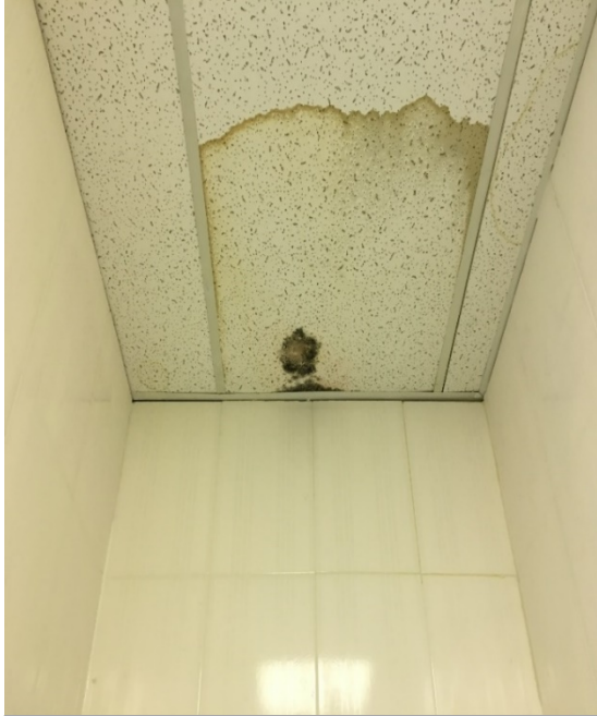
Photograph 3: Restroom ceiling tile with signs of water damage and mold.