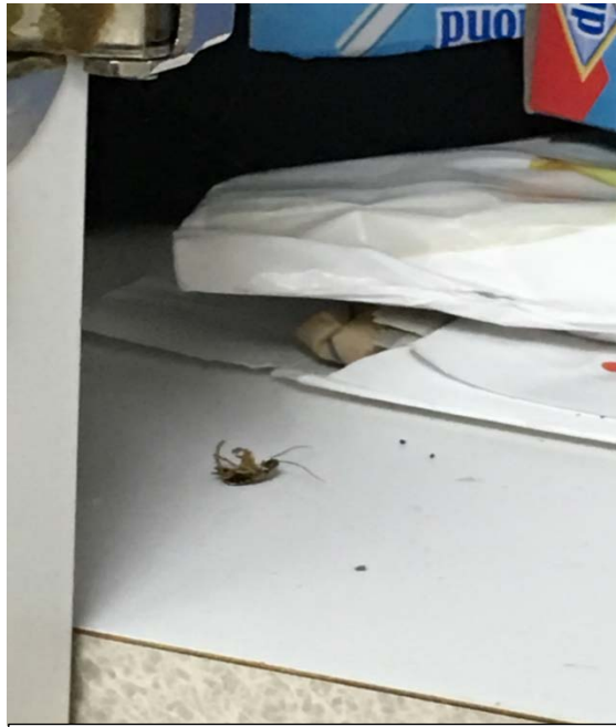
Photograph 4: Evidence of vermin in kitchen where meals were served.