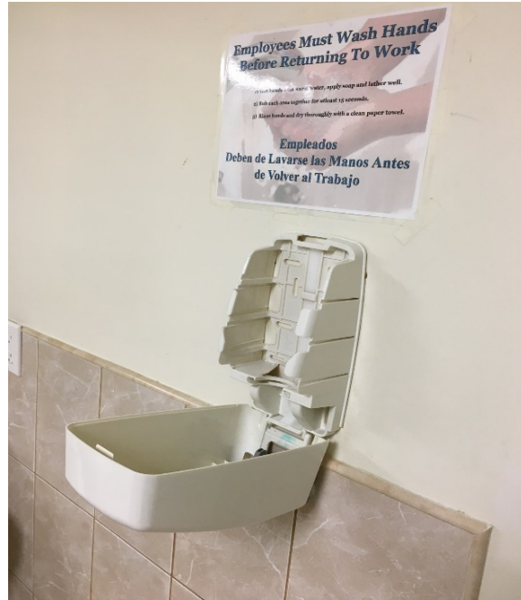
Photograph 8: Empty hand soap dispenser in men's restroom.