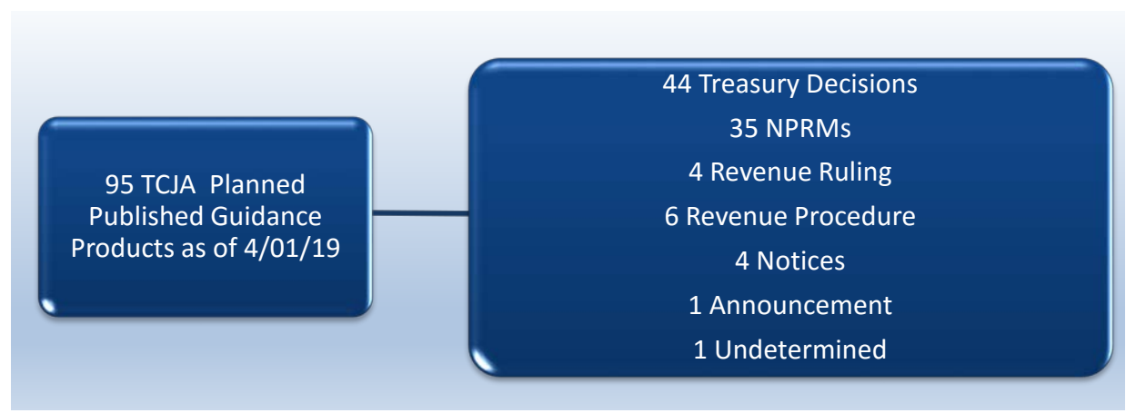
Figure 3: TCJA Published Guidance the IRS Plans to Issue