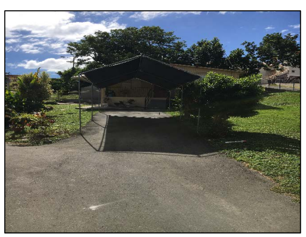
The above pictures show some of the private properties that were resurfaced.

A Municipality official could not determine whether HUD or municipal funds were used to resurface the private properties. The official stated that the Municipality used local funds in addition to CDBG funds to resurface some streets. However, he could not distinguish which funds were used for a given street, and no additional support was provided justifying the work at private properties. As a result, the Municipality could not ensure that CDBG funds were used for eligible purposes and in accordance with the program requirements.