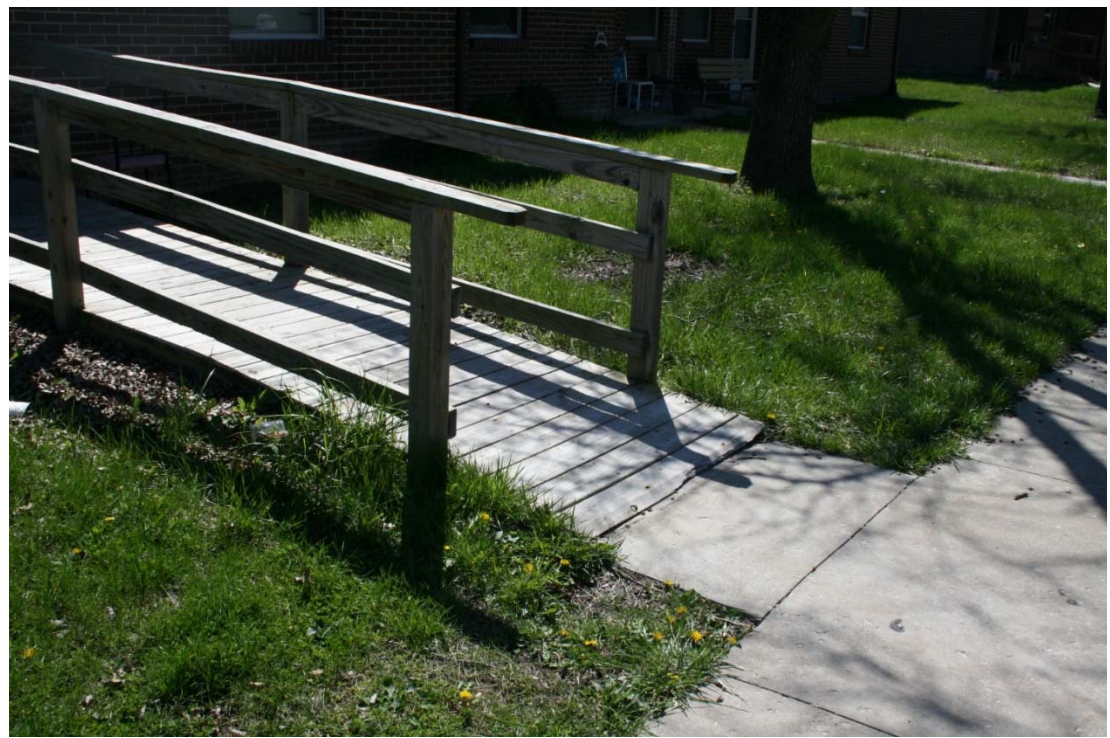
No concrete transition - April 13, 2016