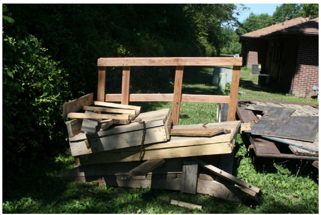
Handicap ramp removed from unit - June 27, 2016