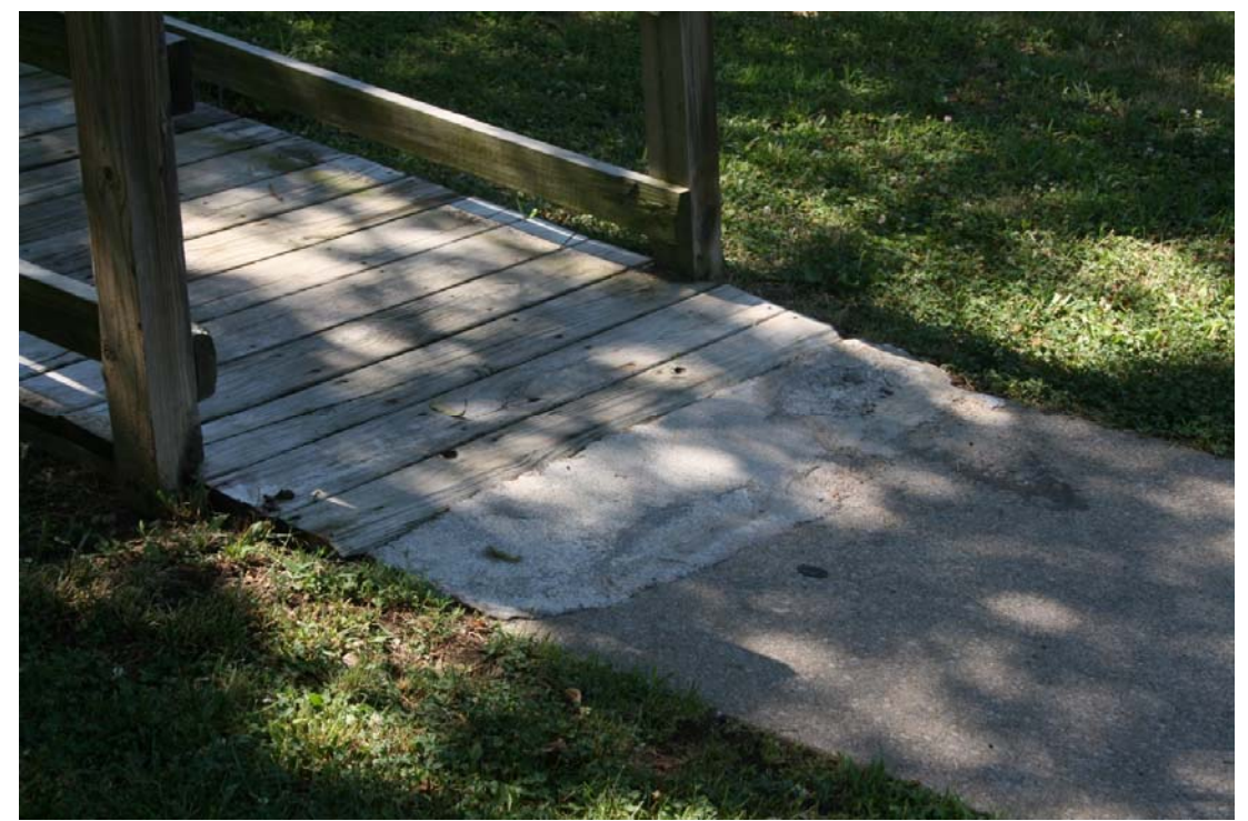
Concrete transition installed by maintenance - June 27, 2016