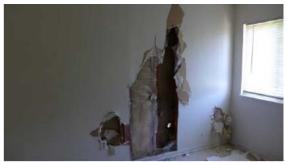
Insurance adjuster's photo's showing original damage - May 27, 2015