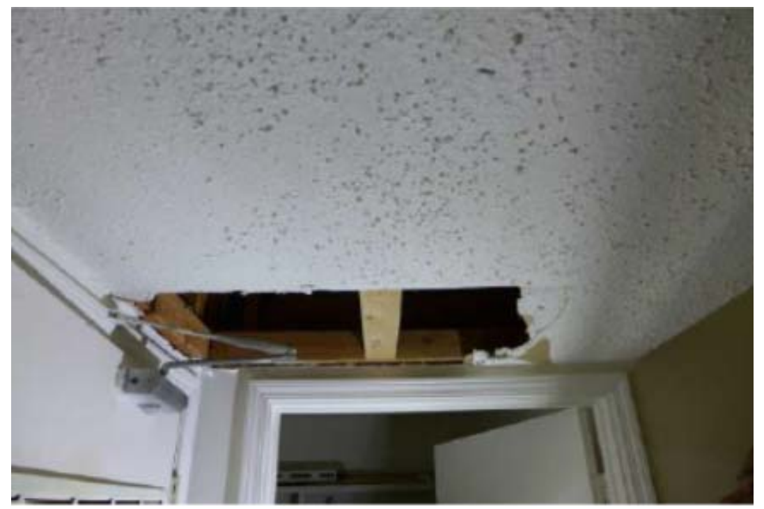
Insurance photo showing ceiling damage – August 10, 2015