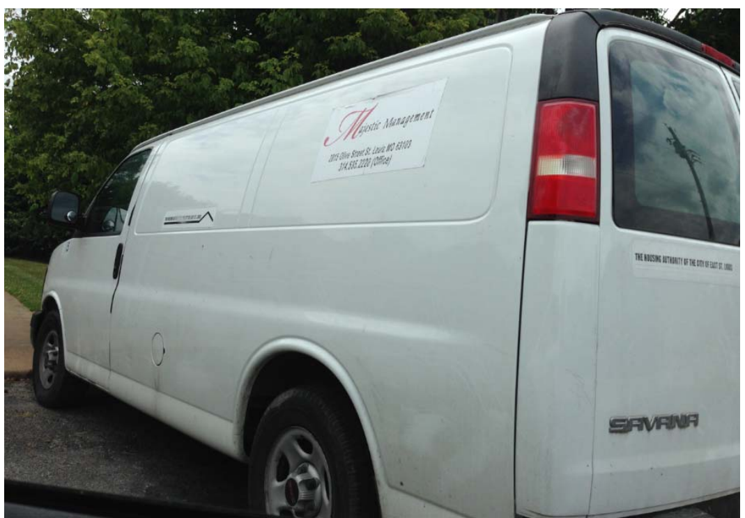
Van purchased from housing authority with New Horizons' funds - photographed on June 28, 2016

Majestic Management made a payment for $3,925 from New Horizons to a non-HUD project. Majestic Management did not provide an eligible purpose for this payment.