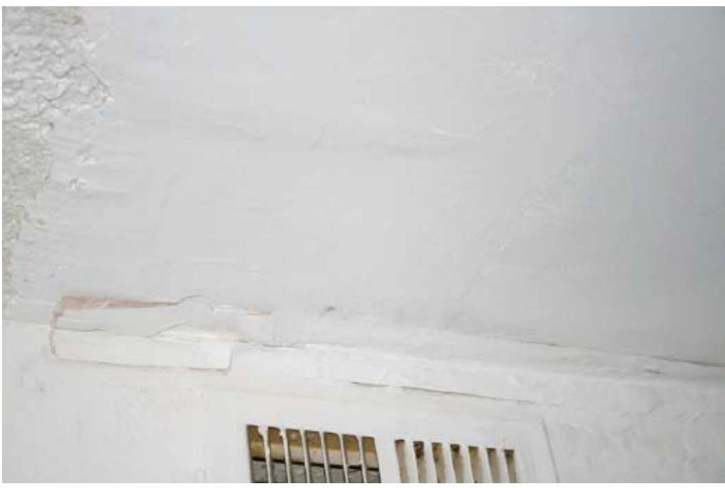
Sheetrock not properly finished - photographed on June 21, 2016