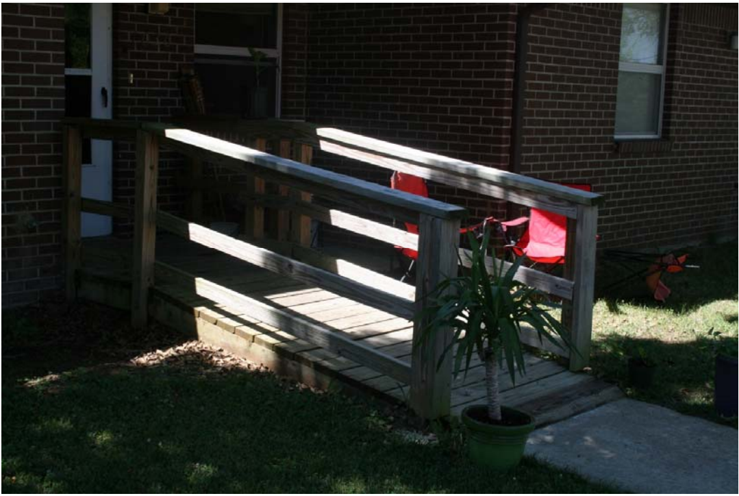
No concrete transition - June 27, 2016