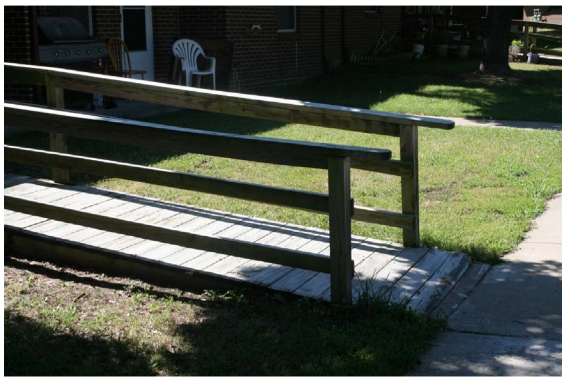
No concrete transition - June 27, 2016