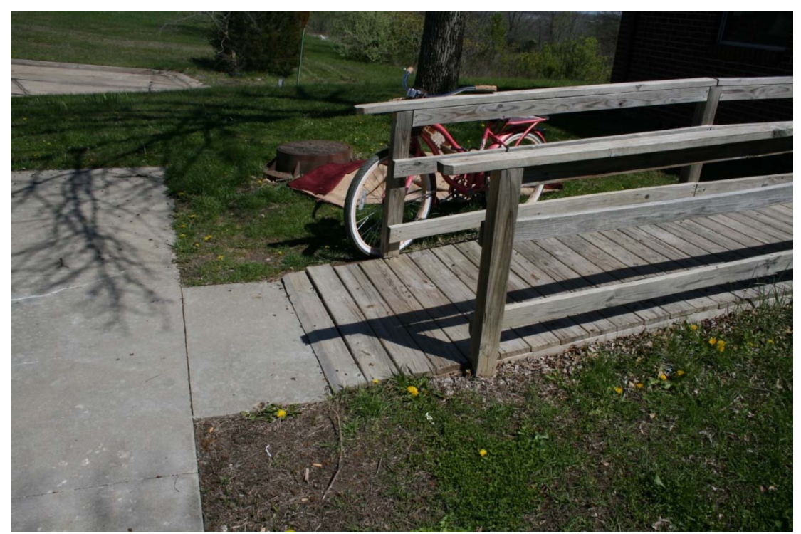
No concrete transition - April 13, 2016