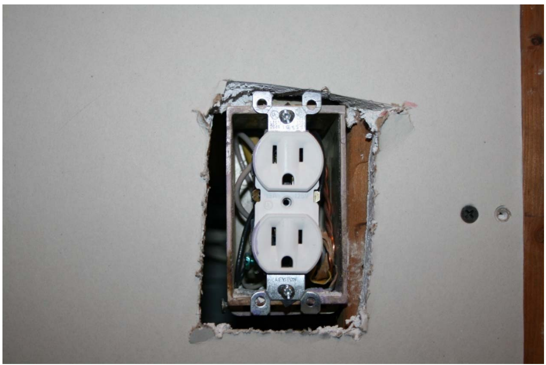
Outlet cover not installed - June 21, 2016