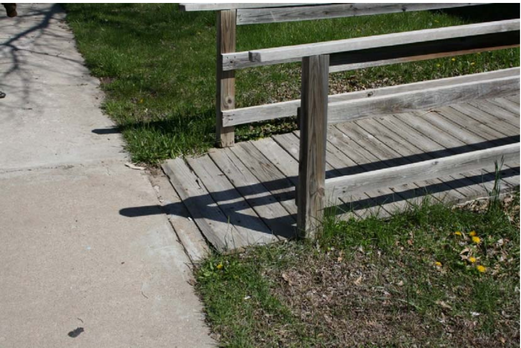
No concrete transition - April 13, 2016

Contractor hired to install and later to repair concrete transitions as well as complete tuckpointing at the Missouri Association of the Deaf Apartments, see finding 2.