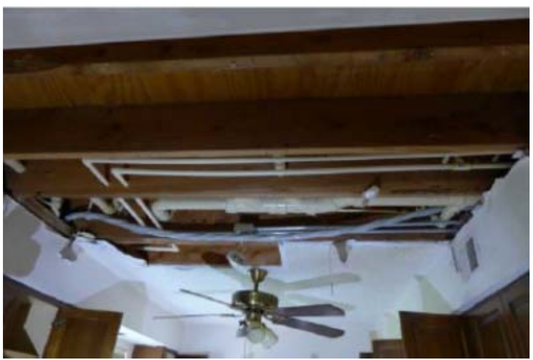
Insurance adjuster's photo showing damage to ceiling - August 10, 2015

Supreme Cleaning and Maintenance repaired damage at 1715 Linwood, Kansas City, MO 64109 following a 2015 vandalism at New Horizons, see finding 2.