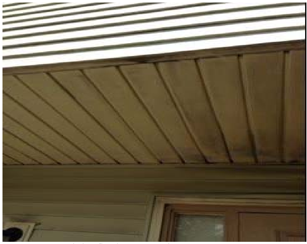
Existing fire damage to unit - August 30, 2016