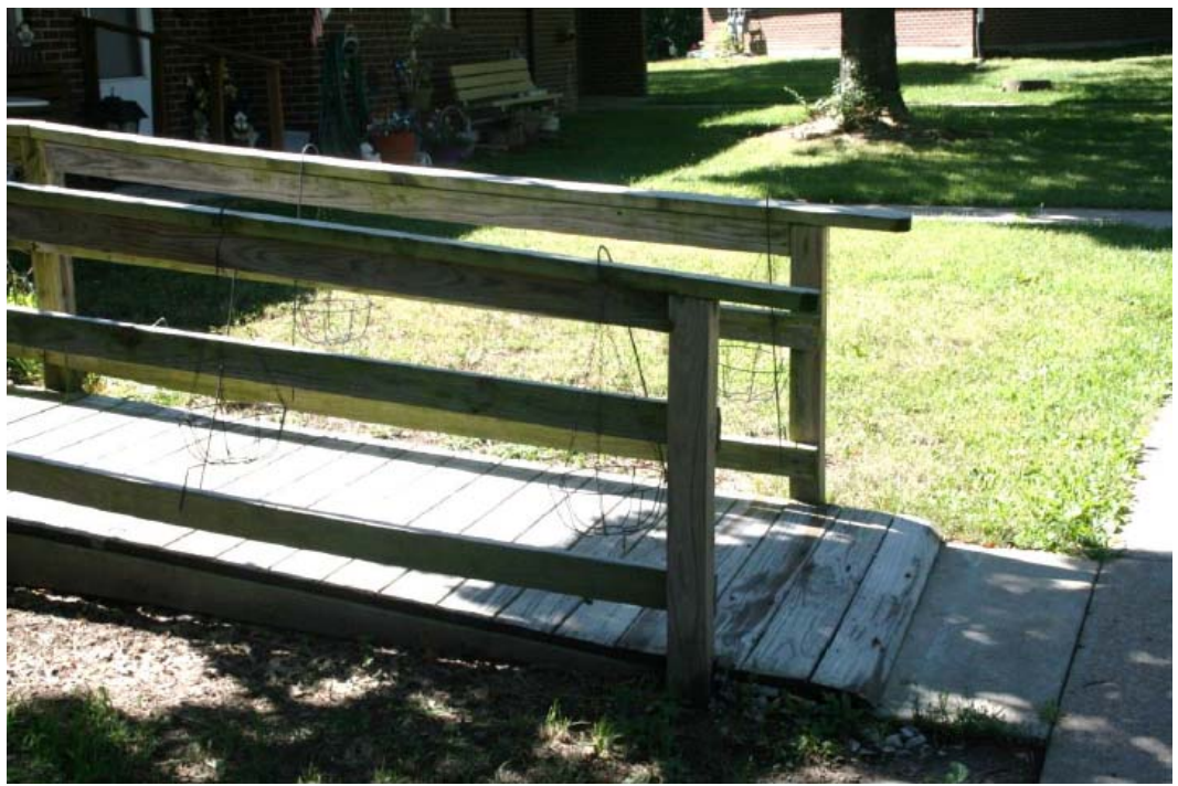
Concrete transitions to handicapped ramps not installed - photographed on June 27, 2016

In 2014, Majestic Management submitted an insurance claim for the Missouri Association of the Deaf Apartments related to storm damage. This claim resulted in a payout from insurance to the project of nearly $83,000 for the replacement of the roofs on eight buildings. Majestic Management paid its identity-of-interest company, Majestic Maintenance and Construction, to complete the roofing repairs. Majestic Management used project funds to pay Majestic Maintenance and Construction $69,562 to replace the roofs. However, it only completed two roofs, which should have cost $17,000.