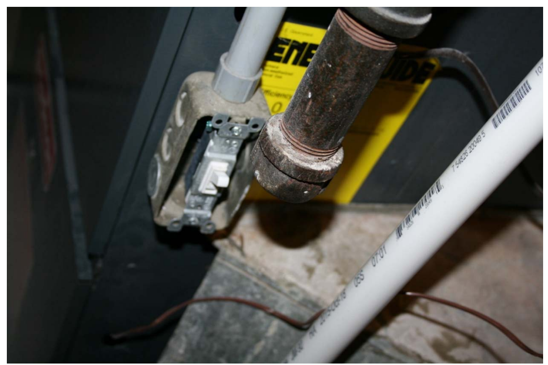
Switch cover not installed - June 21, 2016