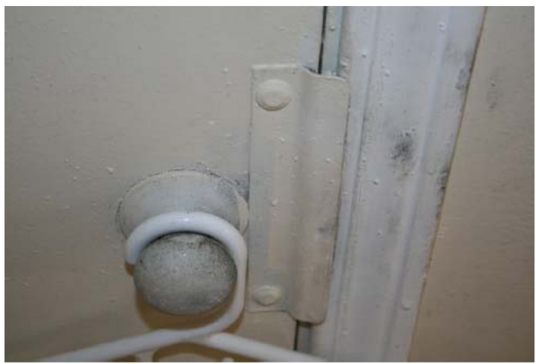
Soot from fire bleeding through paint - photographed on June 21, 2016