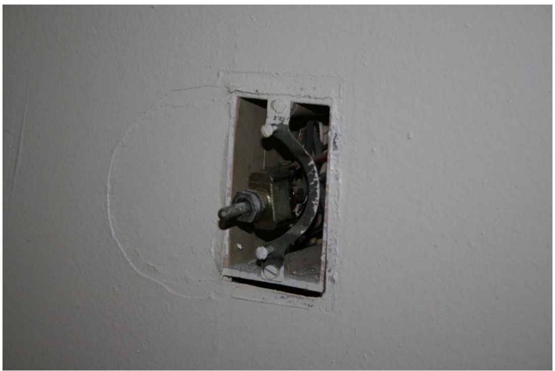
Switch cover not installed - June 21, 2016