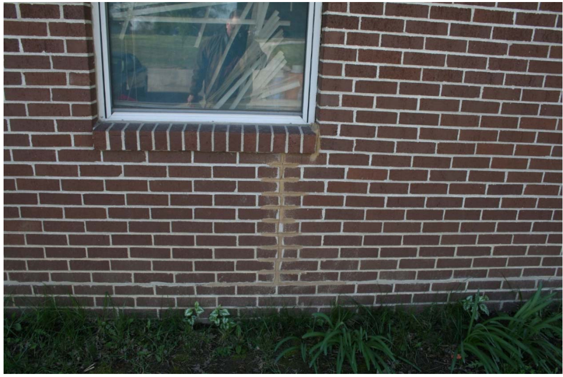
Poorly completed tuck-pointing - April 13, 2016