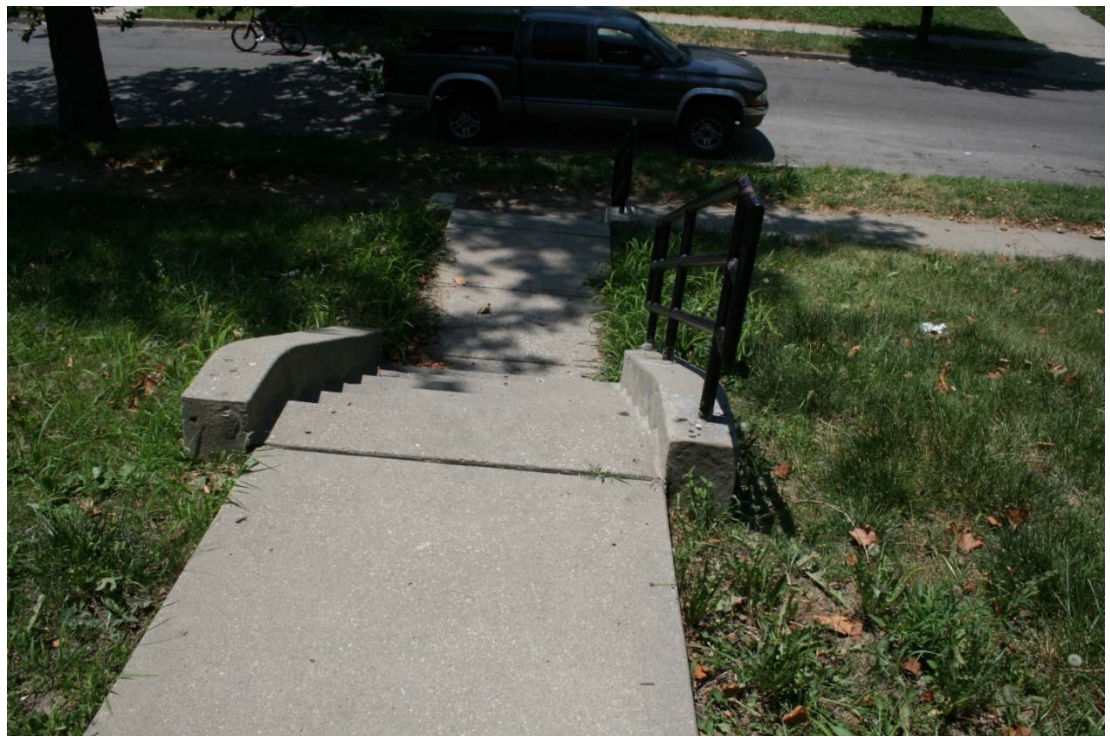
No additional plants lining sidewalk - June 21, 2016

The New Horizons property at 2643 Garfield Avenue, Kansas City, MO 64127 had an overgrown lawn, see finding 2.