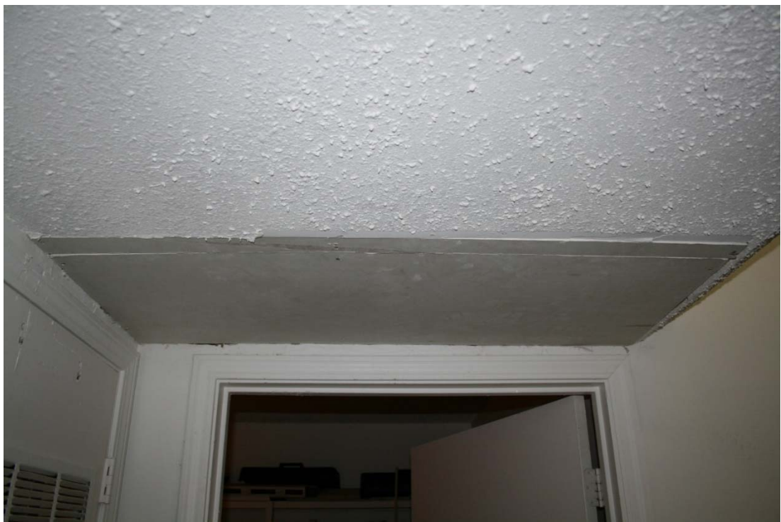
Poorly patched drywall - June 21, 2016