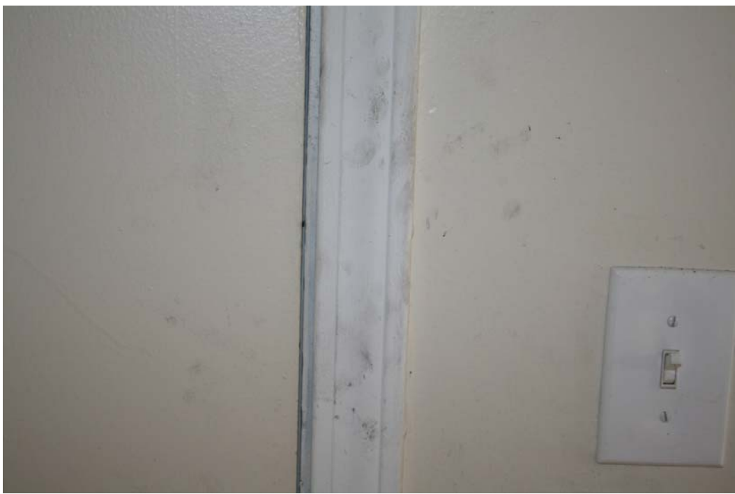
Smoke stains bleeding through paint - June 21, 2016

Supreme Cleaning and Maintenance repaired damage at 1715 Linwood, Kansas City, MO 64109 following a 2015 vandalism at New Horizons, see finding 2.