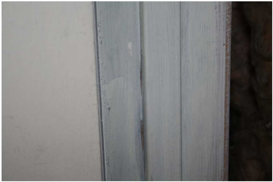
Smoke stains bleeding through paint - June 21, 2016