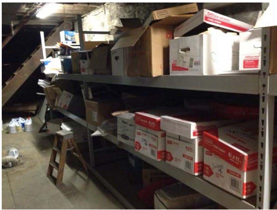
Record retention system located in the basement of the Majestic Management office - photographed on June 30, 2016

Majestic Management did not have an organized system of records. Its employees stated that the company had basically quit the multifamily property management business and had packed up records before the start of our audit so it was often hard for them to locate the documents requested. When we brought up the lack of an organized system of records, Majestic Management's attorney stated that the records were organized and compared the current system to an unassembled puzzle; that is, while it appeared unorganized with the pieces apart, it looked different when the pieces were assembled. The records management system can be viewed in the photo below.