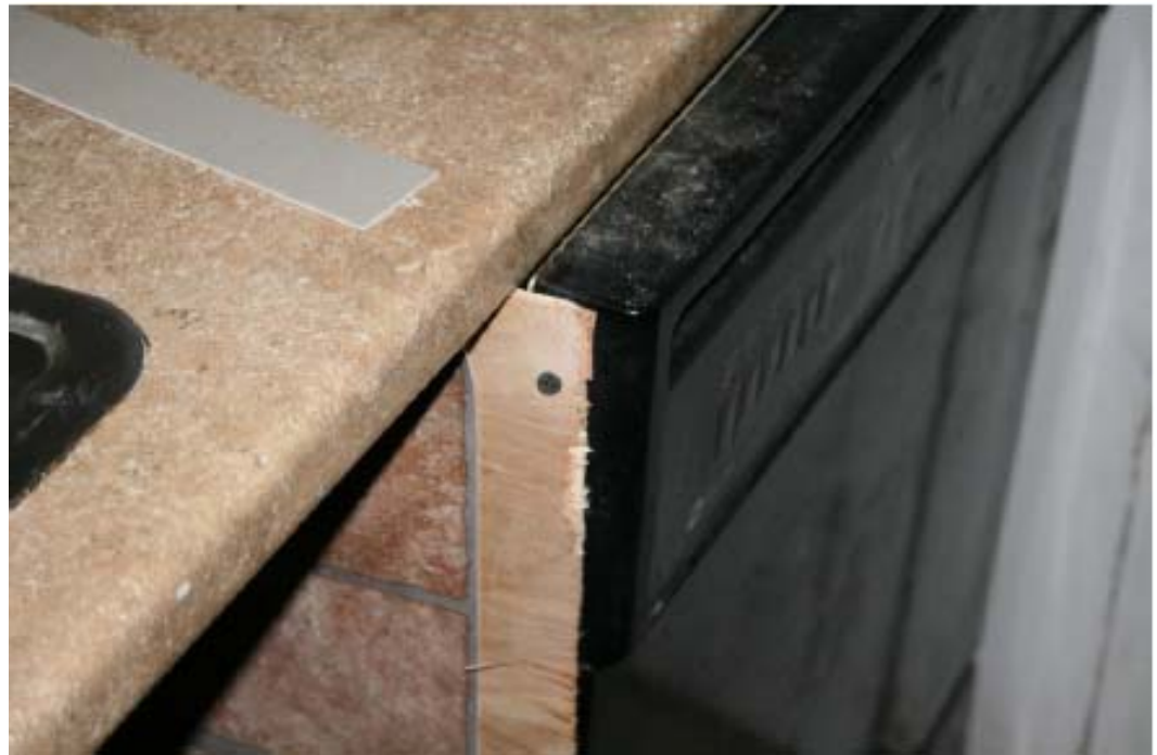
Dishwasher not operational and screwed closed - photographed on June 21, 2016

Majestic Management hired an employee-owned company, MRB Construction, to install a dishwasher at the New Horizons project in 2014. However, the dishwasher currently in the unit had a manufacture date of 1999 and was not operational because it was screwed shut as shown in the photo below.