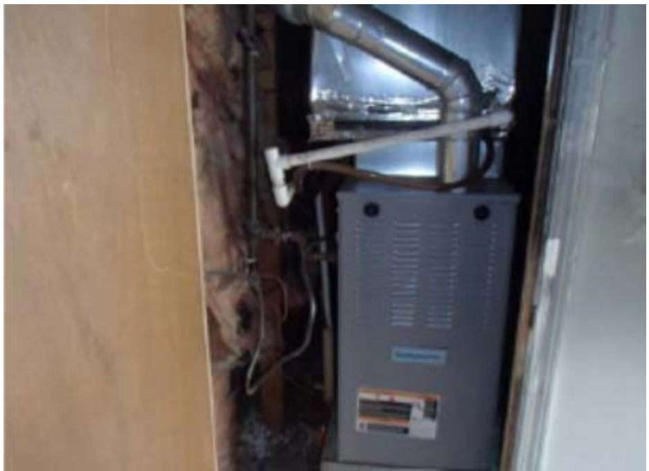
Insurance adjuster's photo showing smoke damaged insulation - July 10, 2013