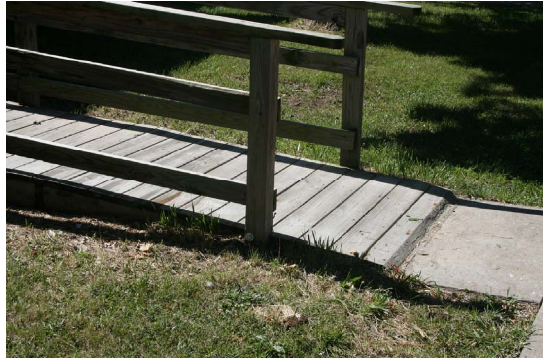
No concrete transition - June 27, 2016