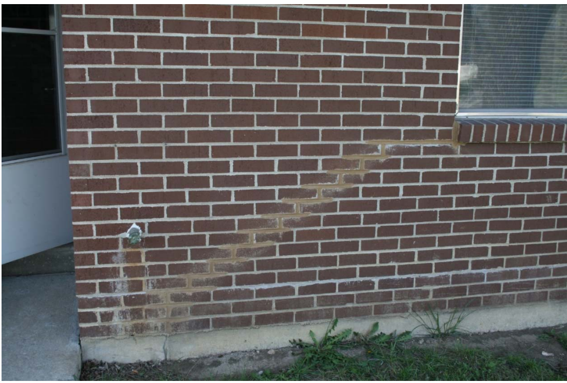
Poorly completed tuck-pointing - April 13, 2016