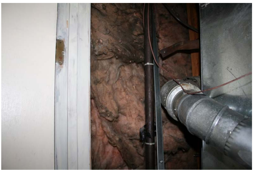
Smoke damaged insulation - June 21, 2016