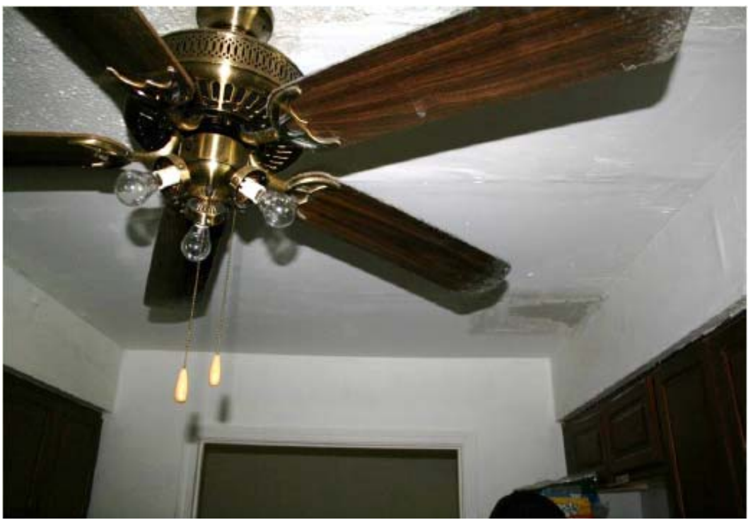
Poorly patched ceiling in kitchen after vandalism - photographed on June 21, 2016

completed as shown in the photos below. There were missing breakers in the breaker panel and outlet and junction box covers were not installed.