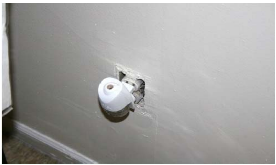
Poorly patched wall and receptacle cover not replaced after fire - photographed on June 21, 2016

In 2015, one of the New Horizons units was vandalized. Vandals opened walls and ceilings to steal copper wiring and plumbing from the unit. Majestic Management paid an identity-of-interest company, Supreme Cleaning and Maintenance, to complete nearly $70,000 in repairs to the unit. However, the ceilings and walls were poorly patched, and electrical work was not