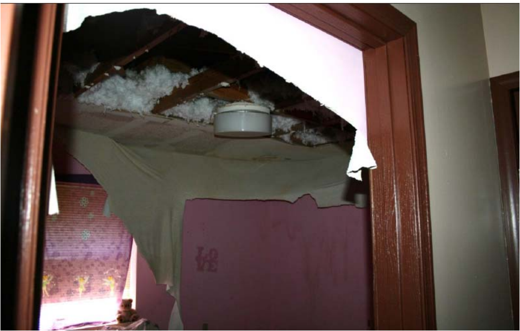
Ceiling collapse due to water damage - photographed on April 13, 2016

Overbilled transactions left fewer funds available for upkeep of the projects. Since project funds were not always spent at the most reasonable prices, fewer funds were available for maintenance items. For example, at the New Horizons project, the lawn was left overgrown, and there were many broken windows as shown in the photos below.