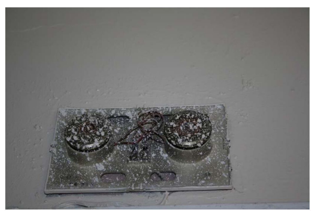
Fixture not removed prior to repainting - June 21, 2016