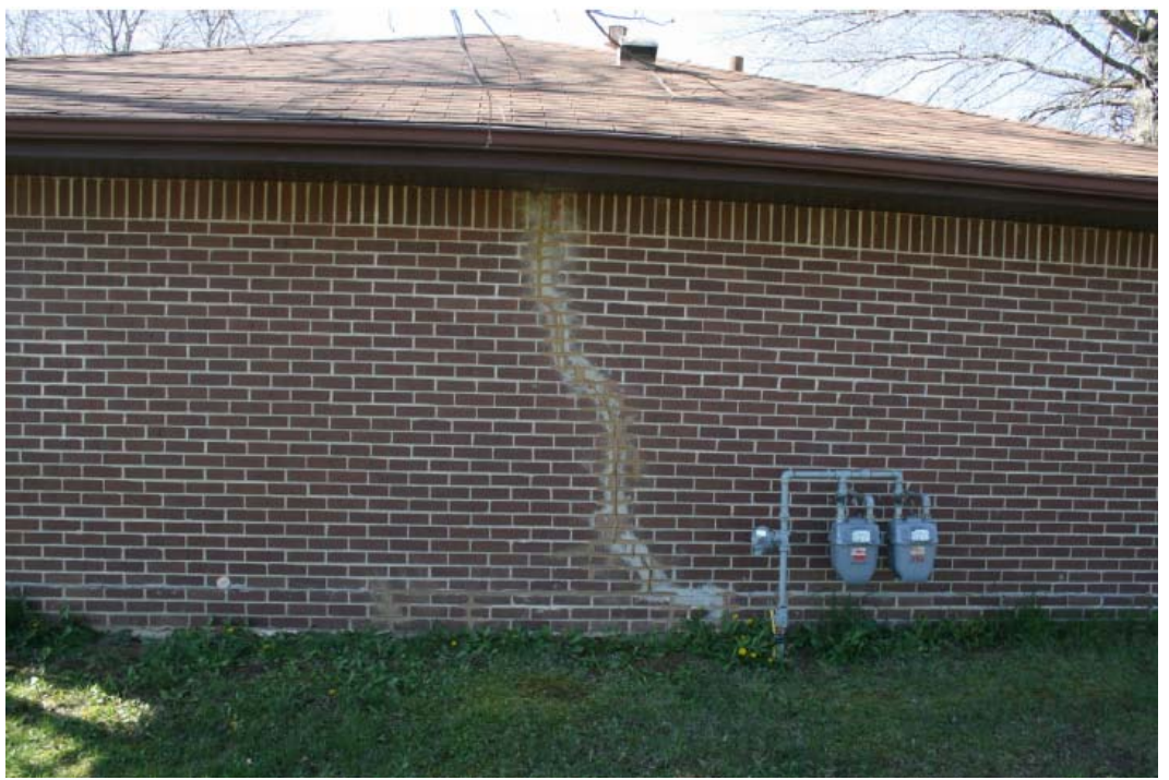
Poorly completed tuck-pointing - photographed on April 13, 2016

At the Missouri Association of the Deaf Apartments in Fulton, MO, Majestic Management paid to have tuck-pointing on the buildings and concrete transitions to handicapped ramps installed. However, the tuck-pointing was poorly completed. The onsite property manager stated that the contractor Majestic Management hired did not complete the work and the project's maintenance man completed the tuck-pointing. In addition, the concrete transitions were not installed. These deficiencies are shown in the photos below. Majestic Management later hired the same contractor to repair the nonexistent concrete transitions.