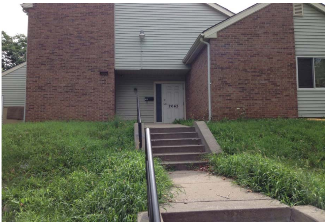
Unattended weeds at New Horizons - photographed on July 14, 2016

Overbilled transactions left fewer funds available for upkeep of the projects. Since project funds were not always spent at the most reasonable prices, fewer funds were available for maintenance items. For example, at the New Horizons project, the lawn was left overgrown, and there were many broken windows as shown in the photos below.