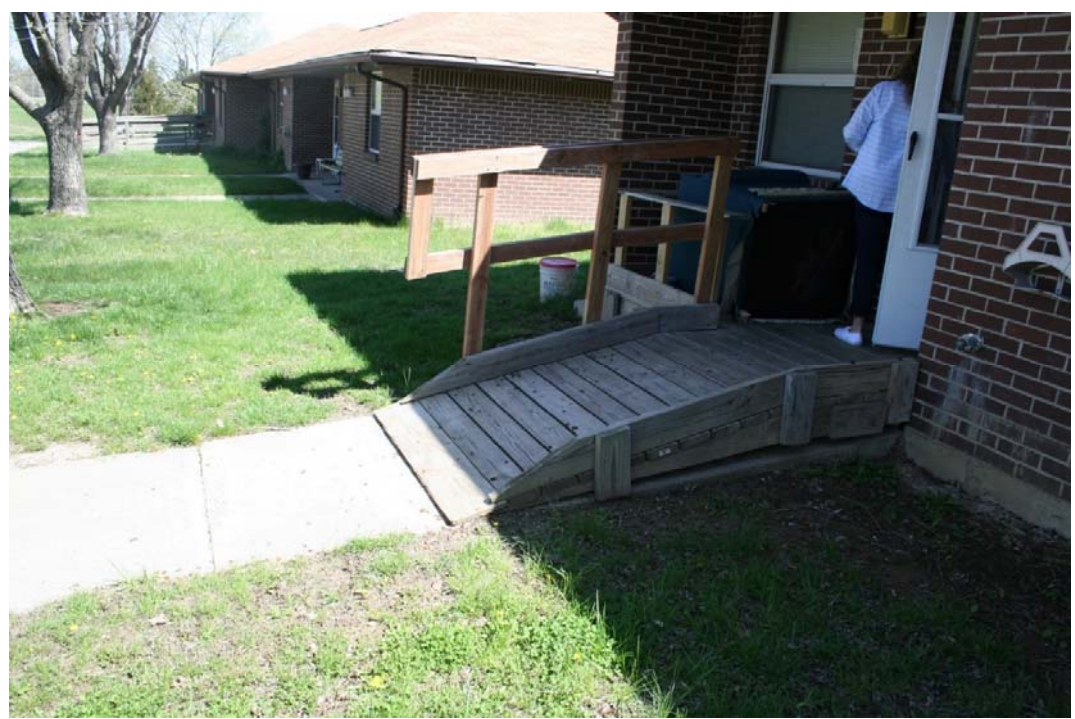
No concrete transition - April 13, 2016