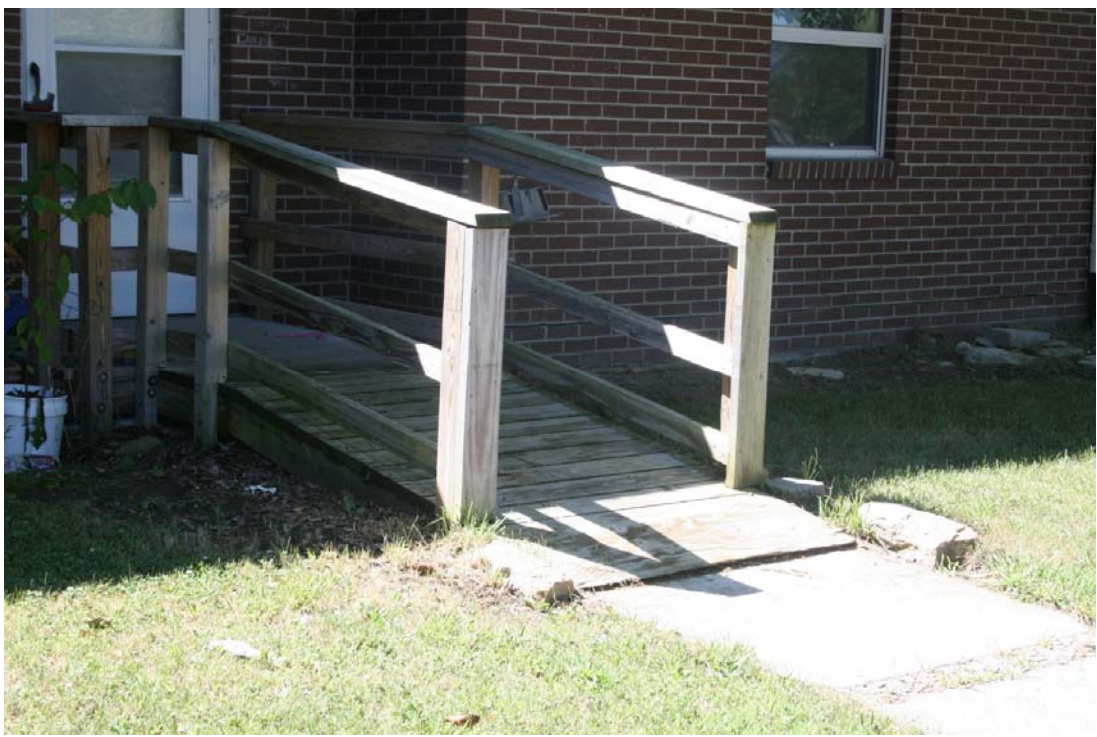
No concrete transition - June 27, 2016