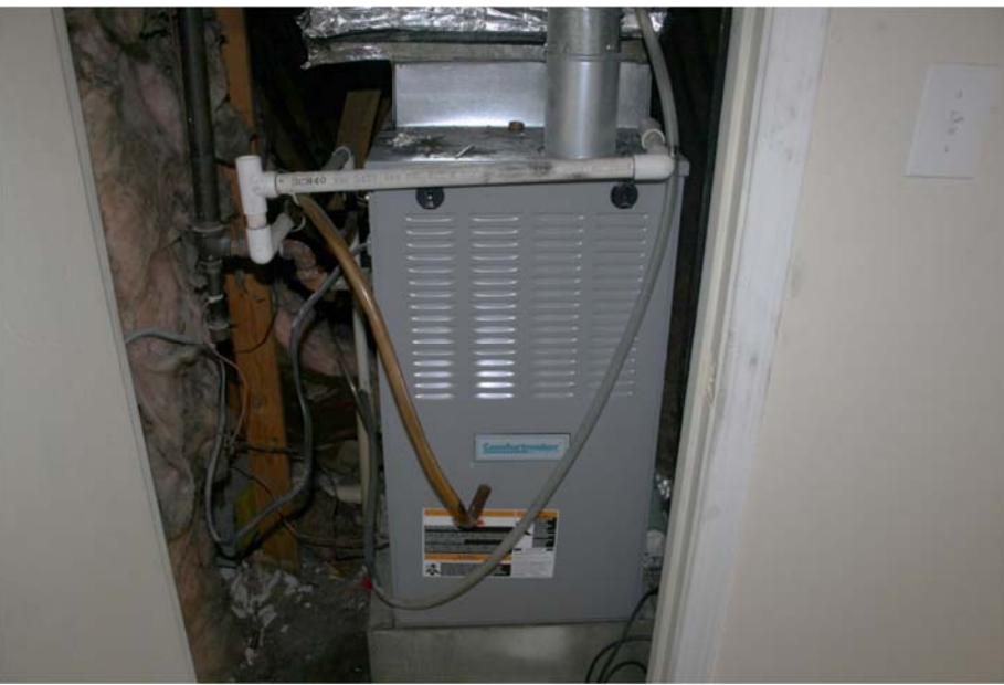
Smoke damaged insulation - June 21, 2016

Majestic Maintenance and Construction repaired fire damage at 3920 East Linwood, Kansas City, MO 64128 following a 2013 fire at New Horizons, see finding 2. Dates below refer to the date the picture was taken.