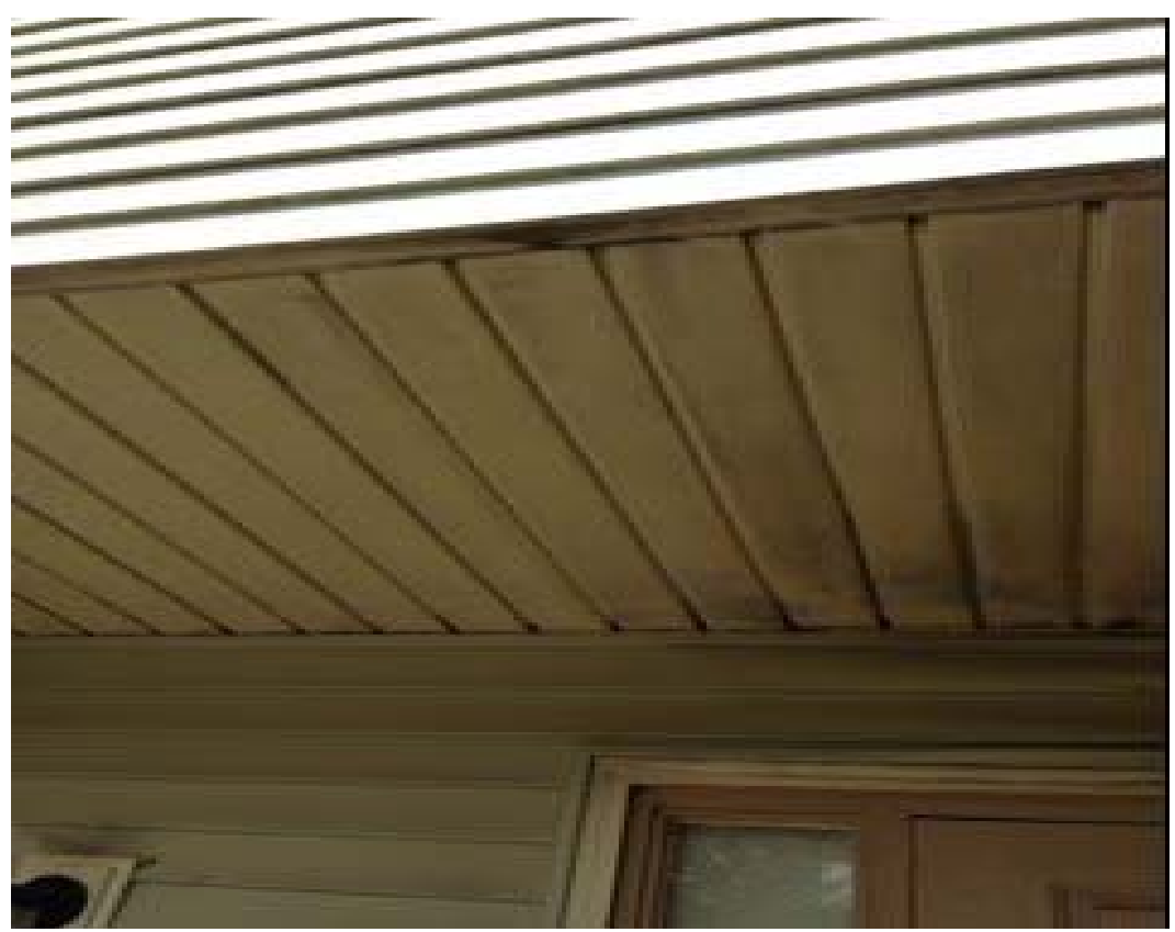
Existing fire damage to unit - photographed on August 30, 2016