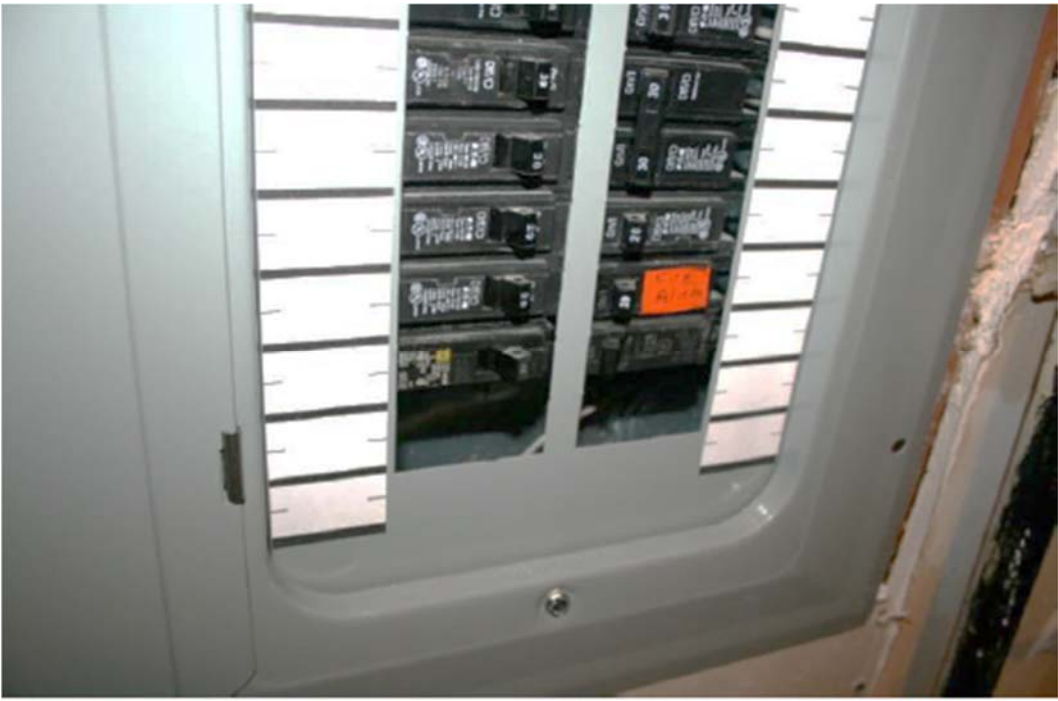
Missing breakers in breaker panel - photographed on June 21, 2016

Majestic Management hired an employee-owned company, MRB Construction, to install a dishwasher at the New Horizons project in 2014. However, the dishwasher currently in the unit had a manufacture date of 1999 and was not operational because it was screwed shut as shown in the photo below.