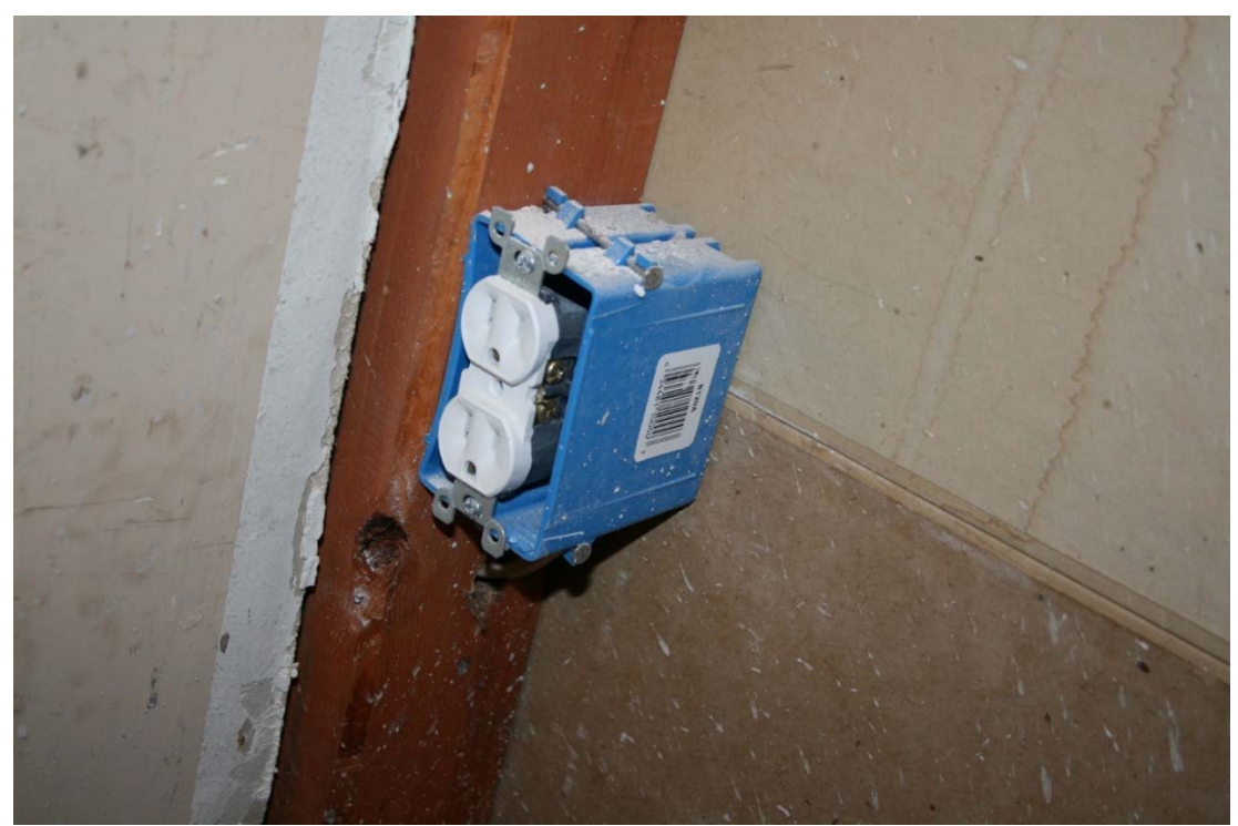
Outlet cover not installed - June 21, 2016