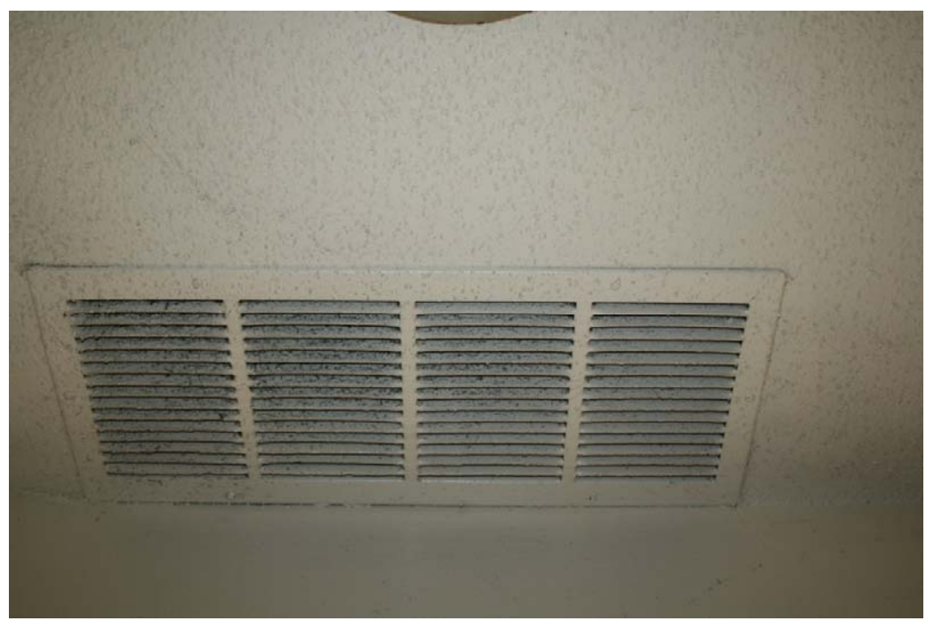
Return vent painted and textured over - June 21, 2016