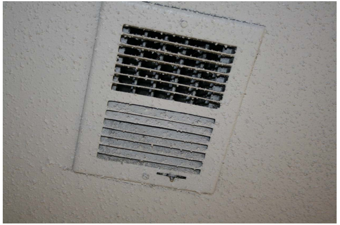
Air vent painted and textured over - June 21, 2016