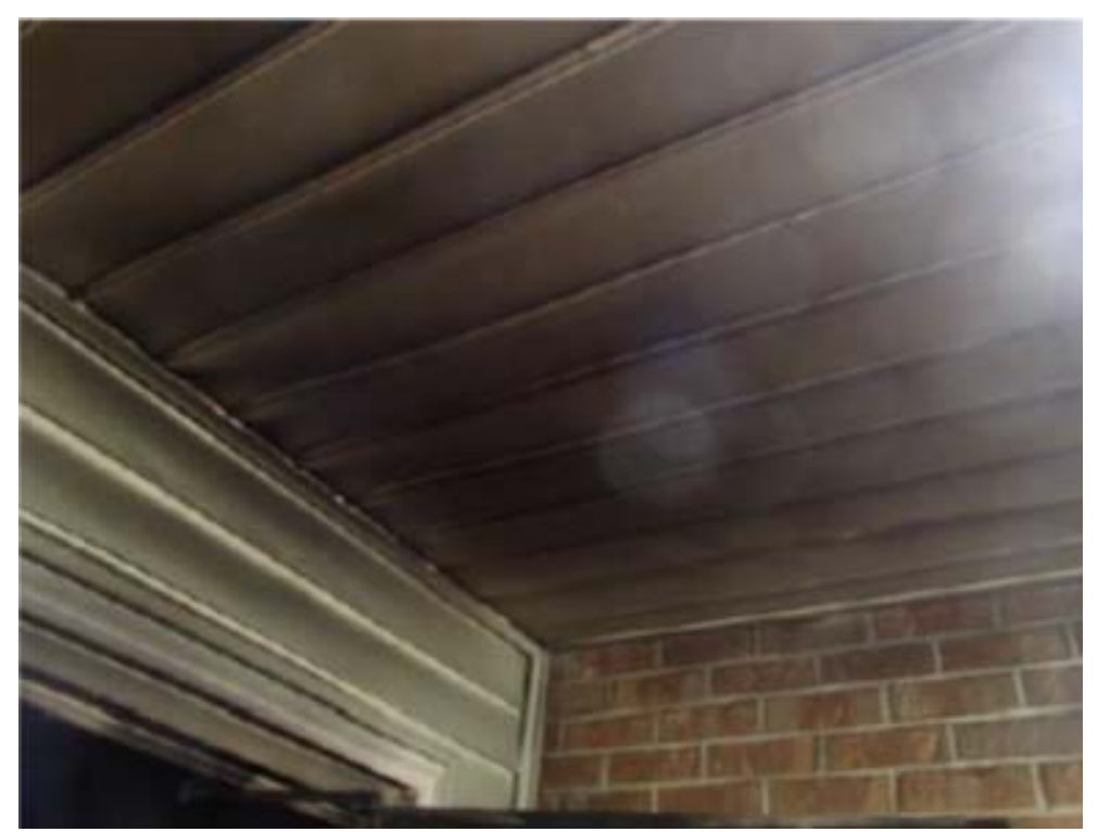
Insurance photo showing smoke damage to exterior vinyl – July 10, 2013