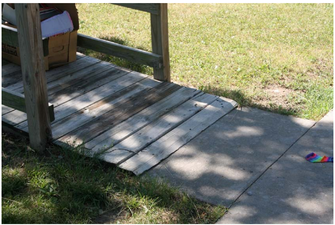
No concrete transition – June 27, 2016