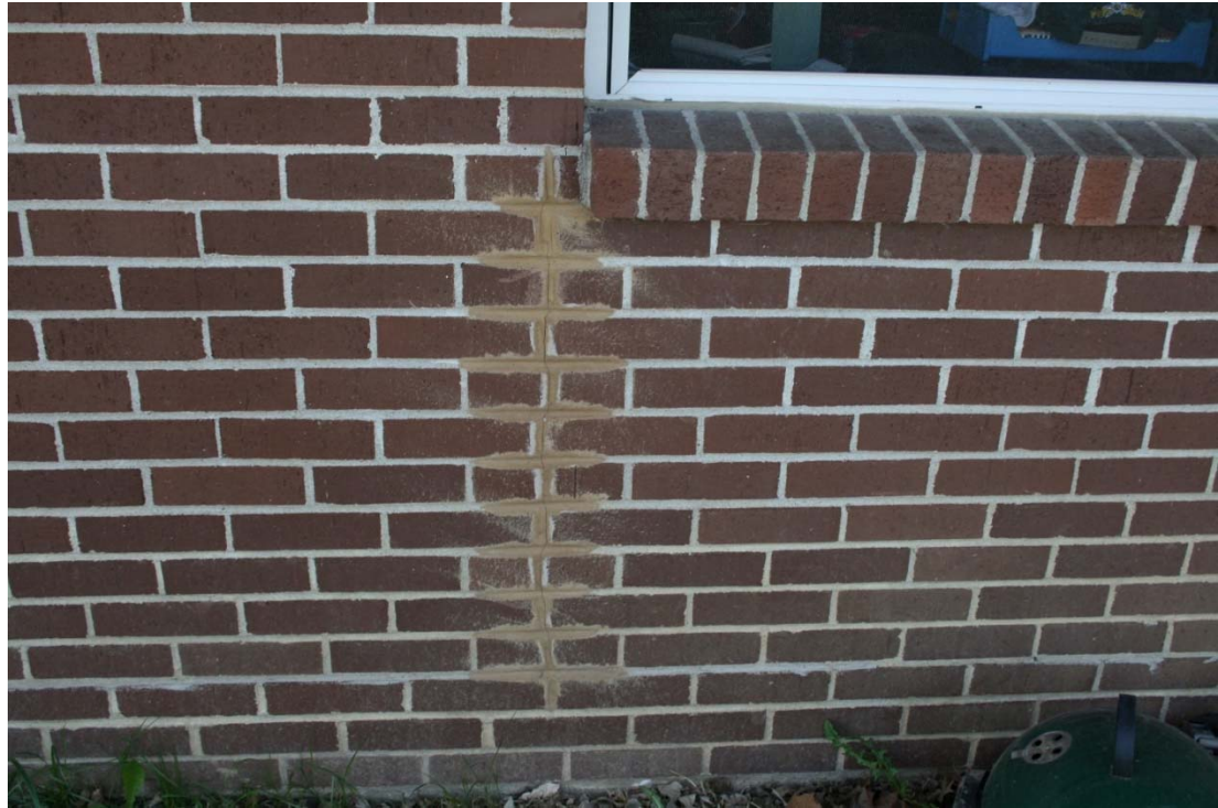
Poorly completed tuck-pointing - April 13, 2016