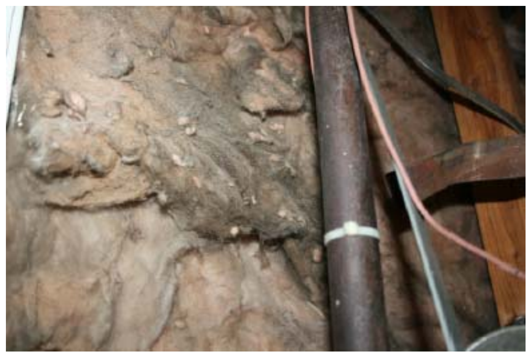
Smoke-damaged insulation not replaced after fire – photographed on June 21, 2016