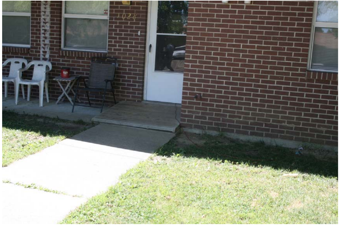
No concrete transition - June 27, 2016