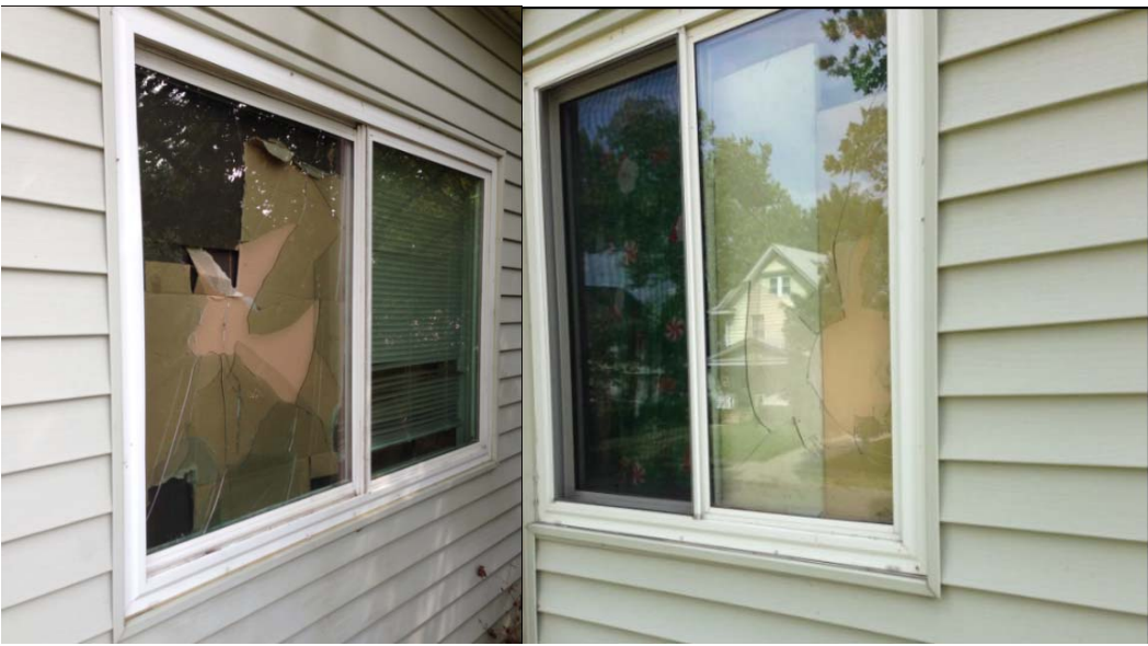
Broken windows at New Horizons - photographed on August 23, 2016

Improper procurement practices restricted competition and placed Federal funds at risk of misuse. In addition, goods and services may not have been obtained at the most reasonable price. Majestic Management restricted competition when it noncompetitively procured goods and services without obtaining quotes. Majestic Management's failure to execute contracts for its procurements also placed the Federal funds spent at risk since the purchases were not subject to the required contract provisions, such as antikickback requirements, access to records relating to the contract, and the retention of records. Majestic Management's failure to follow proper procurement processes may have resulted in projects overpaying for goods and services. Federal procurement requirements help to ensure that purchases are made through full and open competition at the most reasonable prices.