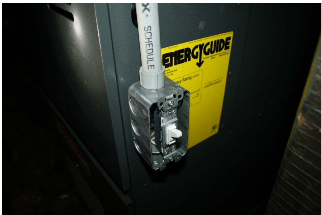
Switch cover not installed - June 21, 2016

The New Horizons property at 2643 Garfield Avenue, Kansas City, MO 64127 had an overgrown lawn, see finding 2.