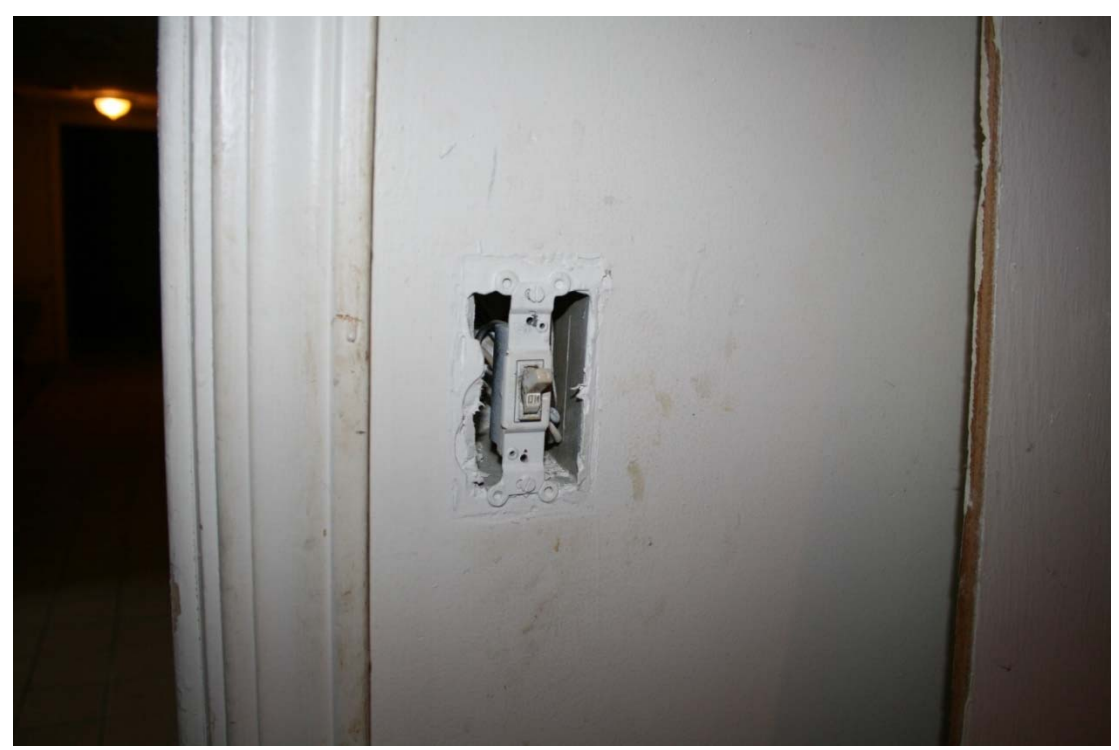
Switch cover not installed - June 21, 2016