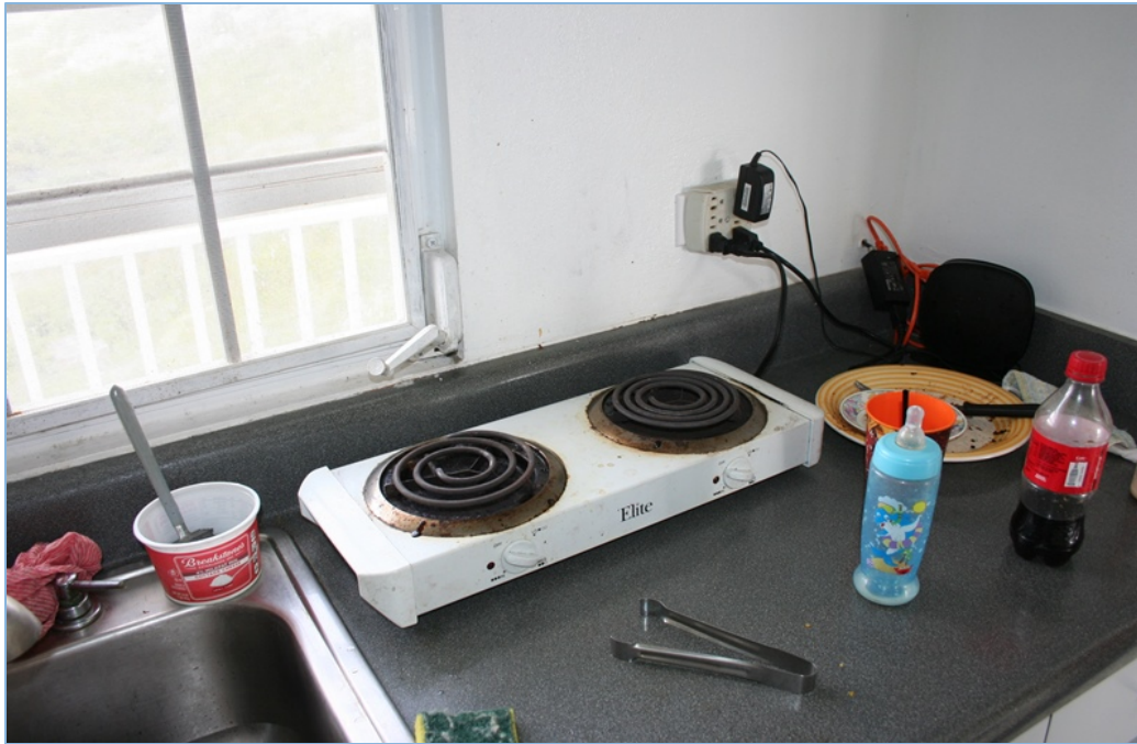
The picture above shows that a hot plate is used for cooking. Hot plates are not acceptable substitutes for stoves or ranges.