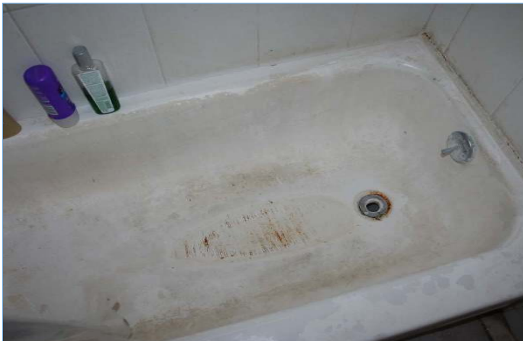
The picture above shows a damaged and rusted tub drain with a peeling and chipped finish. The rusted and sharp borders create a cutting hazard.