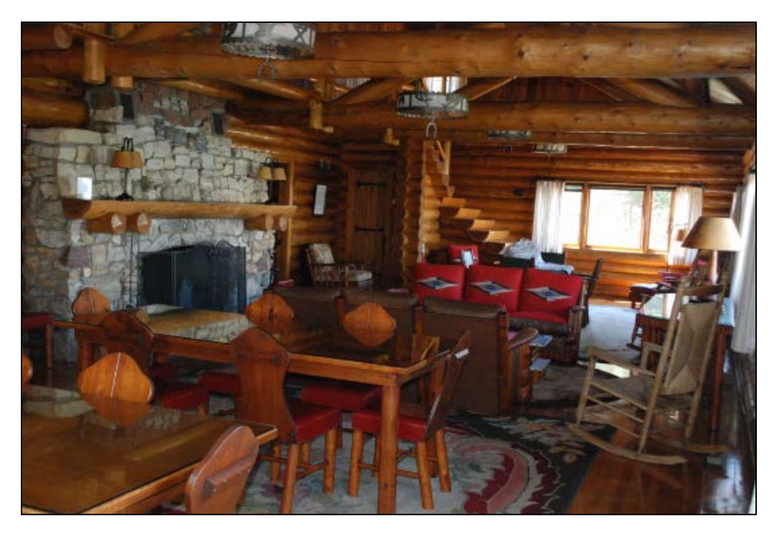
Figure 1. The Lodge's living area, featuring Thomas Molesworth furniture.