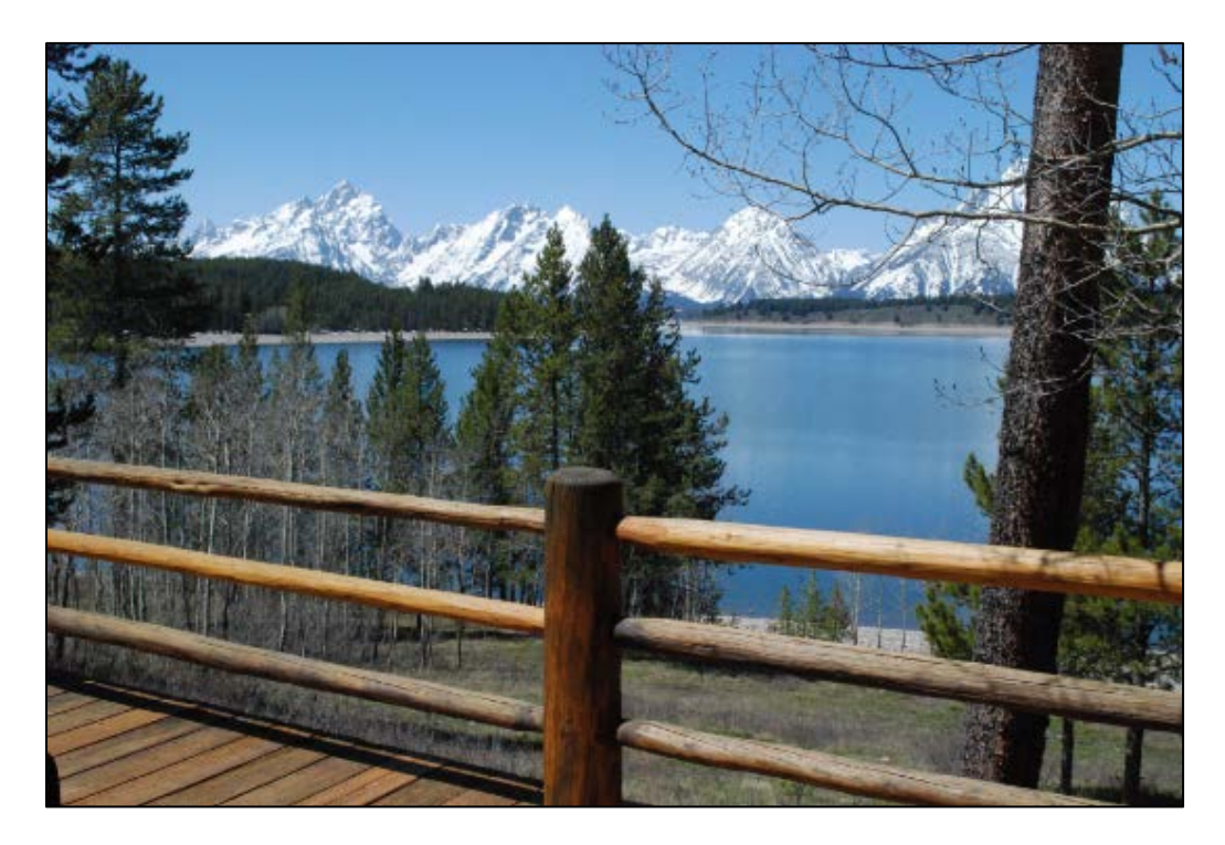
Figure 2. The view of Jackson Lake from the Lodge's deck. The lake is a possible pump site in case of a structure fire.

control. In case an emergency call needs to be placed, the Lodge and caretaker's cabin both have telephone landlines. Cellular phone reception in and near the Lodge, however, is weak.