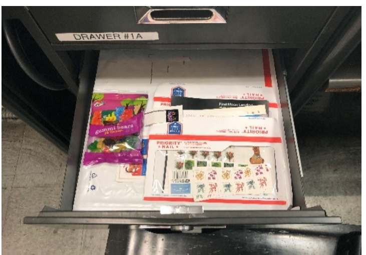
Figure 1. Unsecured stamps in drawer

Nine out of 10 retail stations had unlocked drawers containing stamps. In addition, one of the nine unlocked drawers with stamps also contained cash totaling $116 and 225 blank domestic money orders (see Figure 1 and Figure 2).