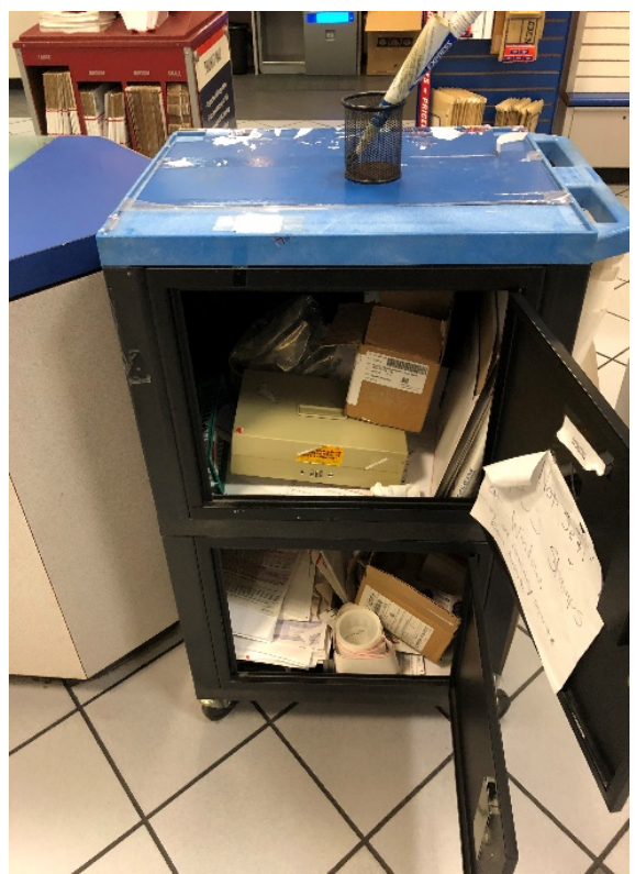
Figure 3. Unlocked cash box in unlocked mobile unit

• A rolling cart located on the retail floor had an unlocked compartment containing an unlocked lockbox containing stamps and cash totaling $36 (see Figure 3).