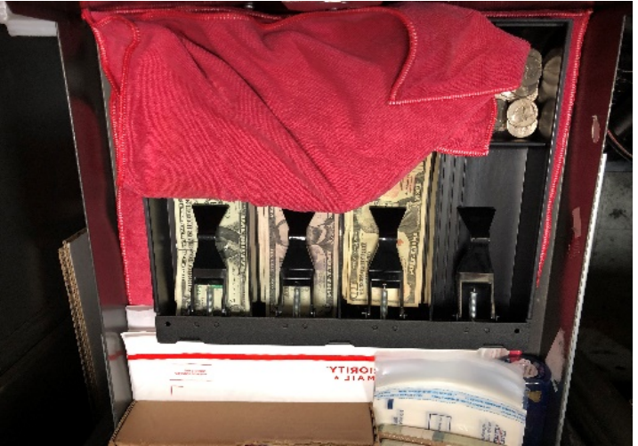
Figure 2. Unsecured money and money orders in drawer