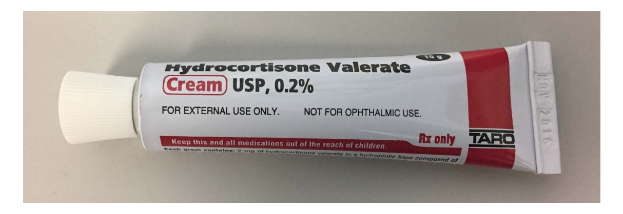
Photograph 5: Hydrocortisone Valerate cream expired in November 2016. (Cream photograph on March 23, 2018.) Using expired medical supplies increases the risk of infection or injury to patients.