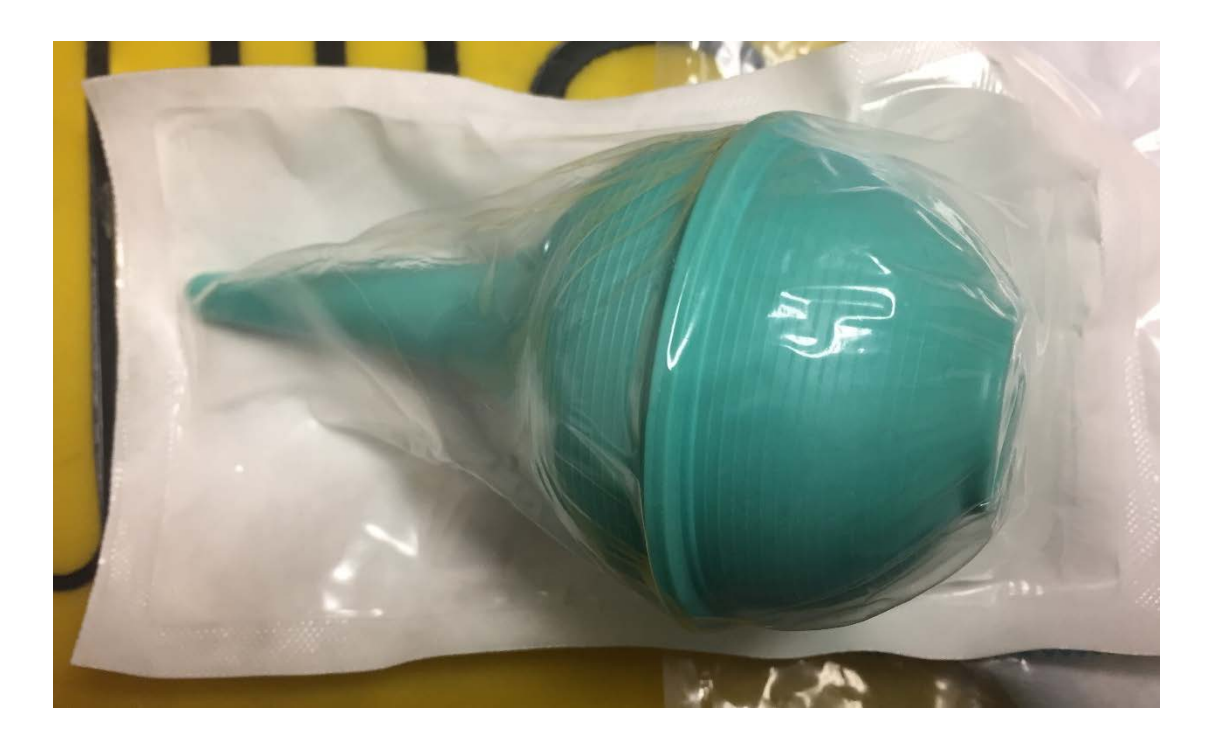
Photograph 4 (package back): Ear and ulcer syringe expired in November 2014. (Syringe photographed on March 23, 2018.) Using expired medical supplies increases the risk of infection or injury to patients.