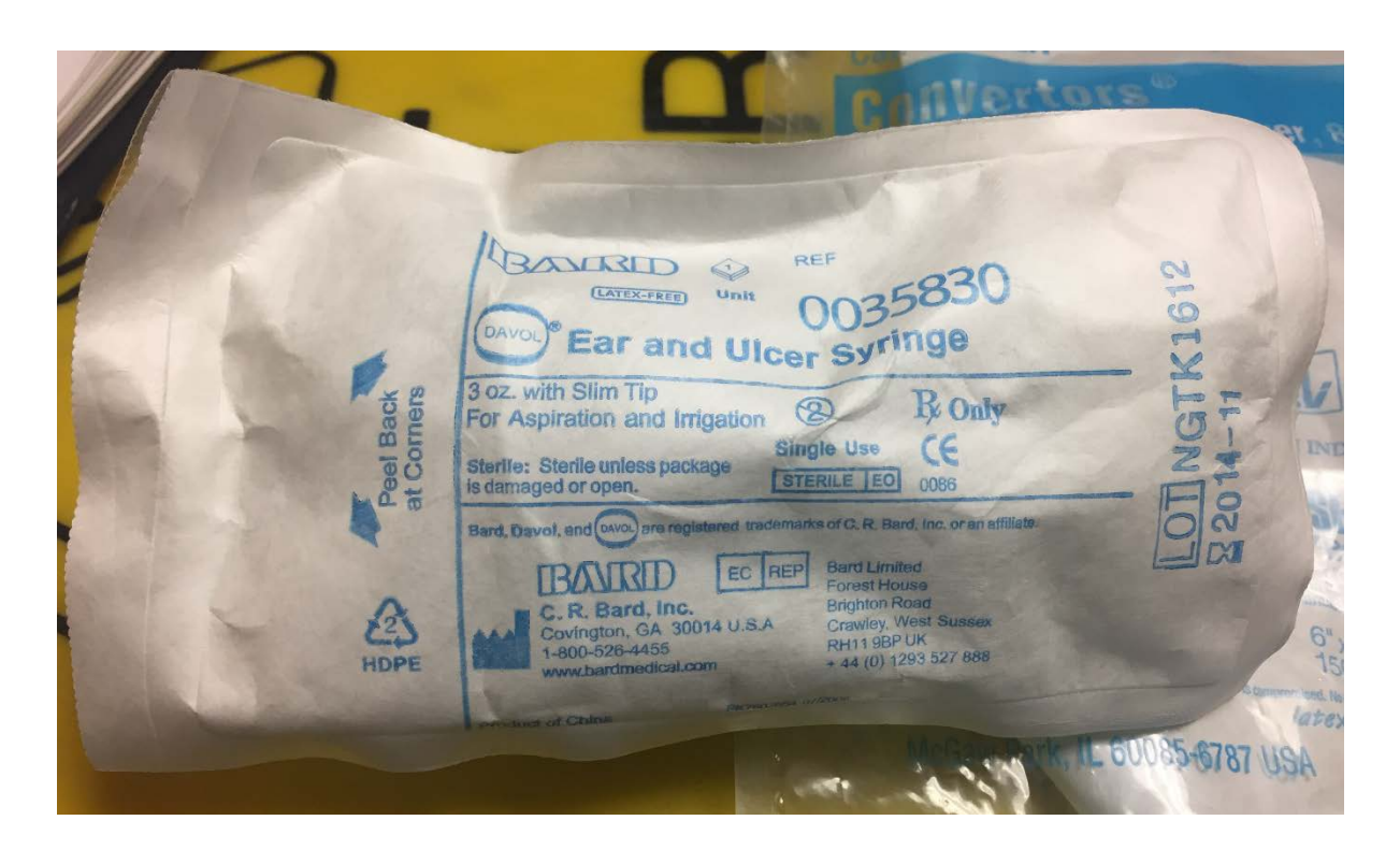
Photograph 3 (package front): Ear and ulcer syringe expired in November 2014. (Syringe photographed on March 23, 2018.) Using expired medical supplies increases the risk of infection or injury to patients.