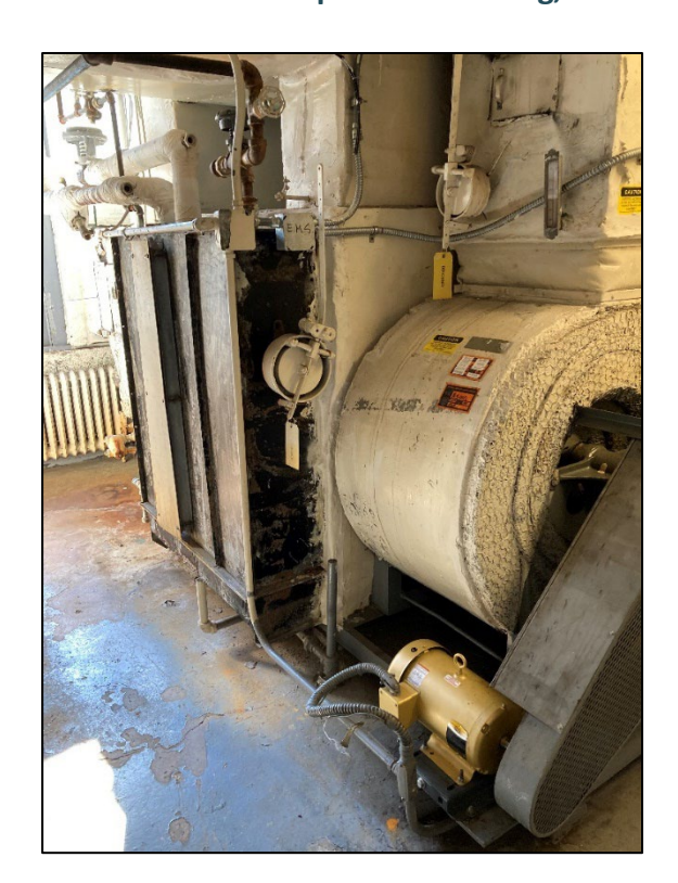
Figure 1 – AHU in the GSA Headquarters Building, Washington, D.C.9

GSA Headquarters Building, Washington, D.C. The O&M contractor's chief engineer told us that some of the AHUs in this facility date back to 1947 (see Figure 1 ). The building is a mixture of renovated and unrenovated space. The renovated space currently uses MERV 15 air filters. However, the chief engineer told us that AHUs in the unrenovated space are incapable of handling MERV 13 or higher rated air filters. He also told us that he upgraded to MERV 10 air filters prior to the pandemic and added that existing MERV 10 air filters in the unrenovated space are already stressing the AHUs.