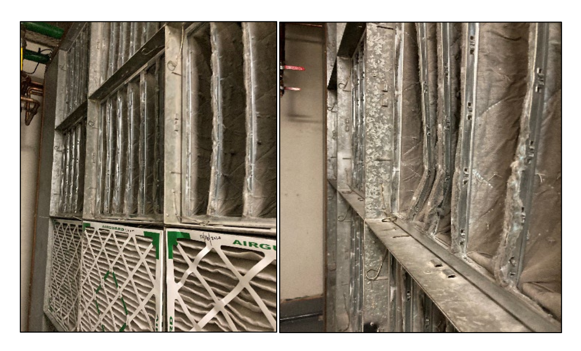
Figure 8 – AHU with Missing Air Filters at the Airport Corporate Centre, Oakland, California<sup>16</sup>

In sum, PBS building managers for 13 of the 16 leased spaces we inspected told us that GSA does not inspect mechanical rooms. Instead, building managers told us that annual inspections of lease locations are typically limited to areas such as cleaning, repair and alteration projects, and space configuration. However, PBS has much broader access rights available under GSAM 552.270-9, Inspection—Right of Entry . PBS should exercise these rights to periodically inspect mechanical rooms to ensure that air filters meet lease requirements and help prevent workplace exposures to airborne viruses, including the virus that causes COVID-19.