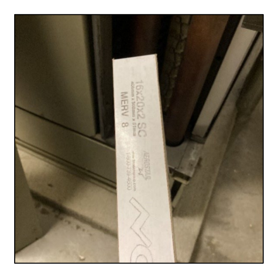
Figure 6 – MERV 8 Air Filter in Operation at Building 8 of the CDC Complex, Atlanta, Georgia<sup>14</sup>

The lessor's lead property engineer for the complex told us that both buildings require and use MERV 13 air filters, adding that RMR Group upgraded the AHUs from MERV 8 air filters in 2008. Upon inspection, we observed that MERV 13 air filters in some AHUs appeared to be new, with no dust accumulation. Further, in the fourth floor mechanical room of Building 8, we found MERV 8 air filters in operation (see Figure 6 ).