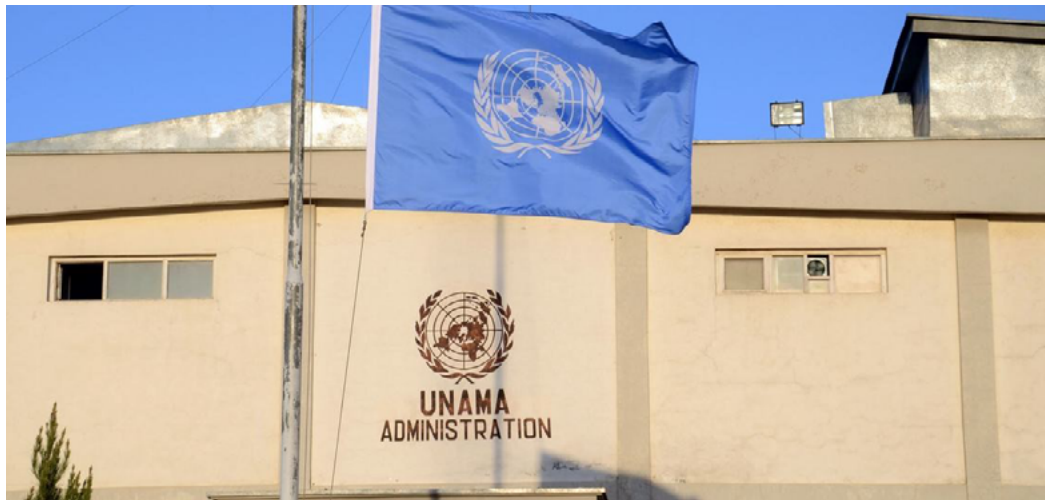
Headquarters of the UN Assistance Mission in Afghanistan in Kabul.