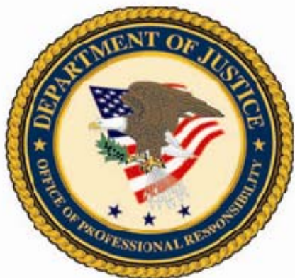
U.S. Department of Justice Office of Professional Responsibility