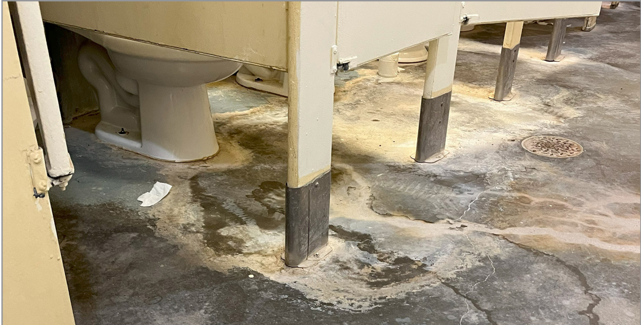
Figure. The Doña Ana Range Complex Bathroom with Sewage Leaking from the Plumbing

Furthermore, the 2SBCT Preventative Medicine team prepared reports for the 2SBCT Medical Officer in Charge from May through August 2025 and provided copies of those reports for our evaluation. The reports identified multiple health and safety concerns at the Doña Ana Range Complex. Specifically, the 2SBCT Preventative Medicine team's concerns included: