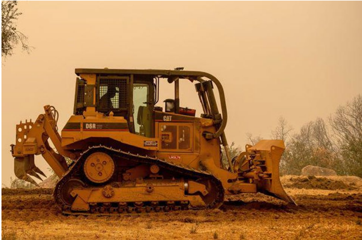
Figure 3: Heavy Equipment Bulldozer. Photo by FS Washington Office-FAM, Incident Business Branch. It does not depict any particular audit or investigation.

According to FS officials, fire activity varies by region and season, making it difficult for FS to predict equipment needs. To address this, FS creates a vendor pool by awarding I-BPAs to as many eligible vendors as possible to ensure sufficient equipment is available to meet fire incident needs. If I-BPA resources are not sufficient to meet the needs of a fire incident, FS will use a noncompetitive Emergency Equipment Rental Agreement (EERA) to obtain additional equipment. 8 FS reviews EERA data annually to identify frequently used equipment and to determine whether to add such equipment to the Plan to reduce costs. 9 Furthermore, FS coordinates with the State and other Federal agencies to obtain resources during the fire season.