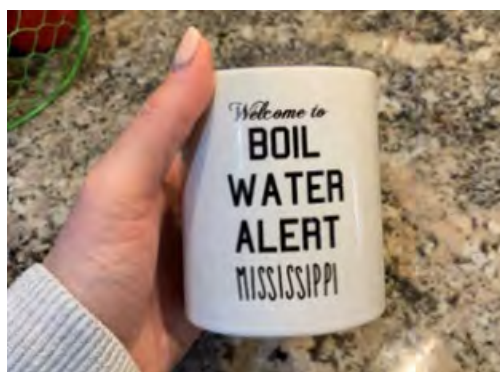
Figure 2: Mississippi mug

The five-to-six distribution line breaks per day put additional strain on the system to make up for the volume of water being lost. Additionally, according to the MSDH, boil water notices can result from aging infrastructure and distribution line breaks. From 2014 through 2022, Jackson issued approximately 1,570 boil water notices. Given the high number of boil water notices, merchandise depicting "Welcome to Boil Water Alert Mississippi" could be found around Jackson, such as the coffee mug shown in Figure 2.