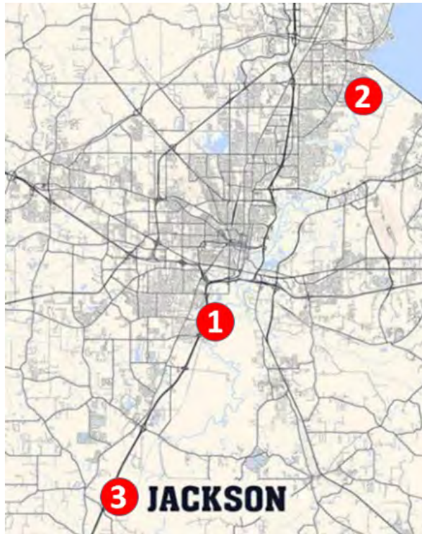
Figure 1: Jackson's drinking water sources

Notes: 1 = Pearl River, J.H. Fewell water treatment plant, 2 = Ross Barnett Reservoir, O.B. Curtis water treatment plant; 3 = Groundwater system, Maddox Road.