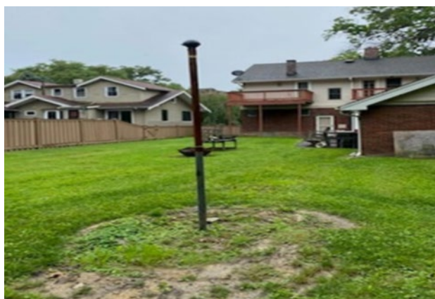
Figure 1: Unplugged Orphaned Gas Well on Residential Property in Ohio

The definition of an orphaned well varies by State. For purposes of the U.S. Department of the Interior's (DOI's) programs, an orphaned well on State land is a well that a State describes as eligible for plugging, remediation, and reclamation by the State. Orphaned wells pose public health and safety and environmental risks. According to DOI, millions of Americans live within one mile of an orphaned gas or oil well (see Figure 1).