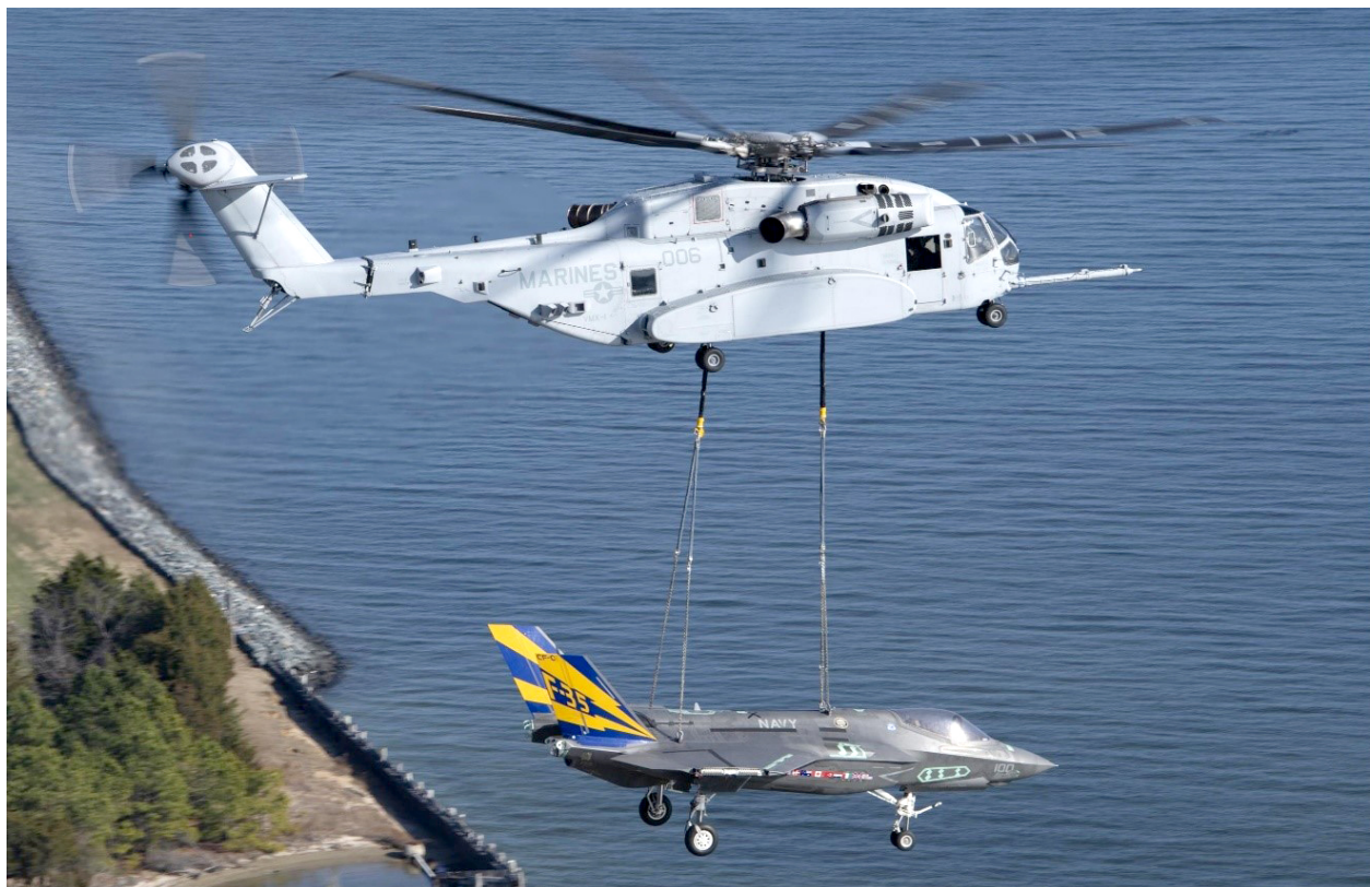
Figure. CH-53K Helicopter Lifting an F-35C Lightning II Fighter Jet

The CH-53K heavy-lift helicopter is replacing the current, aging CH-53E. The primary mission of the CH-53K is to transport heavy equipment, personnel, and supplies from ship to shore. The CH-53K is designed to provide many improvements over the CH-53E, including survivability. The Figure shows the CH-53K helicopter lifting an F-35C Lightning II fighter jet.