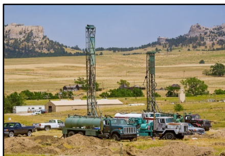
In situ Uranium Recovery Mining, Crow Butte, Nebraska

The NRC's FY 2022–2026 Strategic Plan describes the agency's mission, vision, and principles of good regulation, along with its strategic goals, objectives, and strategies. The strategic goals of continuing to foster a healthy organization and inspiring stakeholder confidence in the NRC complement the safety and security strategic goal. The safety and security strategic goal helps ensure the safe and secure use of radioactive materials.