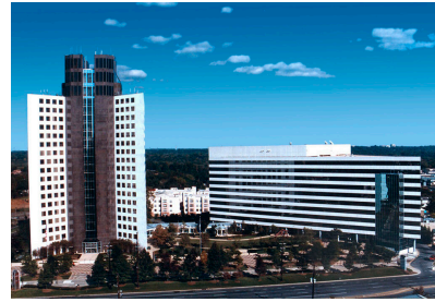
NRC Headquarters