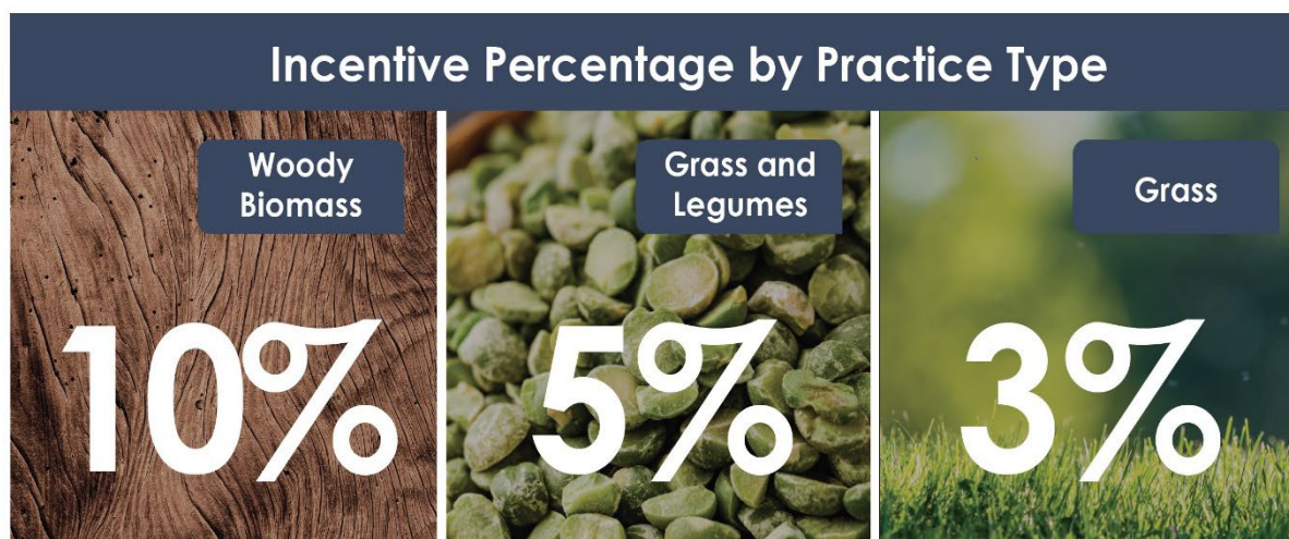
Figure 1: Practice type and amount of Climate-Smart Practice Incentive percentage. Figure by the Office of Inspector General (OIG).

Practices are broken down into the following three types in terms of the Climate-Smart Practice Incentive: (1) Woody Biomass; (2) Grass and Legumes; and (3) Grass. Each of these types has a corresponding incentive percentage based on the estimated benefits of the practice type: