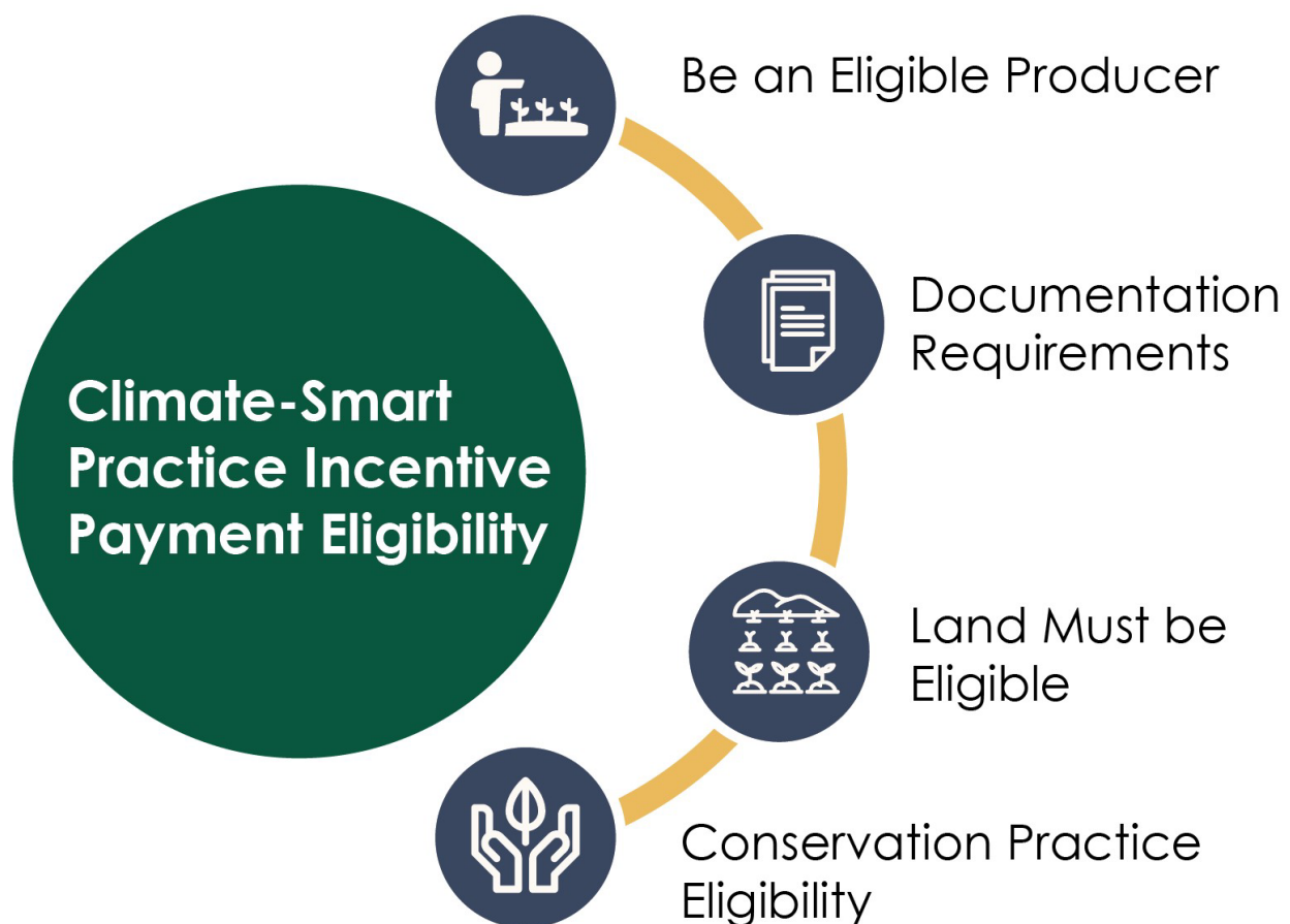
Figure 2. Climate-Smart Practice Incentive Payment Eligibility. 9 Figure by OIG.

To be eligible for a Climate-Smart Practice Incentive payment the following requirements must be met, as outlined in Figure 2: