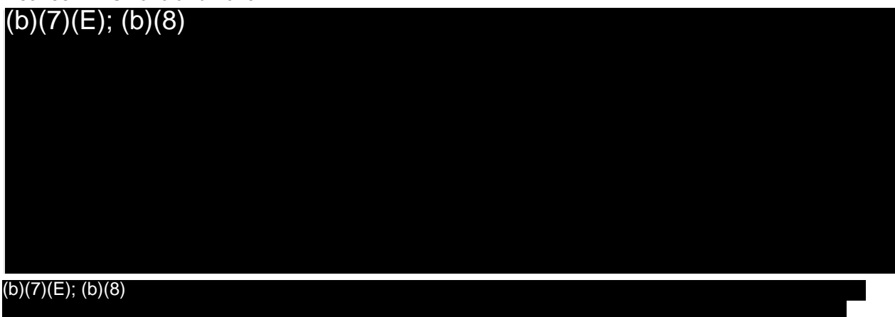
Figure 2. Annual Average Number of Broker-Dealer Examinations Completed by SEC Office Between FYs 2020 and 2023

Priorities, Initiatives, and Performance Goals. Each year, EXAMS releases a public statement to inform investors and registrants of the key risks and examination topics that the Division plans to prioritize.<sup>5</sup> Additionally, EXAMS' leadership approves thematic initiatives involving a series of related examinations of multiple entities to examine priority issues, target certain practices, assess compliance with selected laws and rules, and/or assess the industry's response to particular events, among other things. The SEC also publicly releases annual performance plans and performance reports required by laws and regulations regarding strategic planning and performance. These performance reports include two goals for EXAMS' broker-dealer examinations with the following metrics: (1) the percentage of broker-dealers examined during the year, and (2) the number of examinations (to include broker-dealer examinations) that request information related to an entity's information security.<sup>6</sup>