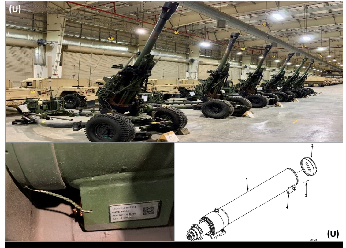
(U) Figure 2. M119A3 Howitzers (Top) with Recuperator Cap Safety Wire (Bottom Left) and Recuperator Components (Bottom Right)

(U) capable status. We observed, with a Howitzer Specialist from the U.S. Army Tank-Automotive and Armaments Command, that the safety wires had chipped paint and other indicators of wear, indicating that that the APS-5 contractor did not cut the safety wire to service the howitzer, and then insert a new safety wire. The howitzer equipment-specific technical manual states that not performing maintenance to the recuperator results in the howitzer being non-mission capable. See Figure 2 for a picture of the M119A3 howitzers and recuperator cap safety wire at Camp Arifjan, Kuwait, and a graphic of the recuperator (1), recuperator cap (2), safety wire (3), and recuperator mounting bracket (4).