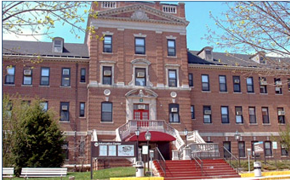
Figure 2. Edith Nourse Rogers Memorial Veterans’ Hospital, Bedford, Massachusetts. Source: Bedford VA Healthcare System; area manager, June 12, 2023.

An OIT representative indicated the VA Bedford Healthcare System consists of the Edith Nourse Rogers Memorial Veterans’ Hospital, shown in figure 2, and the Gloucester, Haverhill, and Lynn VA clinics. The Edith Nourse Rogers Memorial Veterans’ Hospital managed 16,947 unique outpatients in FY 2023. It houses 356 beds, including 238 community living beds and a 51-bed domiciliary for veterans who are experiencing homelessness or at risk of homelessness. The facility has 1,514 full-time employees and a budget of $225 million for FY 2023.