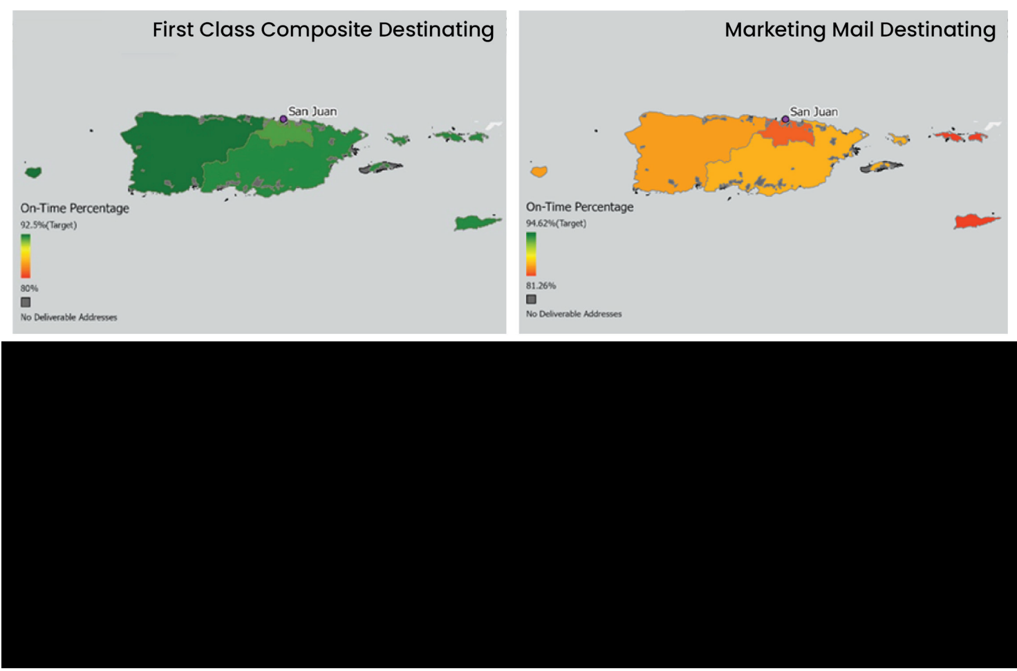
Figure 3. Service Performance Heat Maps By 3-Digit ZIP Code in the Puerto Rico District Between October 1, 2023, and March 31, 2024

IV provides comprehensive and integrated capabilities for data-driven real-time service performance measurement and diagnostics of market-dominant products, mail inventory and predictive workloads of all mail to include packages, and end-to-end tracking and reporting for mail. EDW is a repository intended for all data and the central source for information on retail, financial, and operational performance.