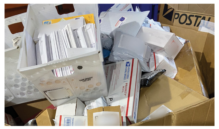
Delayed Mail at Toa Baja Post Office

Delayed Collection Mail at Bayamon Post Office