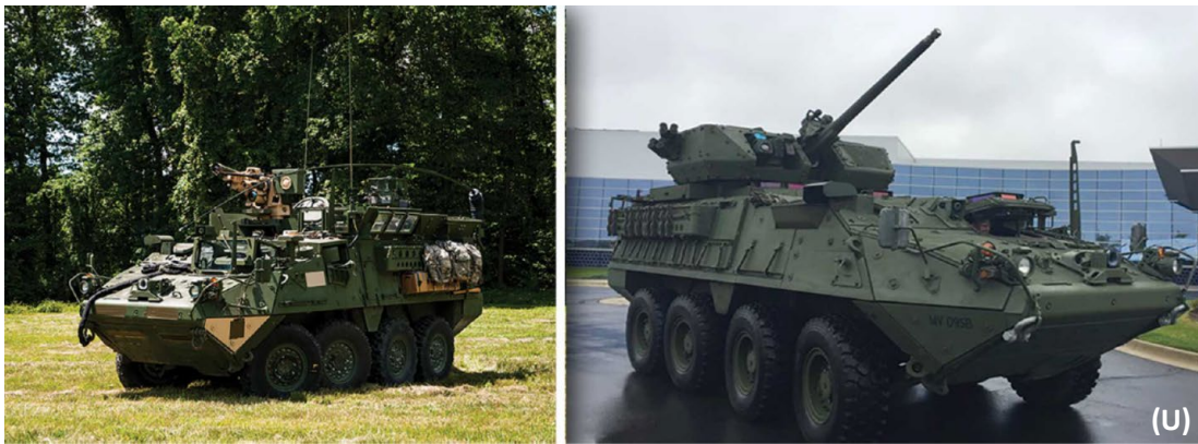
(U) Figure 3. Bradley (Top) and Stryker (Bottom) Fighting Vehicles (U)

(U) According to 7th ATC personnel, the Army trained UAF personnel based on the time the 7th ATC had available to train them, and not the Army standard. Personnel from the 7th ATC explained that the limited time they had to train the UAF was determined by the Ukrainian government. Therefore, they structured the training based on the time they had with UAF personnel, which was 5 weeks per battalion, or 35 days. In contrast, the same collective training for another nation during peacetime would take up to 60 days.