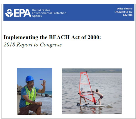
Cover of the EPA's 2018 Report to Congress.

• In July 2019, issued a swimming season report, <u>EPA-820-F-19-002</u>, which covers the 2018 swimming season. Although not mandated by the BEACH Act and not regularly