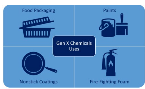
Examples of GenX chemicals uses. (EPA OIG graphic)

Determine the extent to which the EPA is using and complying with applicable records-management and quality-assurance requirements and employee performance standards to review and approve new chemicals under the Toxic Substances Control Act to manage human health and environmental risks.