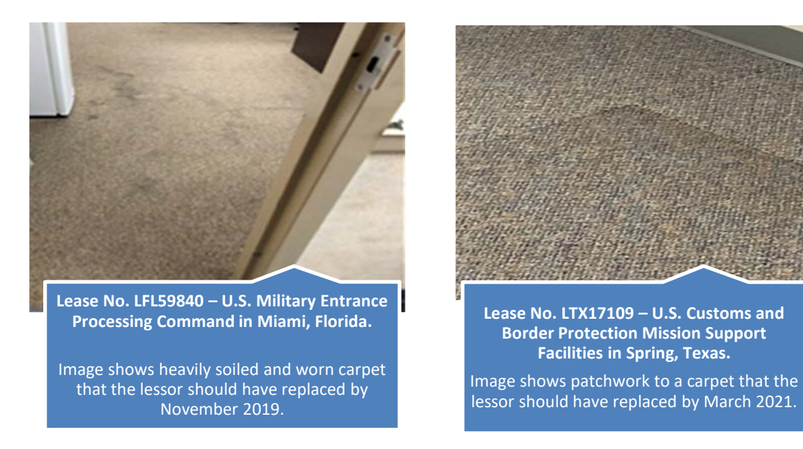
Figure 3 – Examples of Carpeting That Was Not Replaced<sup>3</sup>

• Carpeting was not shampooed for 8 of the 36 leases sampled (22 percent). The examples in Figure 4 on the next page show carpets in two tenant-leased spaces that the lessor should have shampooed in January 2021 and June 2021, respectively.