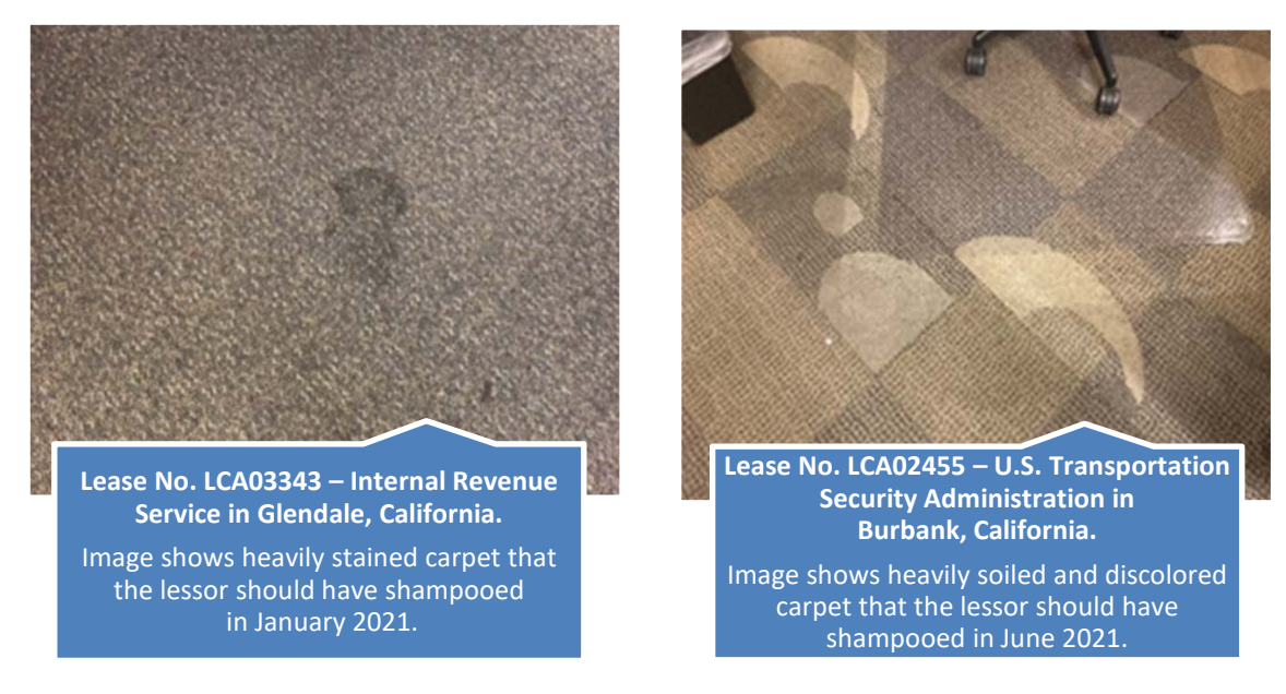
Figure 4 – Examples of Carpeting That Was Not Shampooed<sup>4</sup>

• Cyclical repainting was not completed for 4 of the 36 leases sampled (11 percent). The examples in Figure 5 show two tenant-leased spaces that the lessor should have repainted in May and June 2020, respectively.