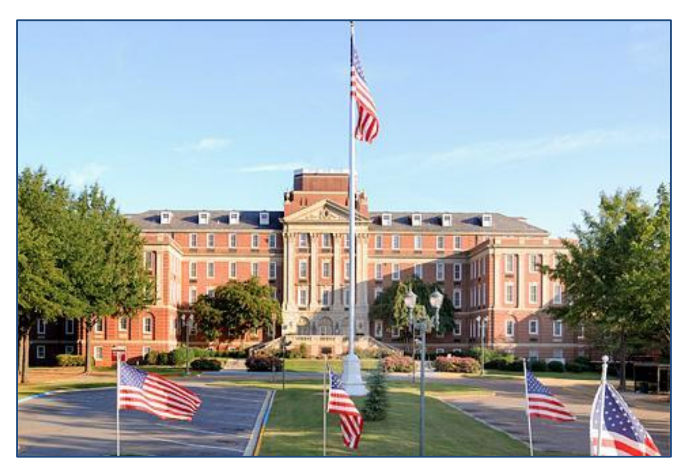
Figure 2. Tuscaloosa VAMC.