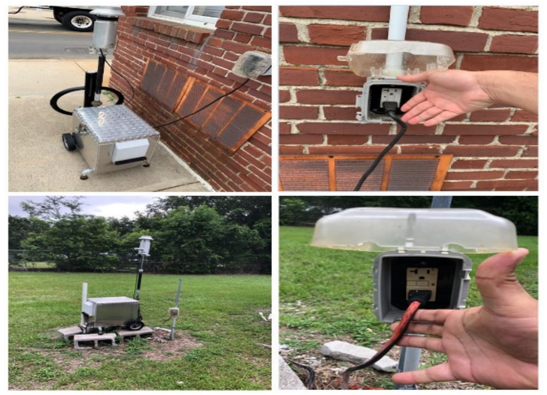
Figure 3. Unsecured PSUs

We validated PSU security deficiencies through our observation of 6 of 17 PSU equipment locations in three states (Massachusetts, Illinois, and Florida), where the jurisdictions did not properly secure the PSUs and their respective power sources. In these six locations, PSUs did not have physical security barriers or locks. Therefore, the PSU power supplies for these units could be compromised by being unplugged, tampered with, vandalized, or stolen. Figure 3 shows two examples of PSUs that were not properly secured.